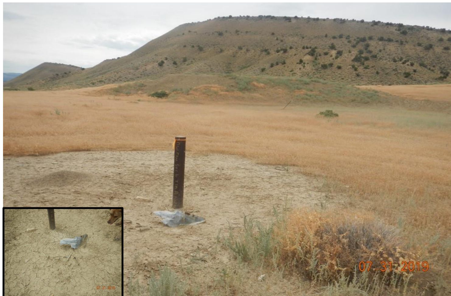
Photo#1: Overview of location to Southeast. Insert is of cellar installation at marker.