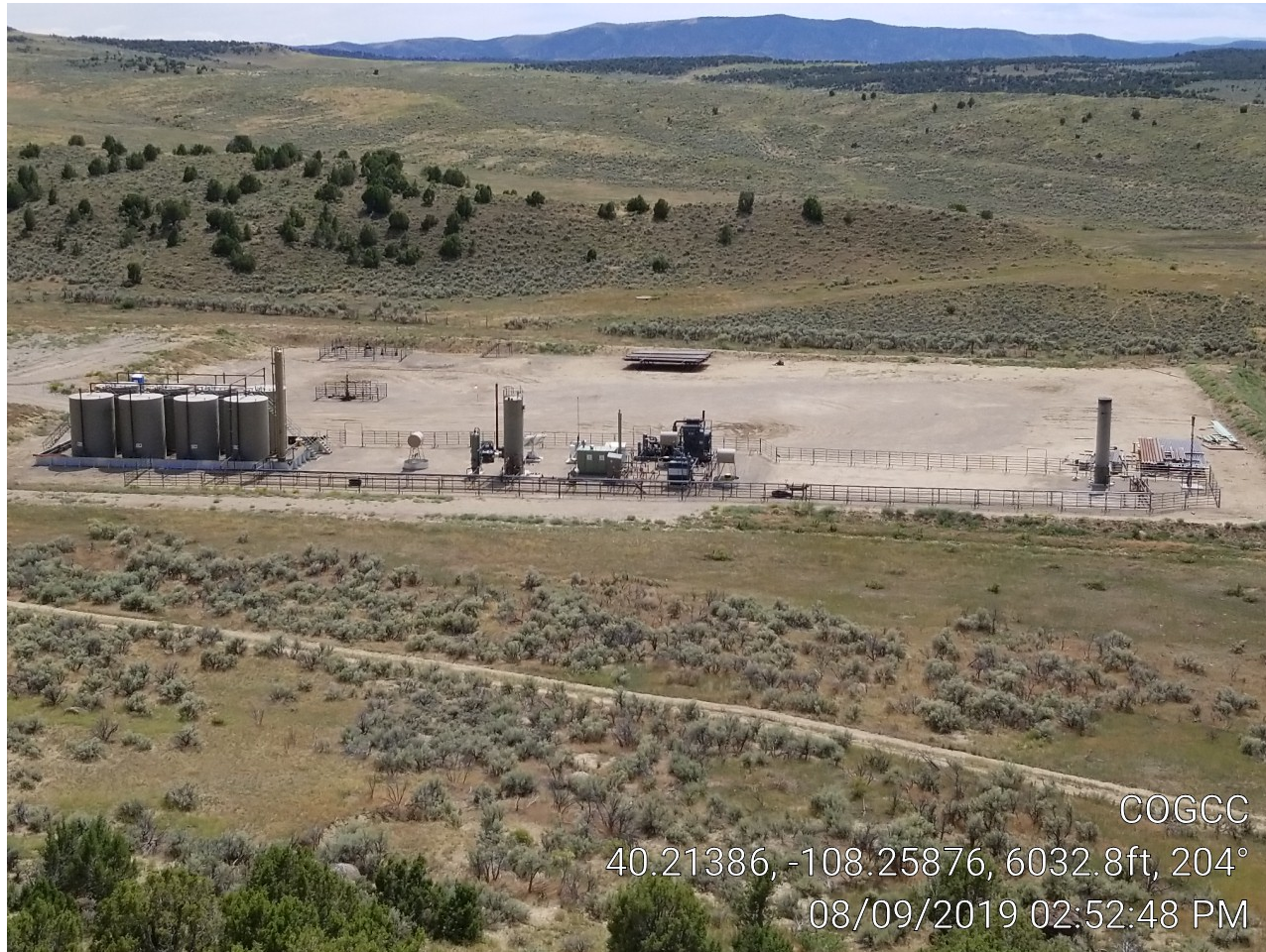
Photo 1. Location.