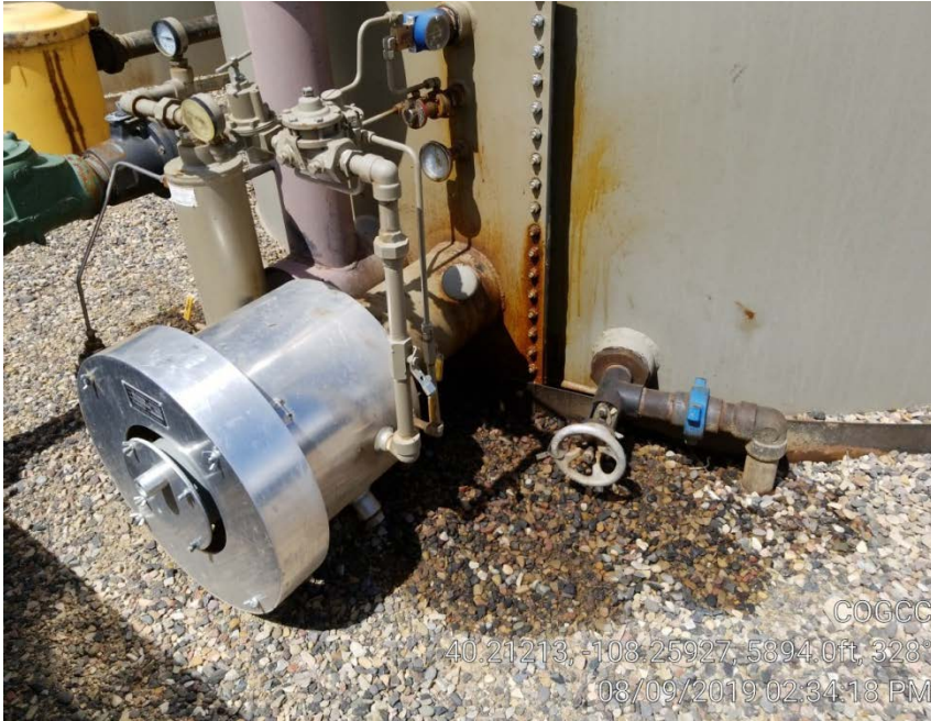
Photo 4. Stained gravel.