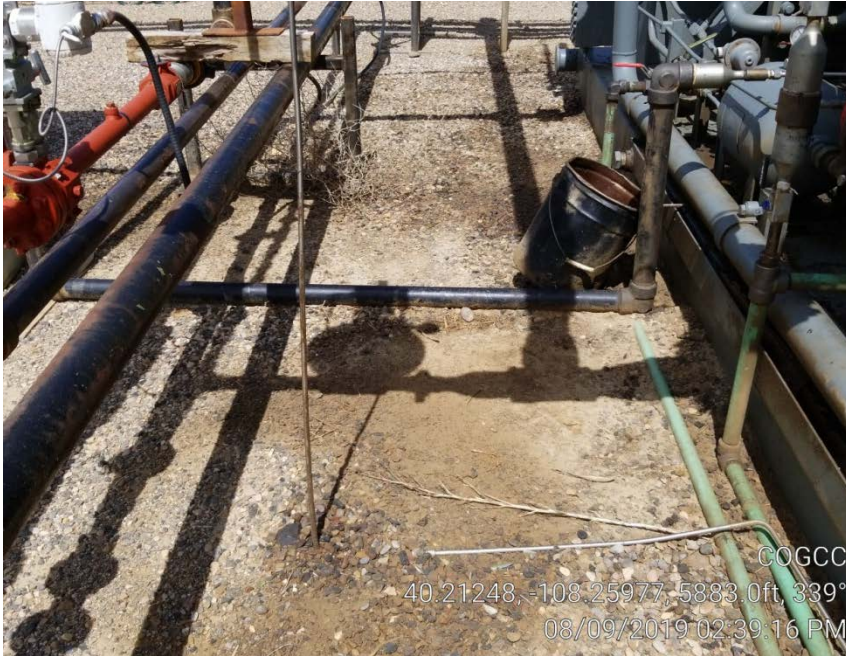
Photo 6. Stained soil near separator.