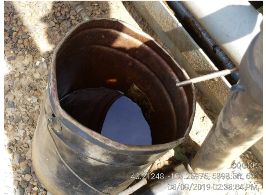
Photo 3. Bucket next to separator containing dark fluid without wildlife protection.