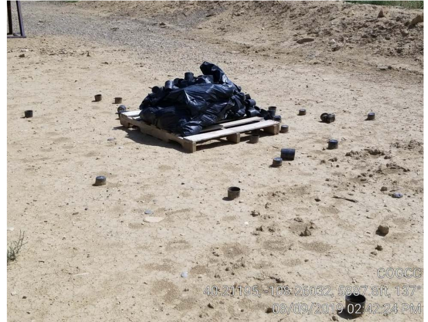
Photo 7. Pipe end caps.