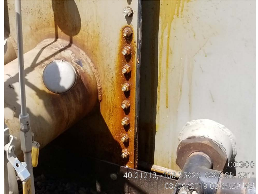
Photo 5. 500 bbl tank leaking oil.