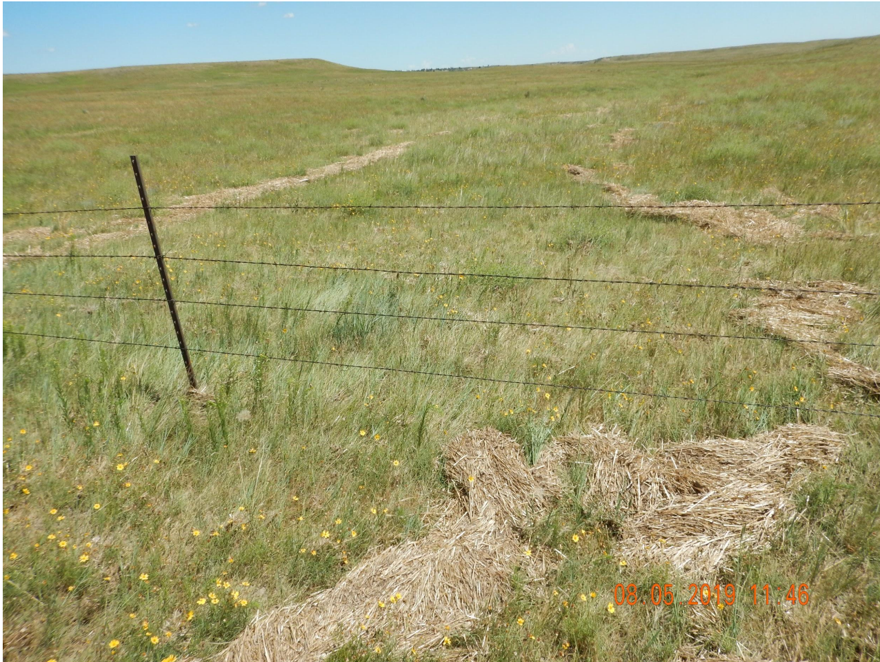
Photo 5. Close up photo taken from the eastern discharge point, facing East.