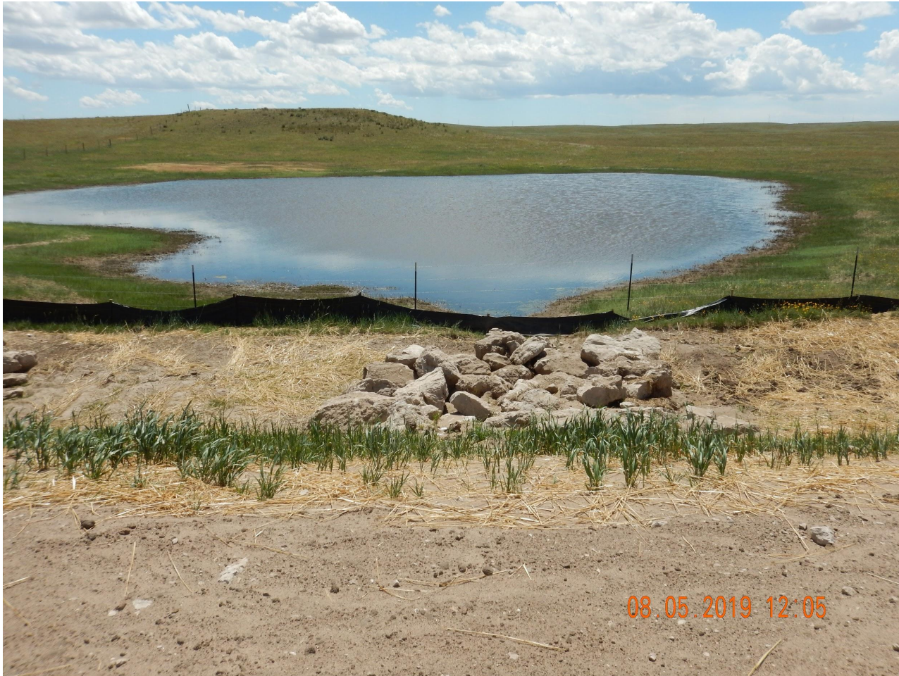
Photo 1. Photo taken from the southern location, facing South. Photo illustrates Operator has constructed the location right adjacent to the Freshwater Pond. The current stormwater BMPs are not sufficient to protect the Freshwater Pond.