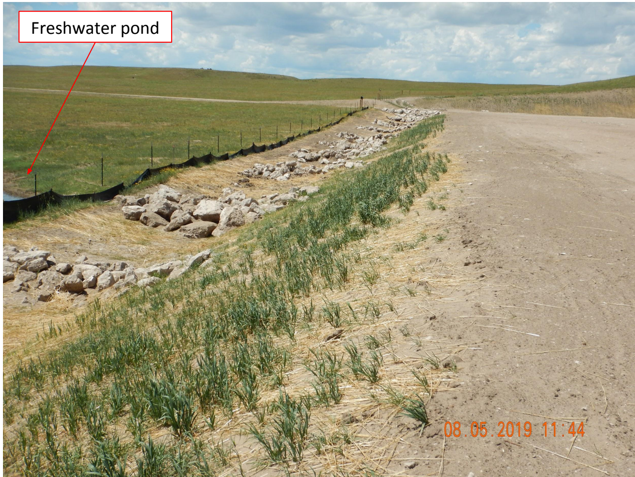
Photo 2. Photo taken from the southern location, facing West. Photo illustrates a ditch BMP installed with check dams and silt fence. Silt fence is in need of repair. The current stormwater BMPs are not sufficient to protect the Freshwater Pond. The observed vegetative growth along the fill slope consists mostly of a cover crop.