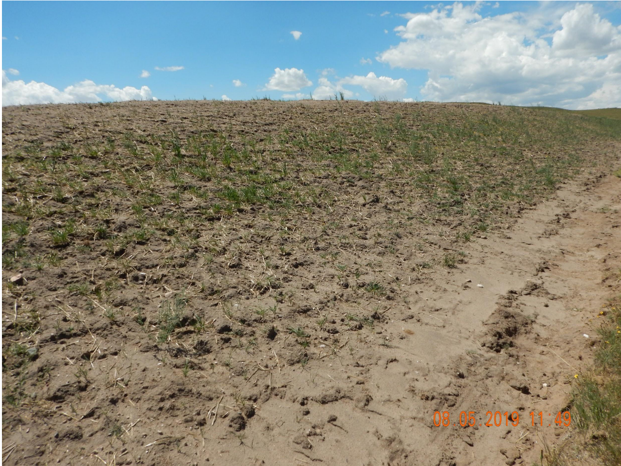
Photo 7. Photo taken from the topsoil stockpile along the northern location, facing North. Photo illustrates Operator has seeded the stockpile which is currently in-process.