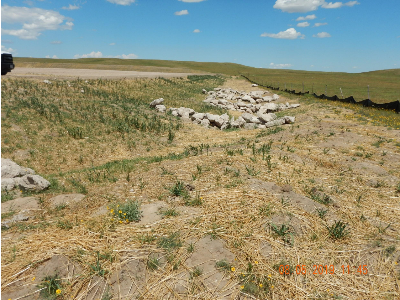
Photo 3. Photo taken from the southeastern location, facing North. Photo illustrates a ditch BMP installed with check dams and silt fence. Silt fence is in need of repair.