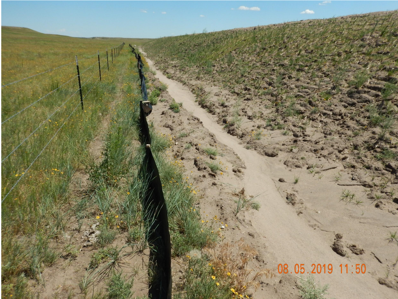
Photo 8. Photo taken from the topsoil stockpile along the northern location, facing East. Photo illustrates stormwater repairs are needed as the ditch BMP is fill in from sediment accumulation from topsoil stockpile erosion.