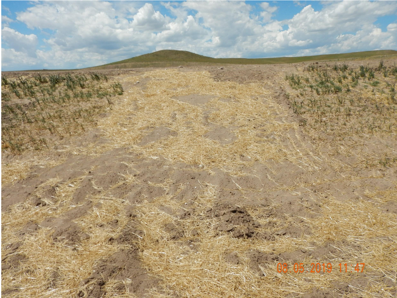
Photo 6. Photo taken from the eastern fill slope of location, facing West. Photo illustrates Operator has repaired erosion due to a recent storm.