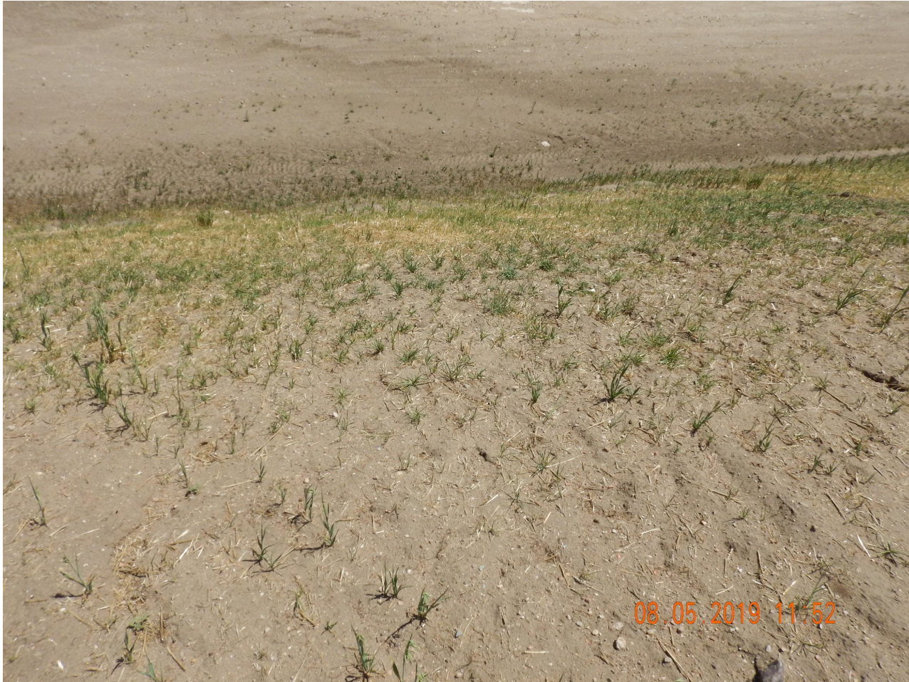
Photo 9. Photo taken from the western location, facing East. Photo illustrates the cut slope has been seeded for long-term stabilization.