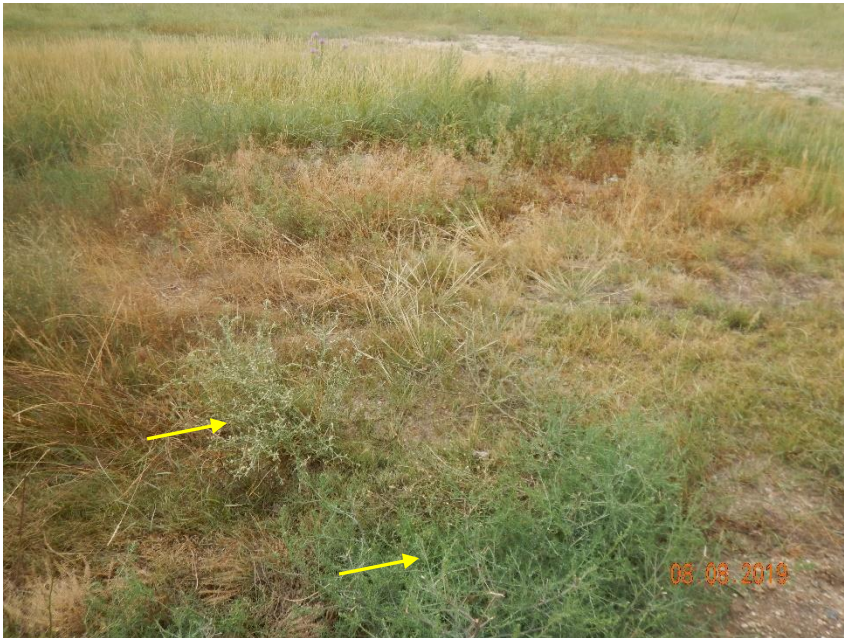
Photo 3: Photo taken from south end of the location, facing southwest. See comments under photo 1.