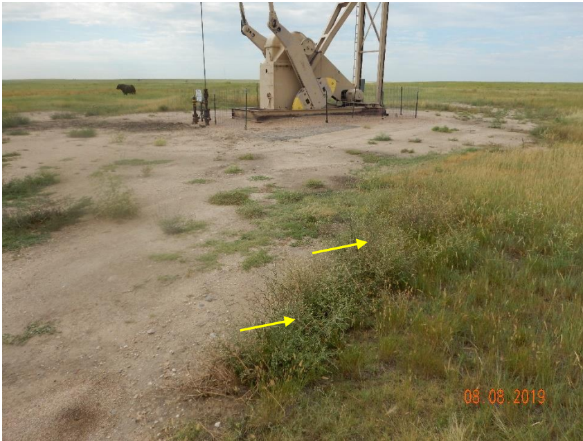
Photo 1: Photo taken from north end of the location, facing south. Photo provides an overview of the location. Photo shows Diffuse Knapweed (Plants with white flowers in photo) remains established on the location/access road. Operator has failed to conduct sufficient ongoing noxious weed management on the location.