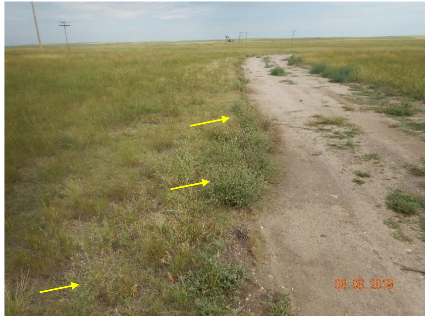
Photo 4: Photo taken from the access road, facing north. See comments under photo 1