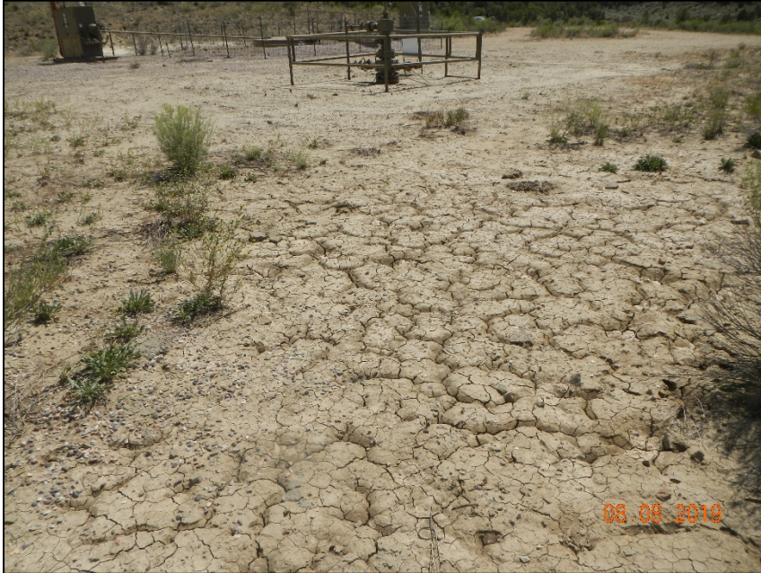
Photo #12 Erosion channel moving sediment off location by wellhead.