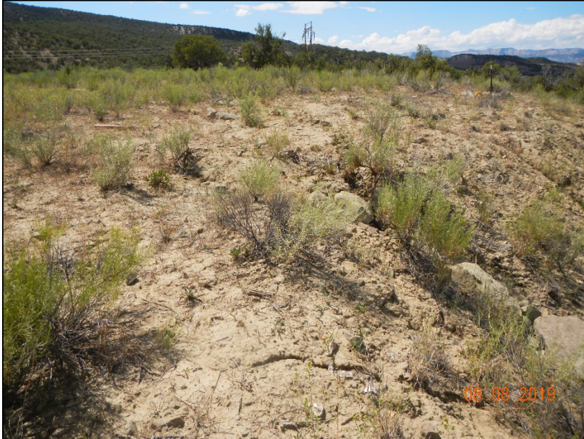
Photo #8 Photo taken on North side of location of heavy channeling and erosion do to no slope stabilization. Vegetation is being choked out by sediment moving off location. No BMP's in place to slow or stop sediment movement