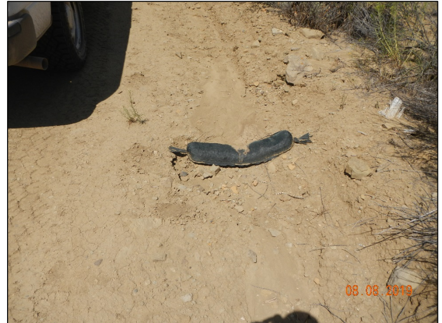
Photo #19. Erosion sediment moving off location and down access road at the entrance to location. BMP needs maintenance.