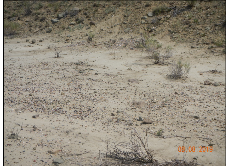
Photo #15 Erosion is evident along un-stabilized slope at the East side of location. Vegetation has been choked out by sediment.