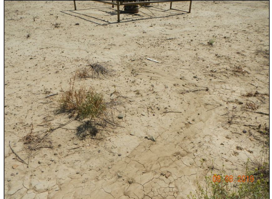
Photo #13 Erosion channel moving sediment off location by wellhead.