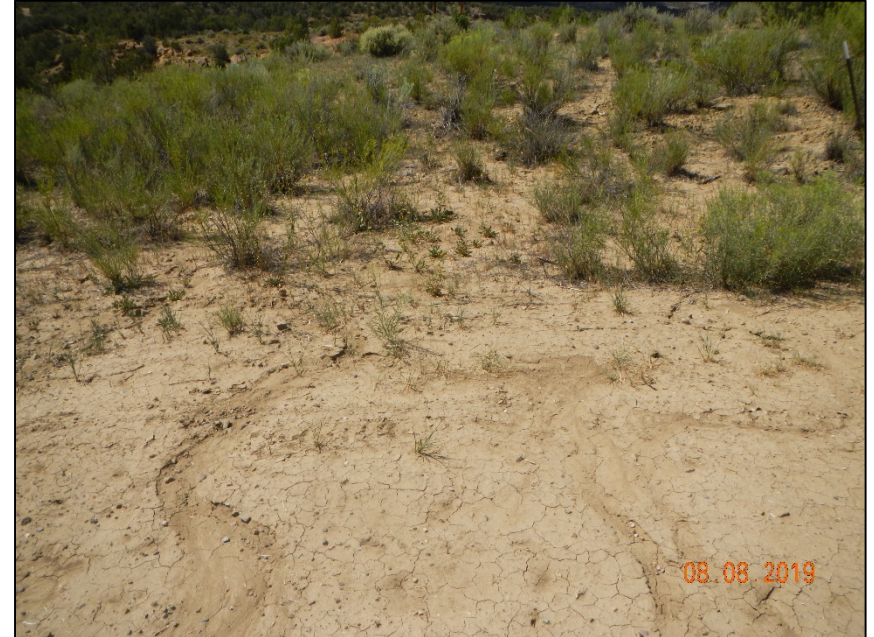
Photo #17. . Erosion sediment moving off location on the North/West side of location, choking out vegetation.