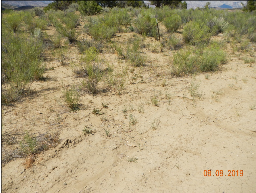
Photo #16. Erosion sediment moving off location on the North/West side of location, choking out vegetation.