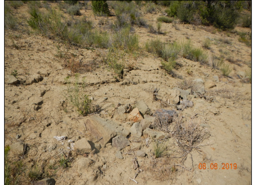
Photo #7 Photo taken on North side of location of heavy channeling and erosion. Vegetation is being choked out by sediment moving off location. No BMP's in place to slow or stop sediment movement