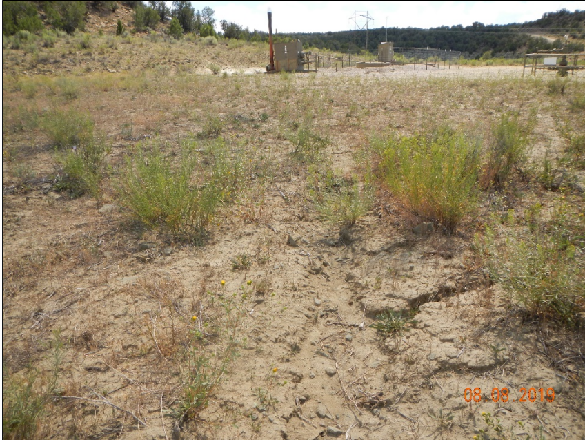
Photo #10 Erosion channel moving sediment off location on the North side of location