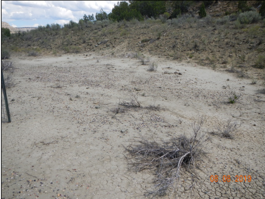
Photo #14. Erosion is evident along un-stabilized slope at the East side of location. Vegetation has been choked out by sediment.