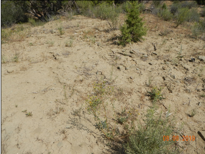
Photo #6 Photo taken on North side of location of heavy channeling and erosion. Vegetation is being choked out by sediment moving off location. No BMP's in place to slow or stop sediment movement