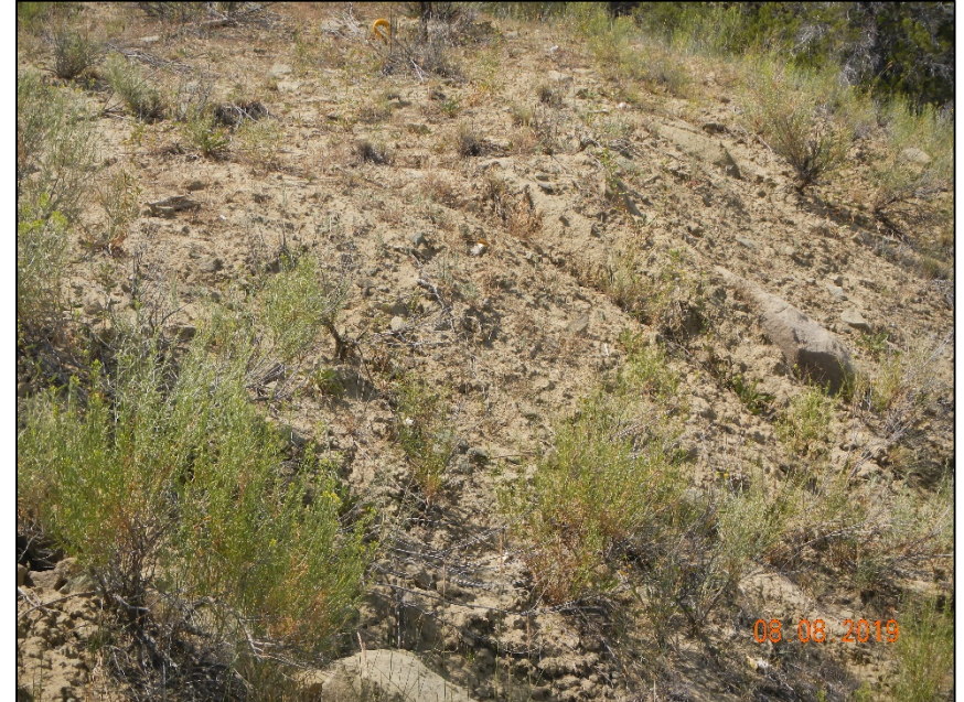
Photo #9 Photo taken on North side of location of heavy channeling and erosion. Vegetation is being choked out by sediment moving off location. No BMP's in place to slow or stop sediment movement