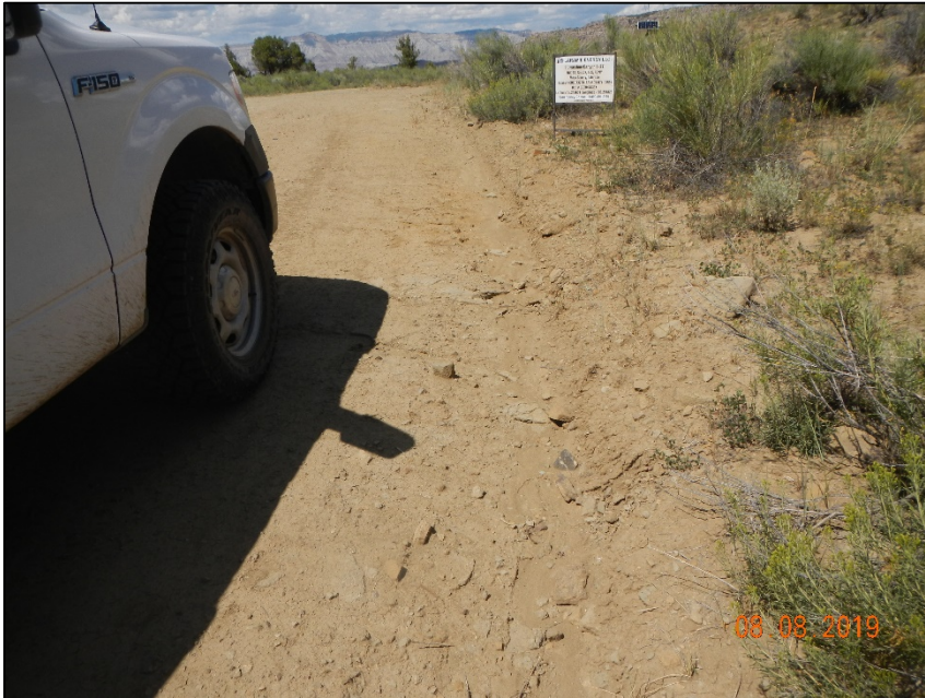
Photo #18 Erosion sediment moving off location and down access road at the entrance to location. BMP needs maintenance or is not in place.