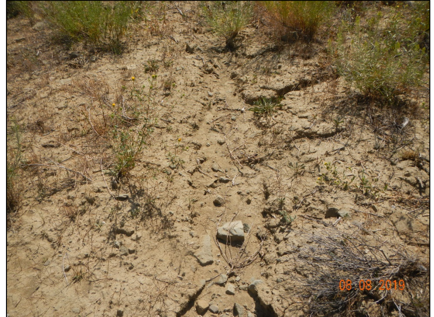
Photo #11 Erosion channel moving sediment off location on the North side of location