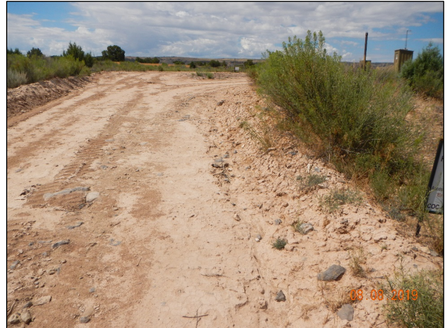
Photo #7 Erosion is moving sediment off location and down access road on both sides of location. No BMP in place to slow storm water or catch sediment.