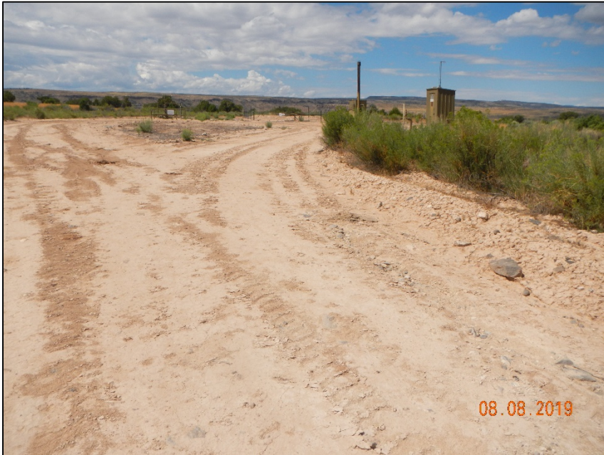
Photo #6. Erosion is moving sediment off location and down access road on both sides of location. No BMP in place to slow storm water or catch sediment.