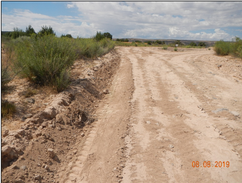
Photo #8 Erosion moving sediment off location and down access road on both sides of location