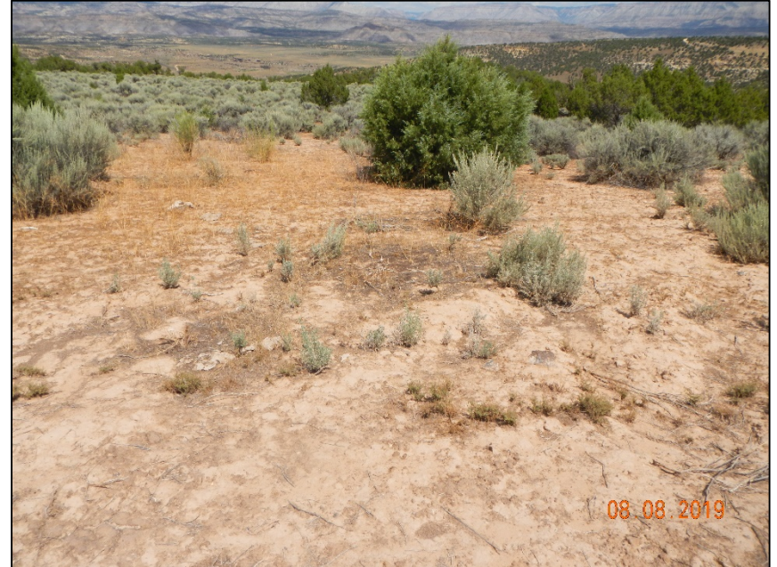
Photo # 11. Erosion moving off location over a un-stabilized slope on the NW side of location. Sediment is choking out vegetation.