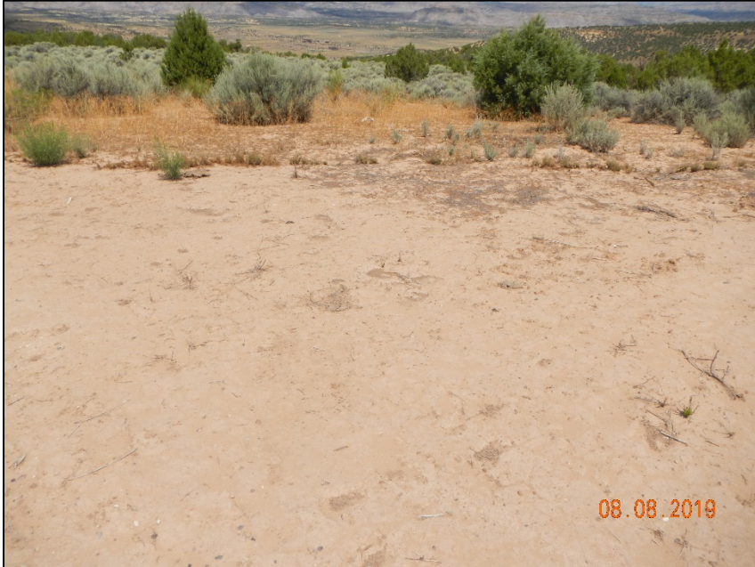
Photo #10 Erosion moving off location, over a un-stabilized slope on the NW side of location. No BMP in place to stop sediment from moving or choking out vegetation.