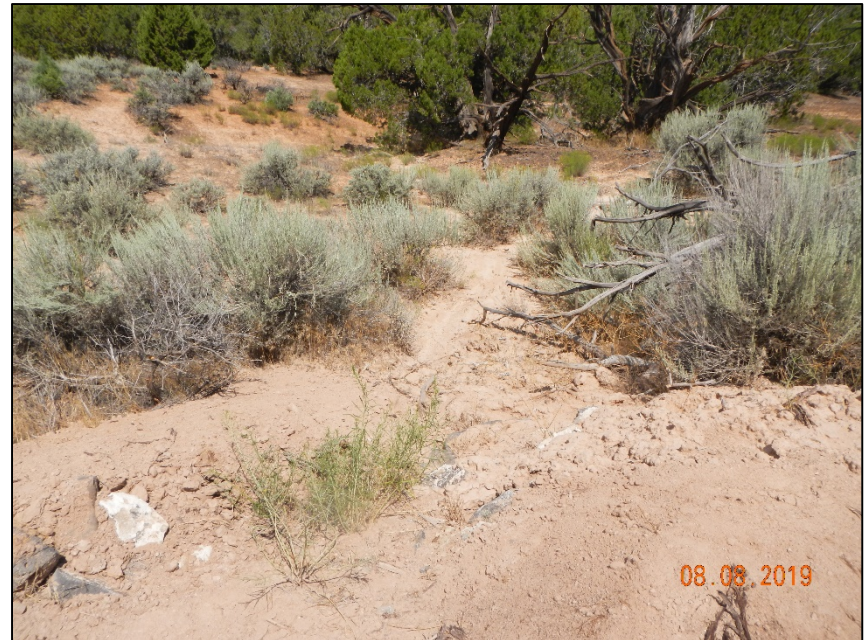
Photo #9 Turn out, made to release stormwater off access road, has no BMP's in place to catch sediment. Erosion moving sediment into ravine and choking out vegetation.