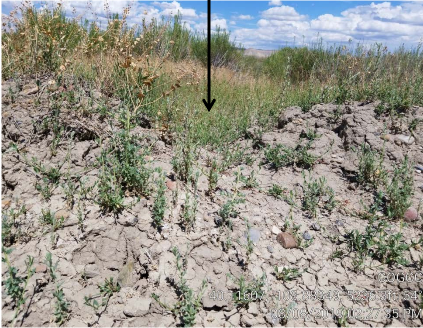
Photo 2. Location berm in NE corner.