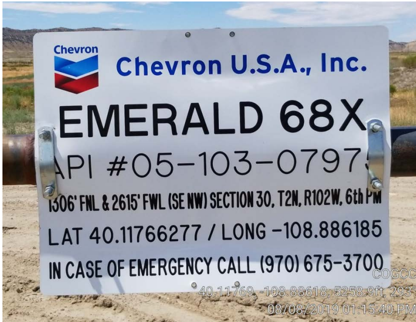
Photo 2. Well head sign.

Emerald 68X API: 05-103-07975 Inspection: 679705008