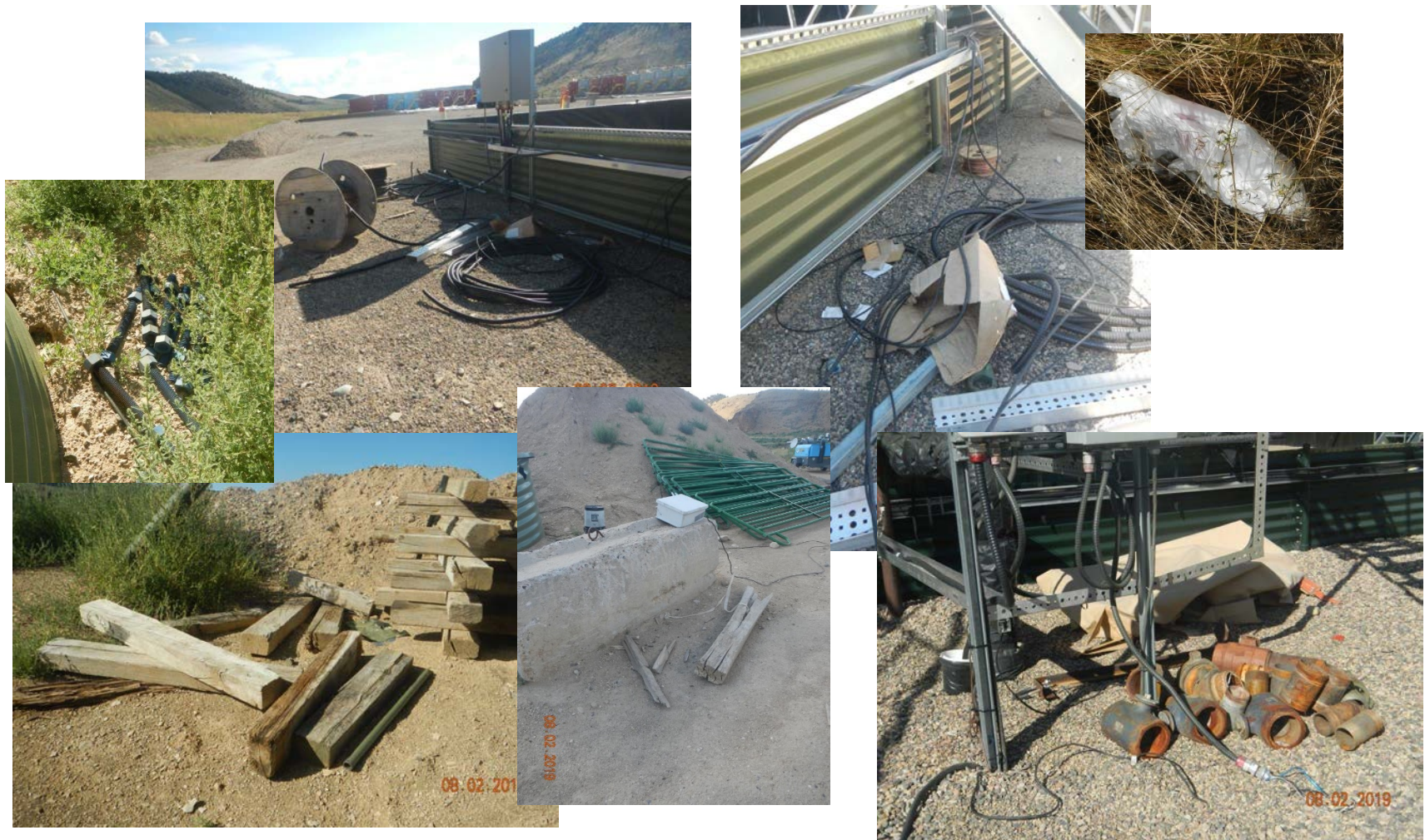
Photo#9 montage: Debris scattered across site; supplies not stored in a workman like manner.