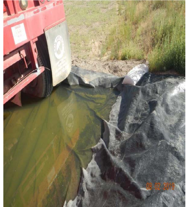
Photo#4: Containment around Frac tanks at SW corner has only 4" of freeboard.