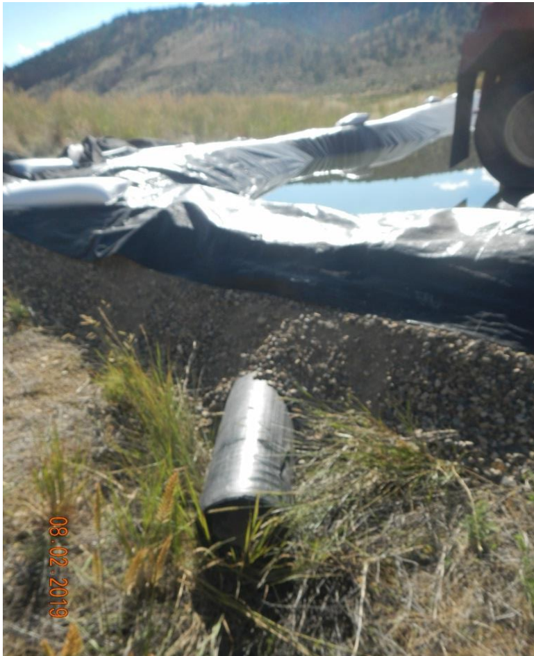
Photo#5: Pipe installed to convey stormwater under Frac tank containment at SE corner of pad.