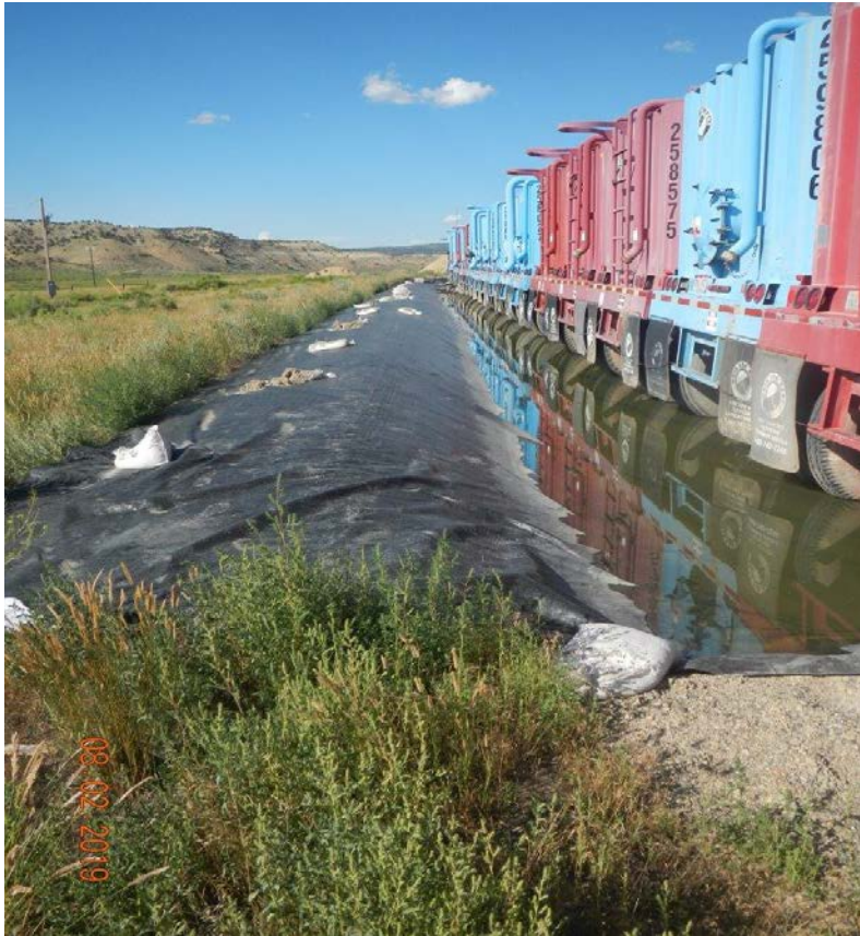
Photo#3: Containment around Frac tanks at SW corner has only 4" of freeboard.