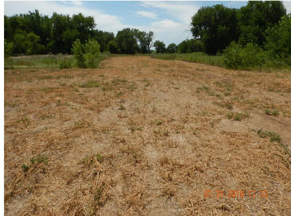
Photo 2. Photo taken from the central location, facing West. See comments under Photo 1.