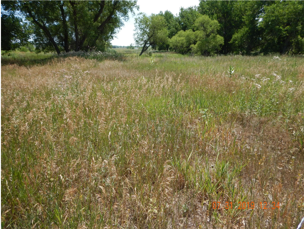
Photo 3. Reference photo taken along the southern location, facing South.