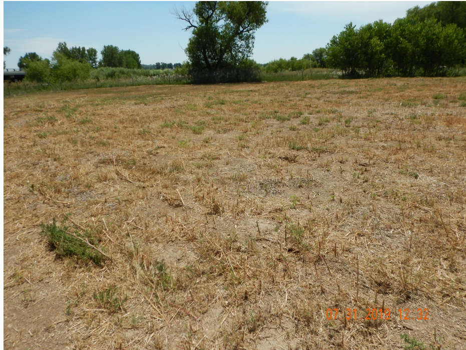
Photo 1. Photo taken from the eastern location, facing South. Photo illustrates Operator has performed final reclamation activities and appears to be performing weed management.