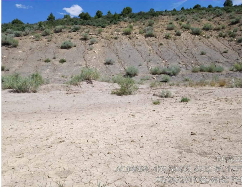
Photo 8. Stormwater sediment running off hillside unto location.