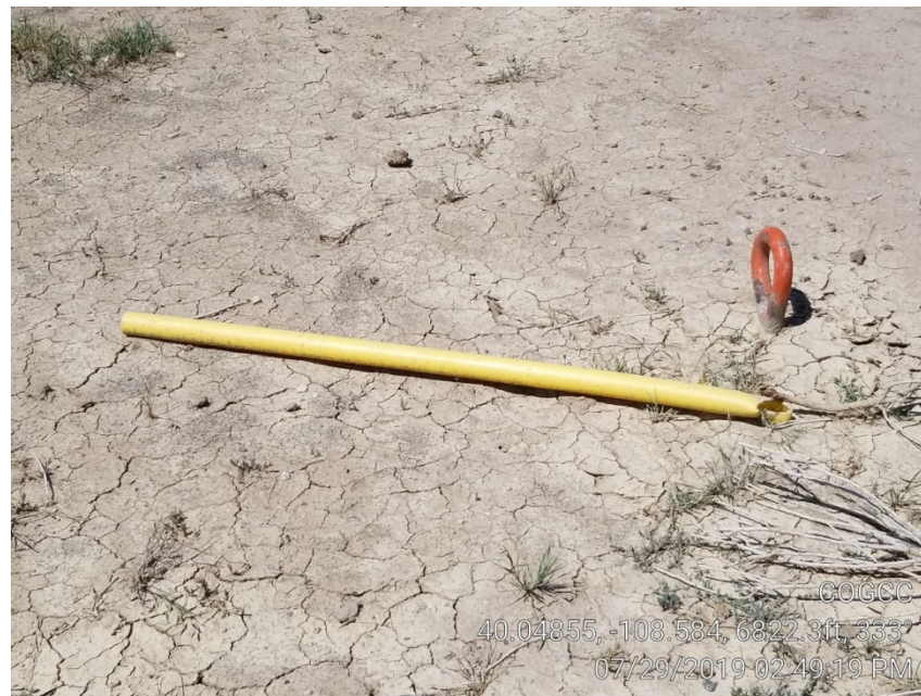
Photo 11. Fallen deadman marker.