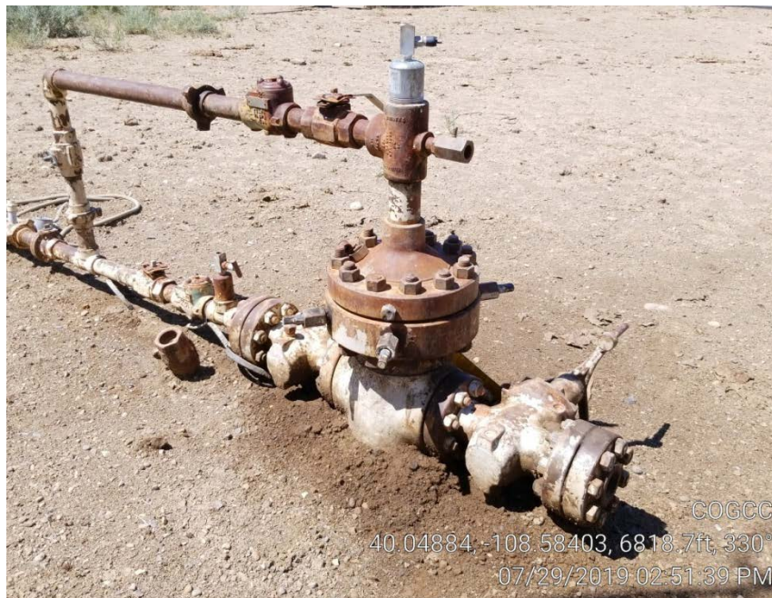
Photo 4. Soil staining at well head.