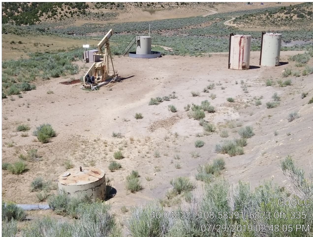
Photo 1. Location.