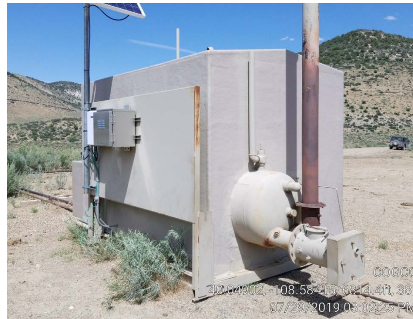
Photo 3. Separator weeds.