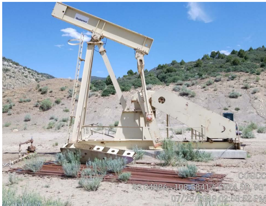
Photo 2. Pump jack weeds.