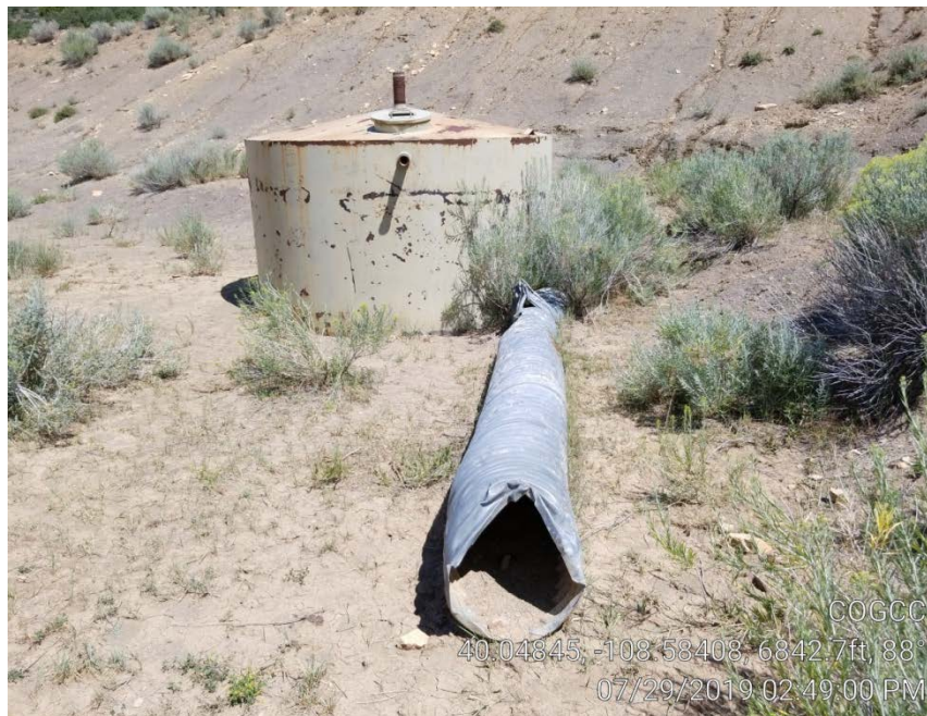
Photo 10. Damaged culvert.