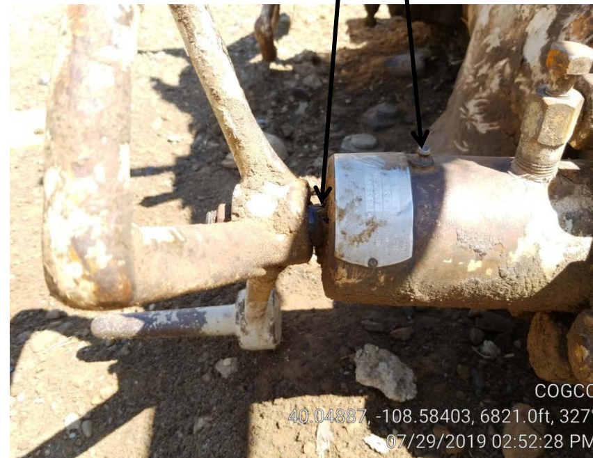
Photo 5. Casing valve gas leak.