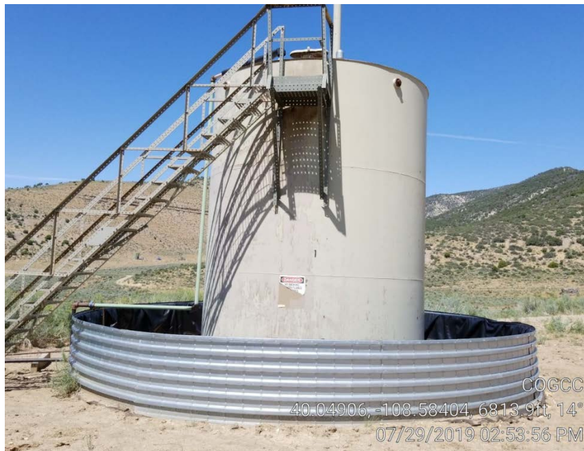
Photo 6. Tank without label.