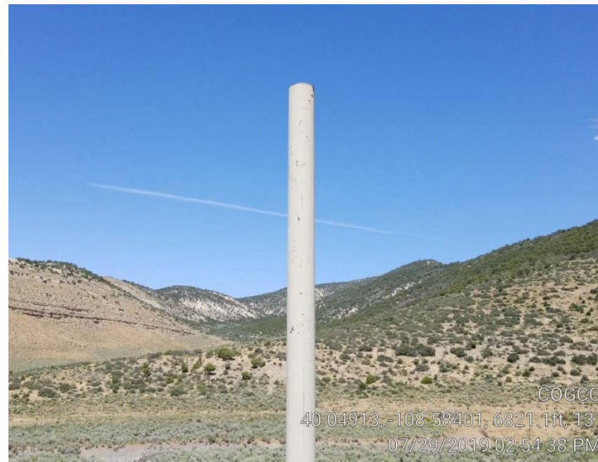
Photo 7. No apparent bird screen on tank vent.