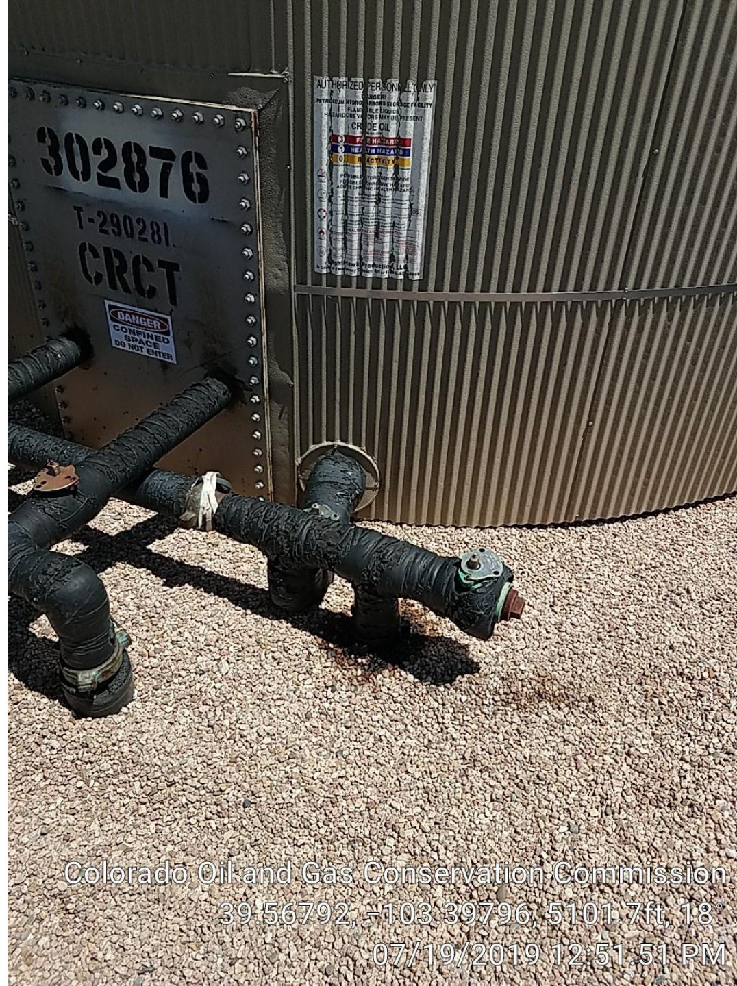
Valve leak on oil tank pipe near gate.