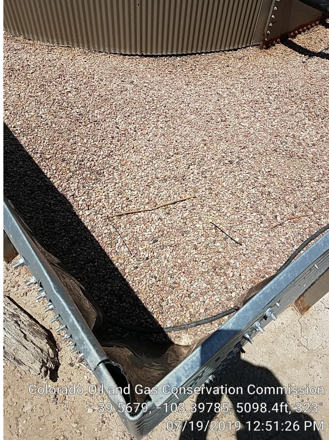
SE corner of tank berms.

Colorado Oil and Gas Conservation Commission 39.5679, -103.39785, 5098.4ft, 323° 07/19/2019 12:51:26 PM