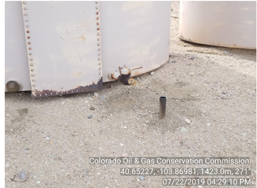
Photo #30 Sooner Unit Crude Oil tanks - drainline Stained soil Appears mitigated