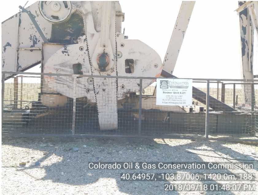
Photo #3 Sooner Unit 6-21 Wellsite Pumpjack ( North, South sides ) Stained soil previous insp.