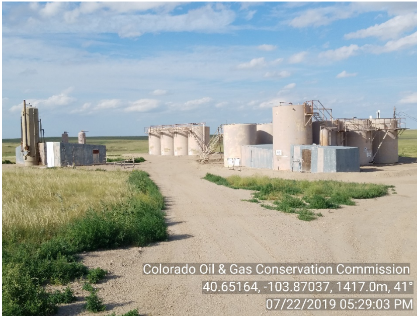
Colorado Oil & Gas Conservation Commission 40.65164, -103.87037, 1417.0m, 41° 07/22/2019 05:29:03 PM