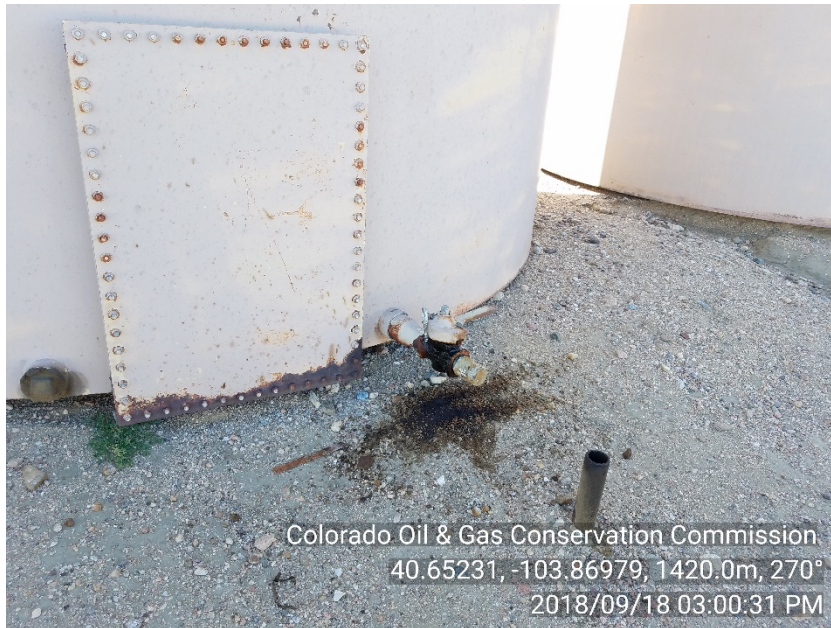
Photo #29 Sooner Unit Crude Oil tanks - drainline Stained soil previous insp.