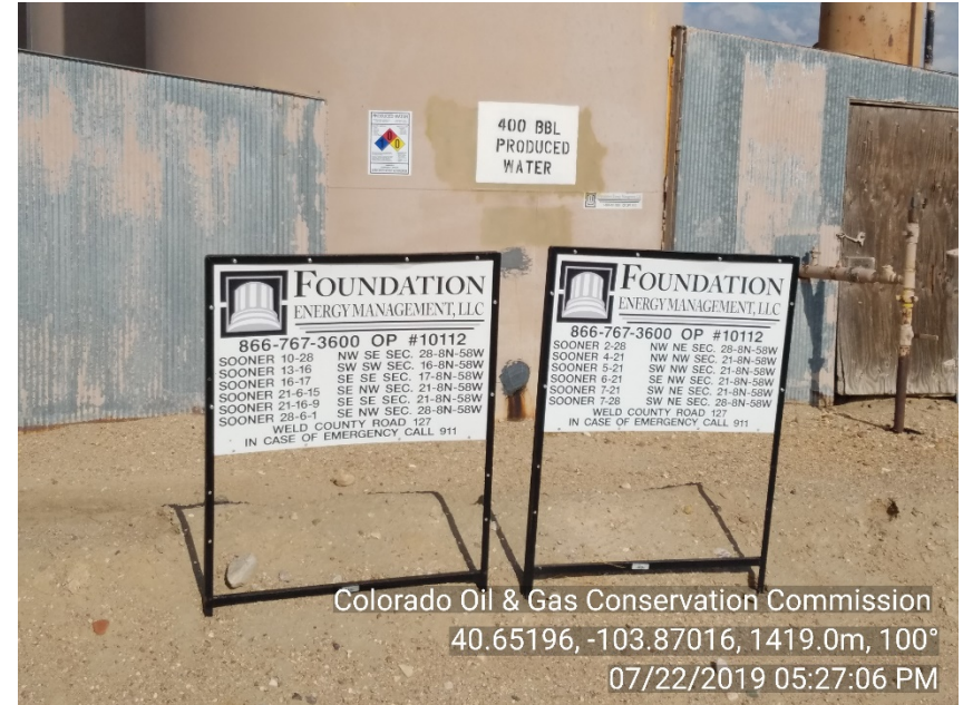
Colorado Oil & Gas Conservation Commission 40.65196, -103.87016, 1419.0m, 100° 07/22/2019 05:27:06 PM