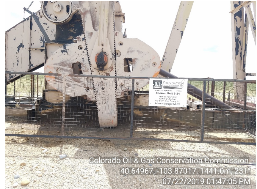
Photo #4 Sooner Unit 6-21 Wellsite Pumpjack ( North, South sides ) Stained soil - Remains