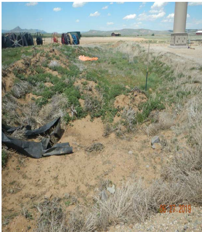
Photo#2: Trash, debris on site; human generated. And debris Weeds.