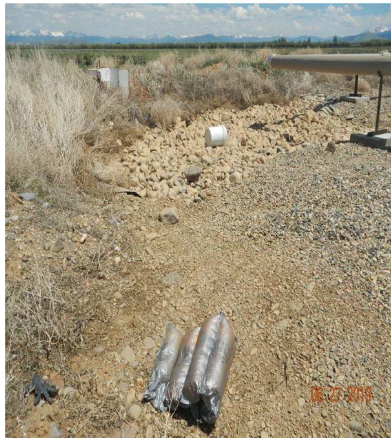
Photo#3: Trash, debris on site; human generated. And debris Weeds.