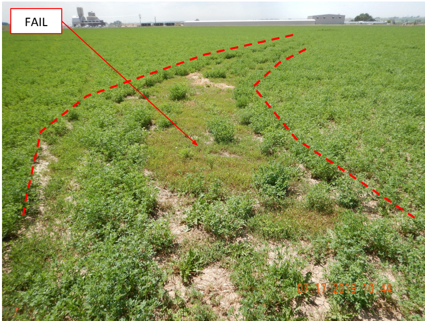
Photo 1. Photo taken from the western access road, facing South. Photo illustrates access road is not reflective of reference crop areas.