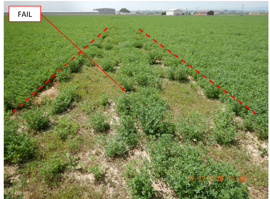
Photo 2. Photo taken from a portion of the access road, facing South. See comments under Photo 1.