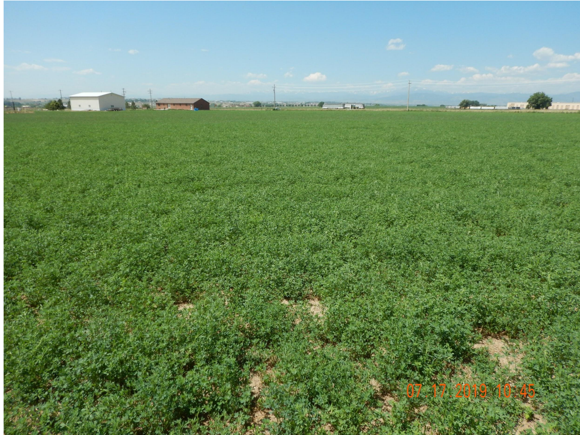
Photo 4. Reference photo taken southwest of well location, facing West. See comments under Photo 1.