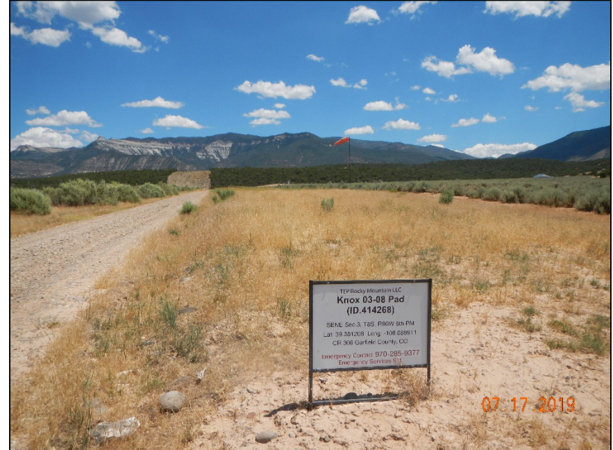
Photo #2 Photo at access road entrance. Battery sign not apparent to tank battery.