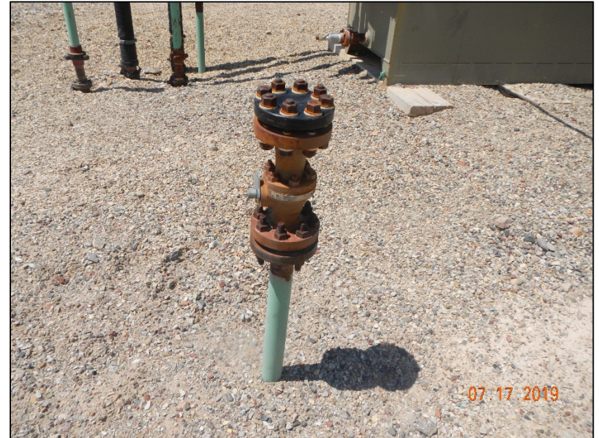
Photo # 7 Riser at Separator needs marked and Locked out tagged out and removed to complete PA status