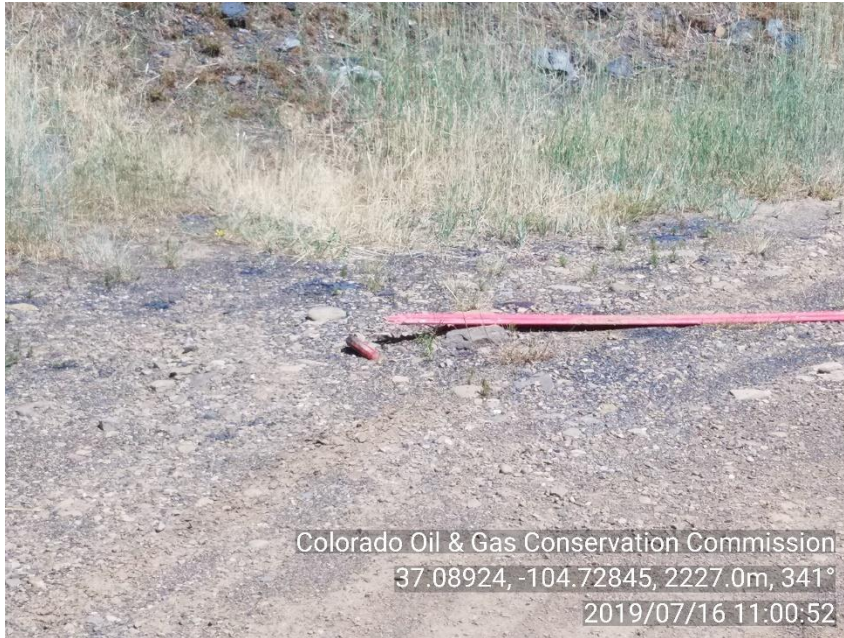
PHOTO 3: NORTHWEST GUY LINE ANCHOR MARKER IS DOWN. INSTALL GUY LINE ANCHOR MARKER COMPLY WITH RULE 1003.a. CA DATE 7-31-19