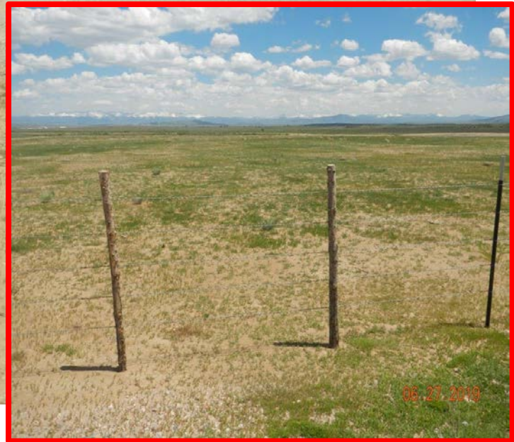
Photo#1: Overview of Location to Northeast. Insert is view South of expansion area.