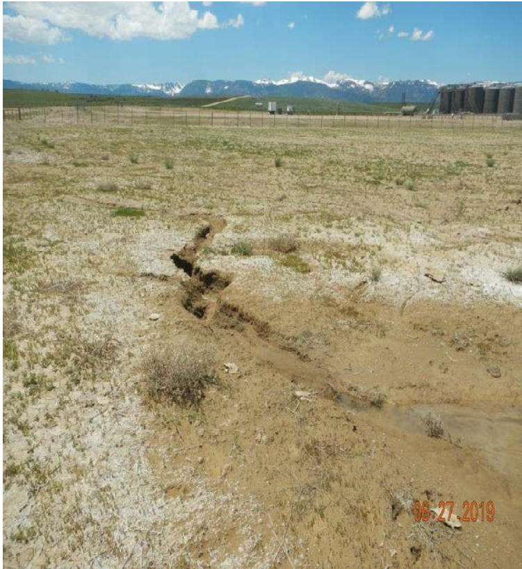
Photo#6: Erosion occurring as stormwater enters sediment reservoir.