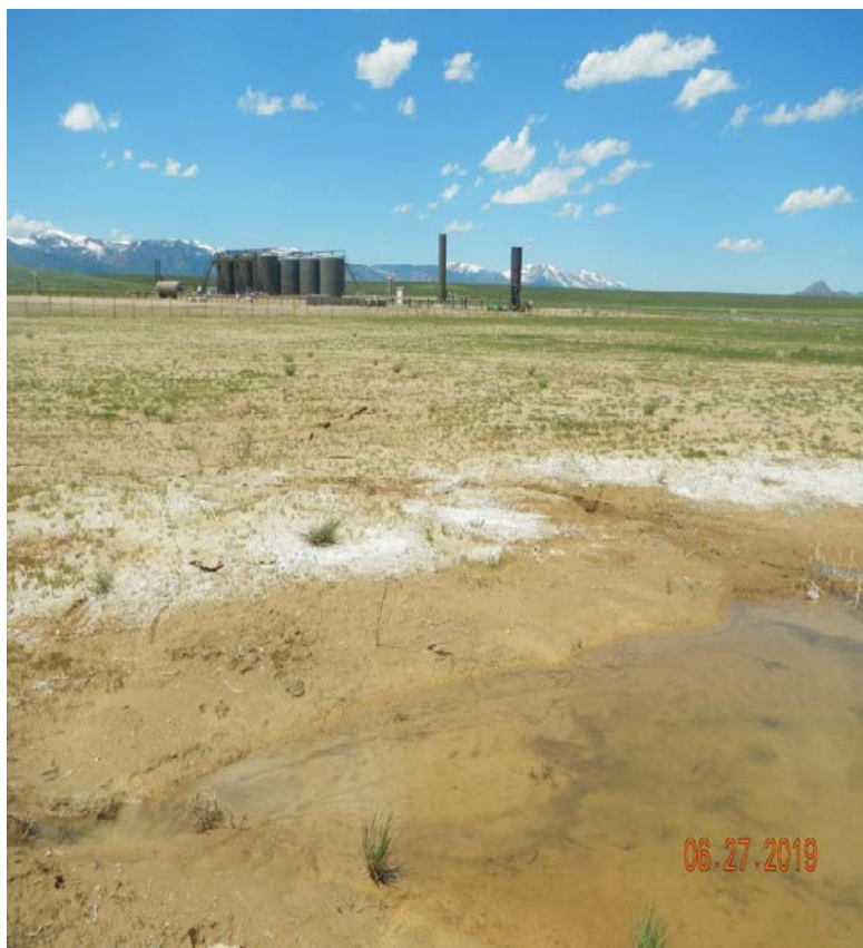
Photo#4: View from East end of expansion area back to main Location.