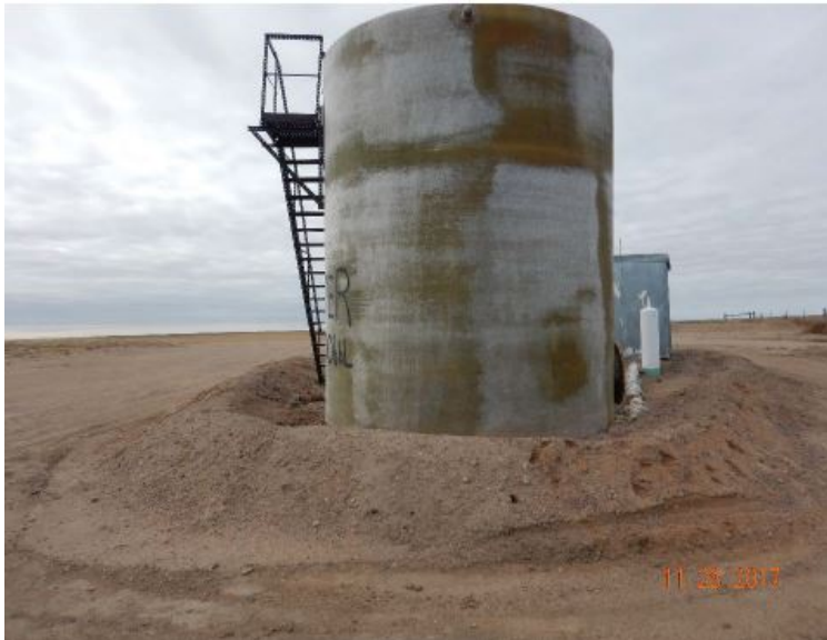
Photo #25 State 36-16 Produced H 2 O tanks Inadequate berms prior insp.