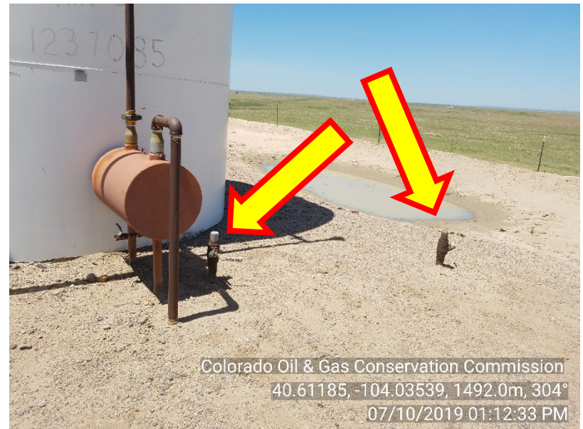
Photo #8 State 36-16 Battery – Oil Tanks 2 – Unmarked, Unused risers