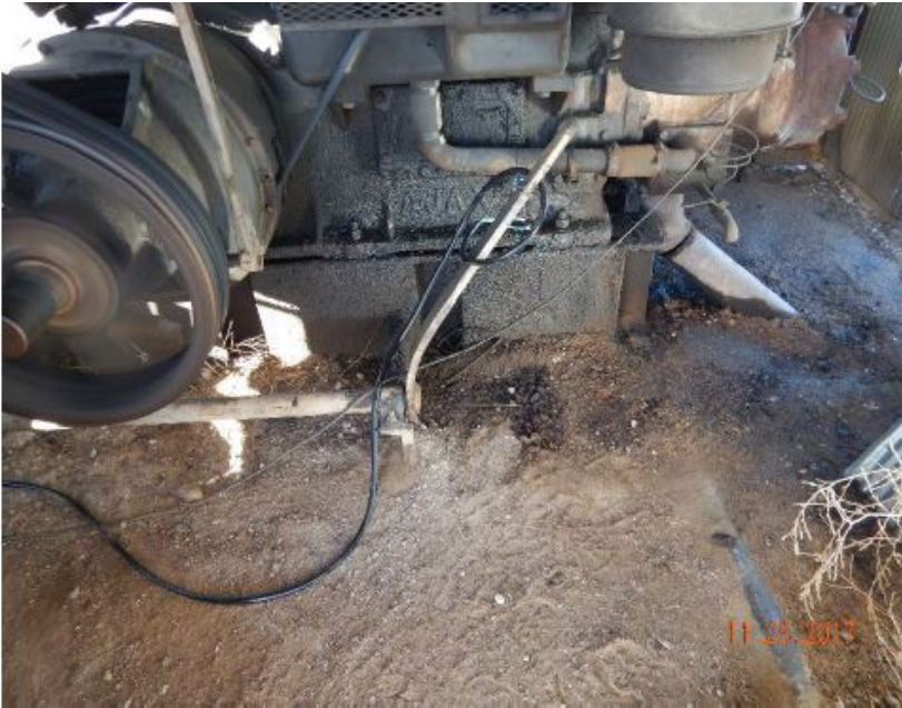
Photo #9 State 36-16 Prime Mover – Gas Engine Stained soil beneath gas engine prior insp.