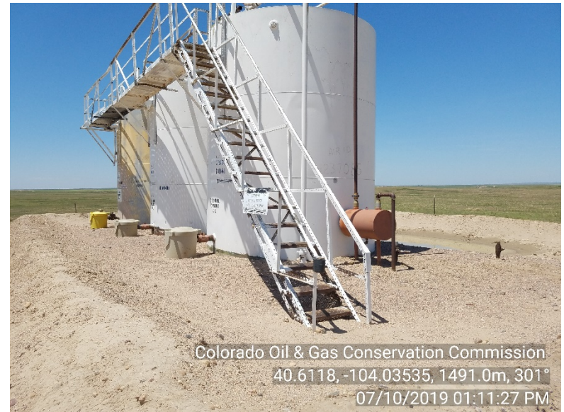
Photo #28 State 36-16 Produced Oil tanks Enlarged berms Appears mitigated