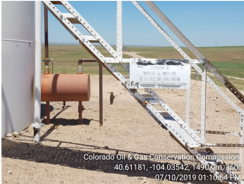
Photo #5 State 36-16 Battery sign Phone number is Legible See Photo #6