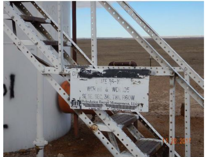
Photo #4 State 36-16 Battery sign Phone number illegible – prior insp.