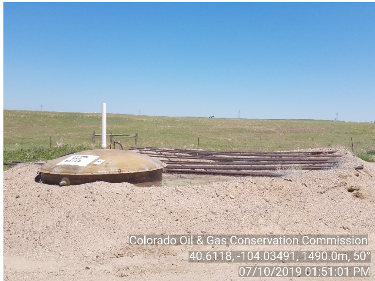
Photo #23 State 36-16 Pit Area Damaged berms, stain soil, netting gaps Appears mitigated.