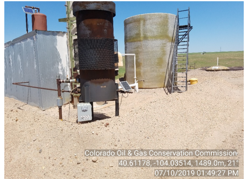
Photo #26 State 36-16 Produced H 2 O tanks Enlarged berms Appears mitigated