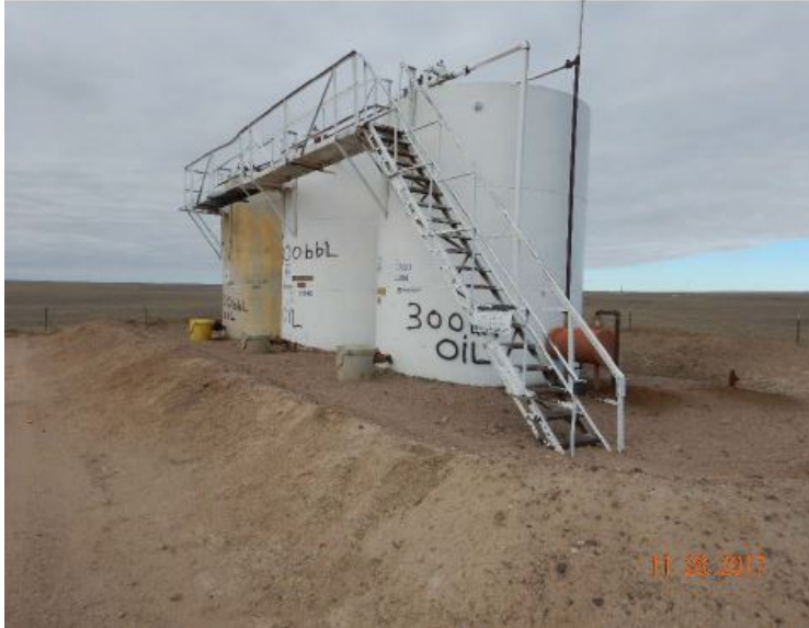
Photo #27 State 36-16 Produced Oil tanks Inadequate berms prior insp.