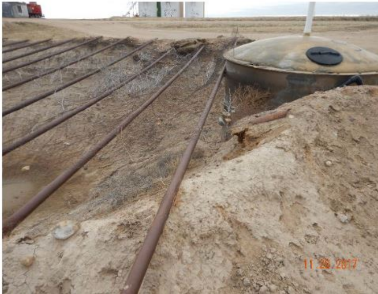
Photo #21 State 36-16 Pit Area Damaged berms, stain soil, netting gaps prior insp.