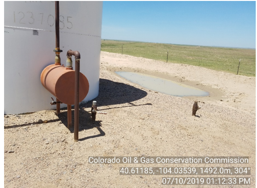
Photo #12 State 36-16 Crude Oil Tanks – East side Stained soil - Appears mitigated