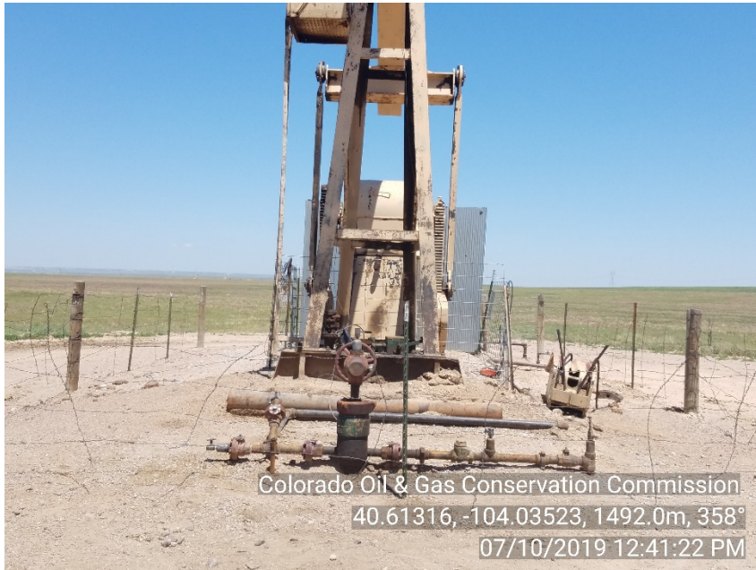
Photo #1 State 36-16 (05-123-20908) Wellsite Shut-In | SI Day tanks, drum removed Stained soil appears mitigated