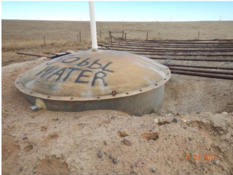
Photo #19 State 36-16 Pit Area – Skim tank No NFPA placard prior insp.