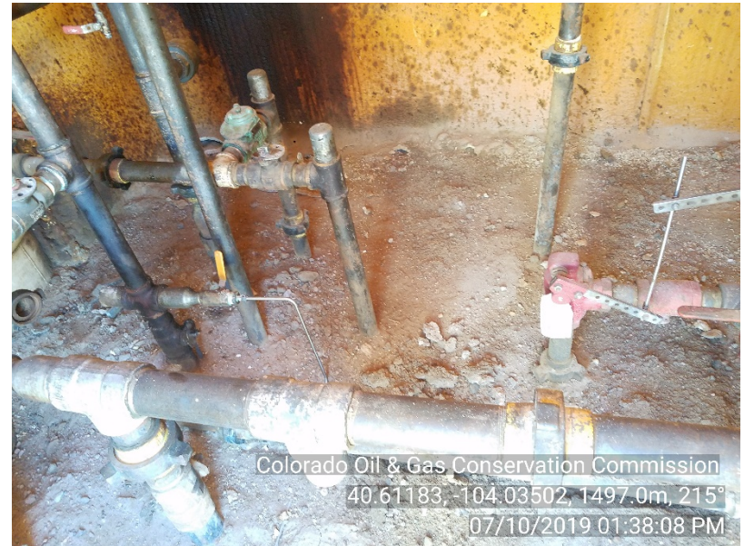
Photo #14 State 36-16 Treater – Separator shed Stained soil - Appears mitigated