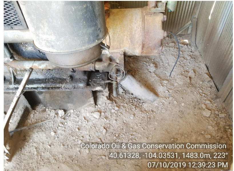
Photo #10 State 36-16 Prime Mover – Gas Engine Stained soil beneath gas engine Appears mitigated