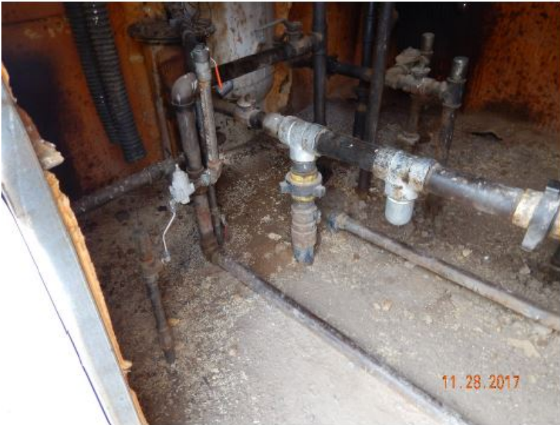
Photo #13 State 36-16 Treater – Separator shed Stained soil prior insp.