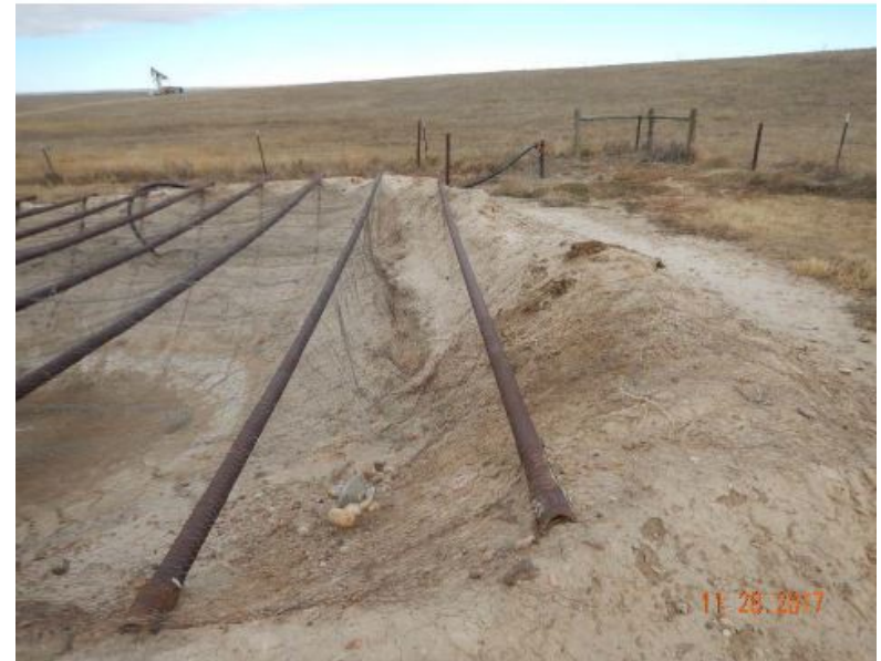
Photo #22 State 36-16 Pit Area Damaged berms, stain soil, netting gaps prior insp.