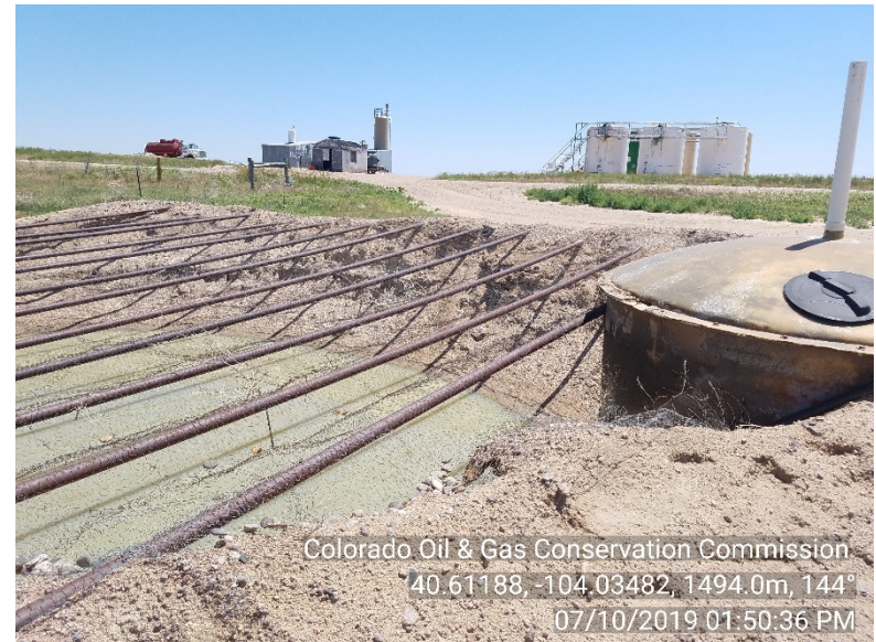
Photo #24 State 36-16 Pit Area Damaged berms, stain soil, netting gaps Appears mitigated