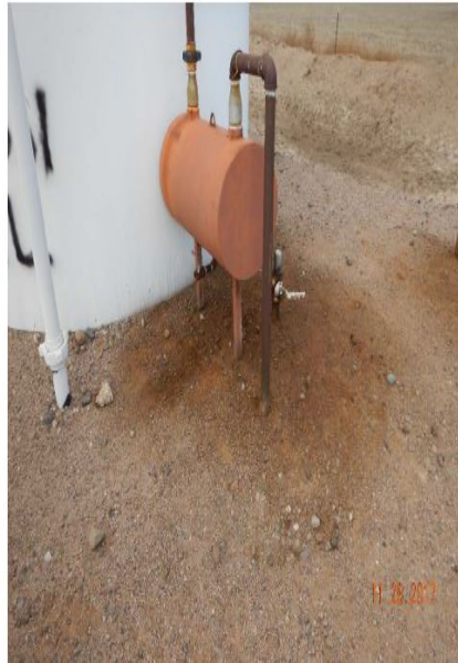
Photo #11 State 36-16 Crude Oil Tanks – East side Stained soil prior insp.