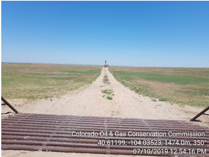
Photo #7 State 36-16 Wellsite Access road ruts - Appears mitigated