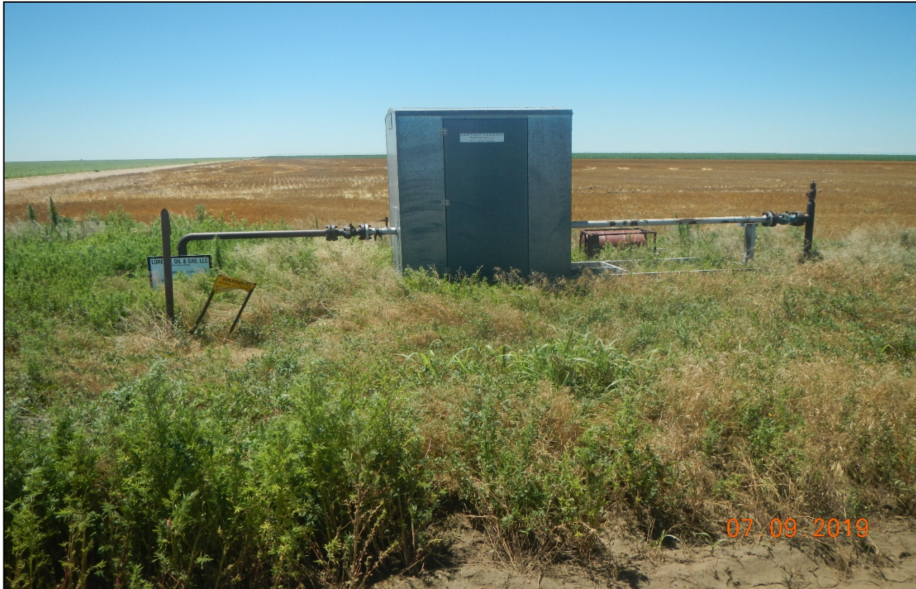
Photo 6. There is a pipe riser and meter shed that remains on the south side of the county road approximately 2700' to the northeast of the well site.