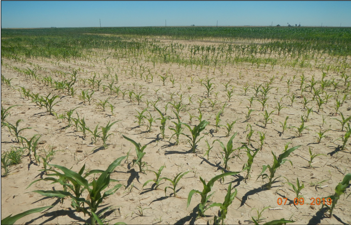
Photo 4. Facing northeast toward the location. Crop is stunted and has not reestablished.