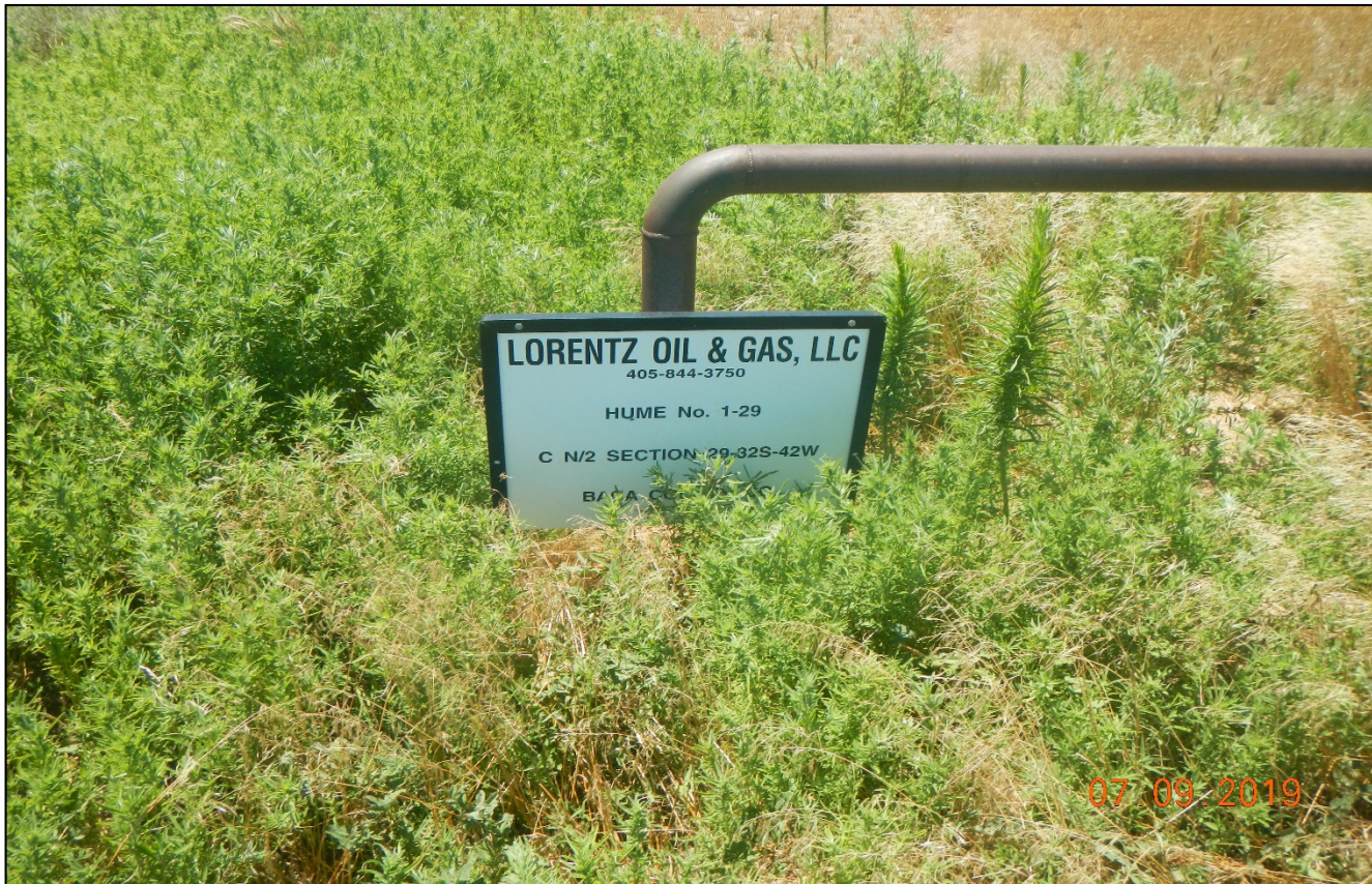
Photo 7. Sign that remains at the meter shed shown in previous picture.