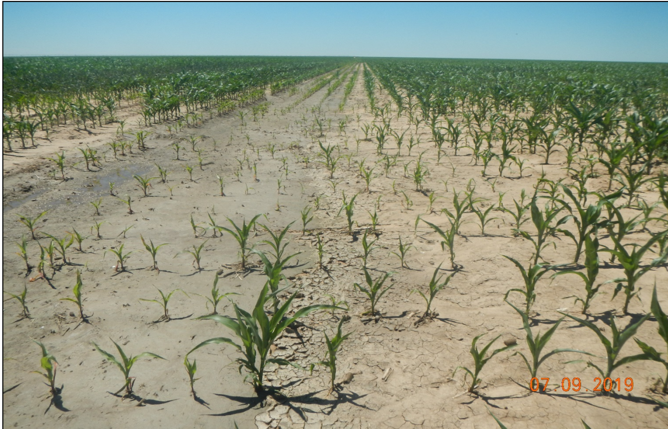
Photo 1. Facing south along the former access road. Crop is stunted and has not reestablished.