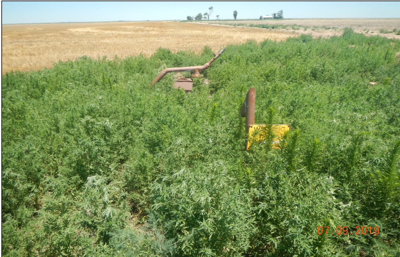
Photo 5. There is a pipe riser that remains on the north side of the county road approximately 2700' to the northeast of the well site.