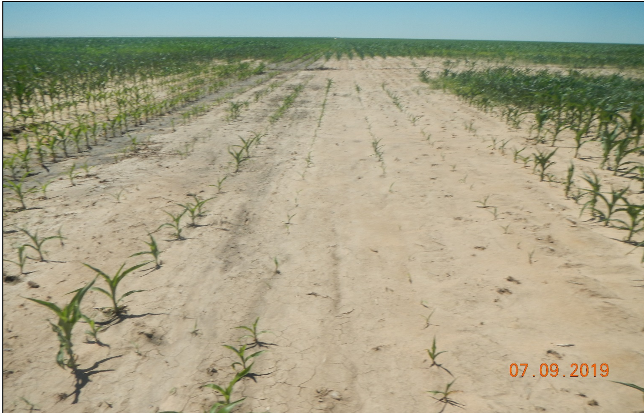
Photo 2. Facing south toward the location. Crop has not reestablished.