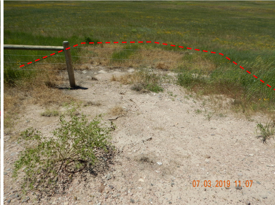
Photo 5. Photo taken along the western Location, facing Northwest. See comments under Photo 1.