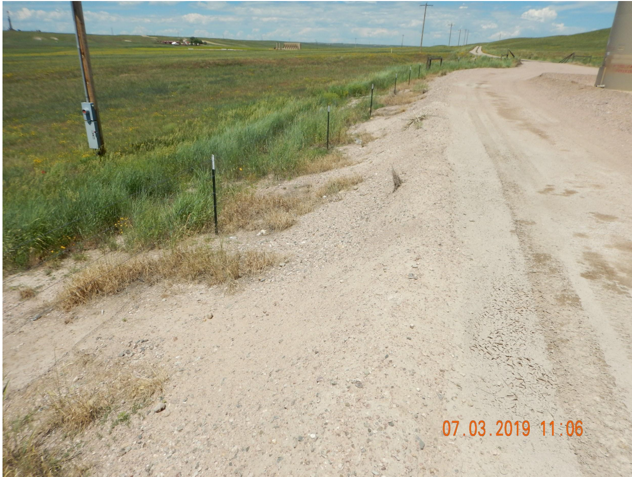
Photo 1. Photo taken from the southern Location, facing North. Photo illustrates sediment discharge off Location along the entire western perimeter. Operator shall take measures to comply with Rule 1004 throughout the impacted areas off Location.