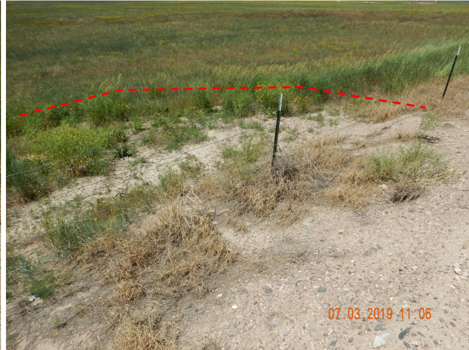
Photo 3. Photo taken along the western Location, facing Northwest. See comments under Photo 1.