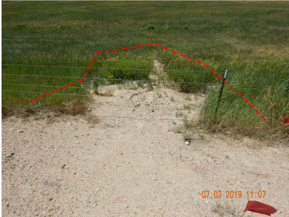
Photo 4. Photo taken along the western Location, facing Northwest. See comments under Photo 1.