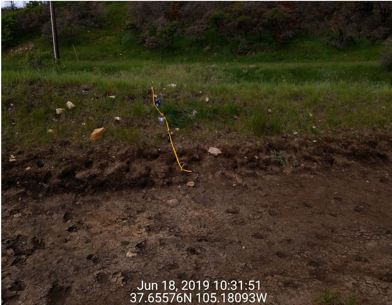
Freeboard marker installed

Location Name: Garcia #1-WD API: 055-06012 Inspection Date: 6/18/2019