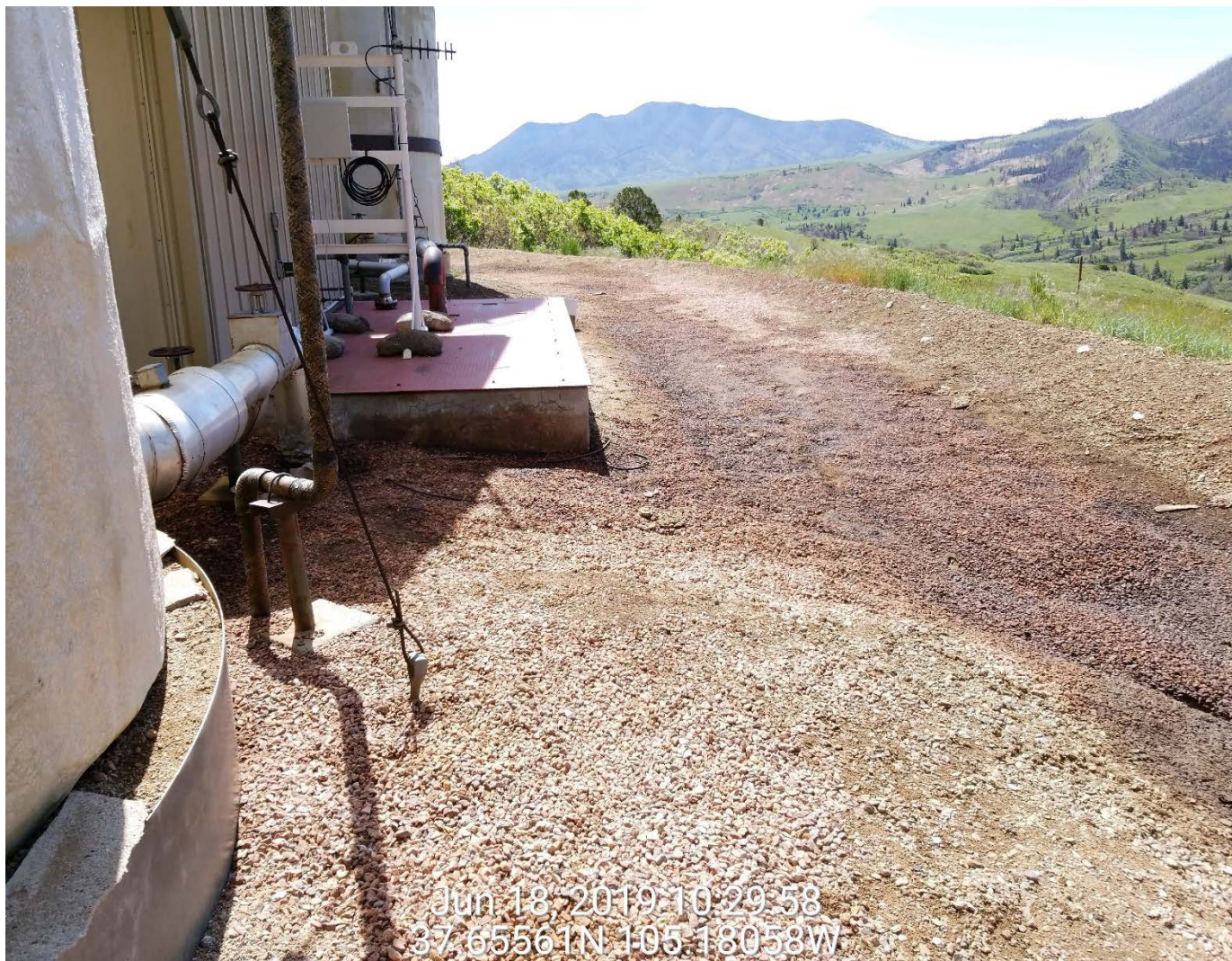
Stained soil inside containment.

Location Name: Garcia #1-WD API: 055-06012 Inspection Date: 6/18/2019