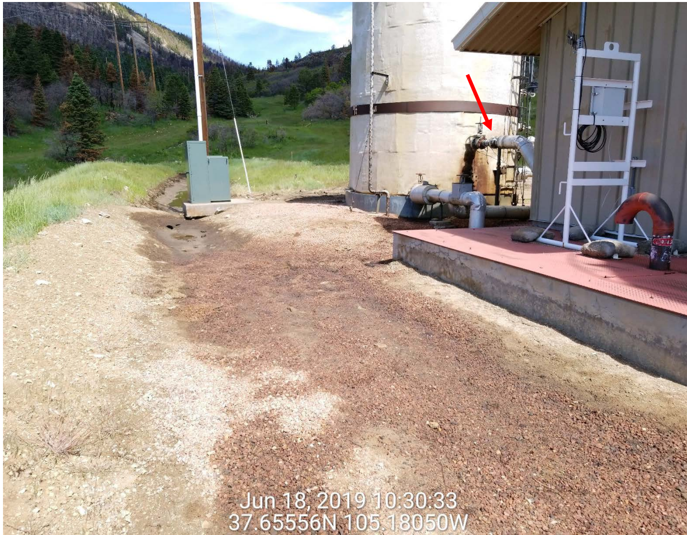
Source of leak and stained soil.

Location Name: Garcia #1-WD API: 055-06012 Inspection Date: 6/18/2019