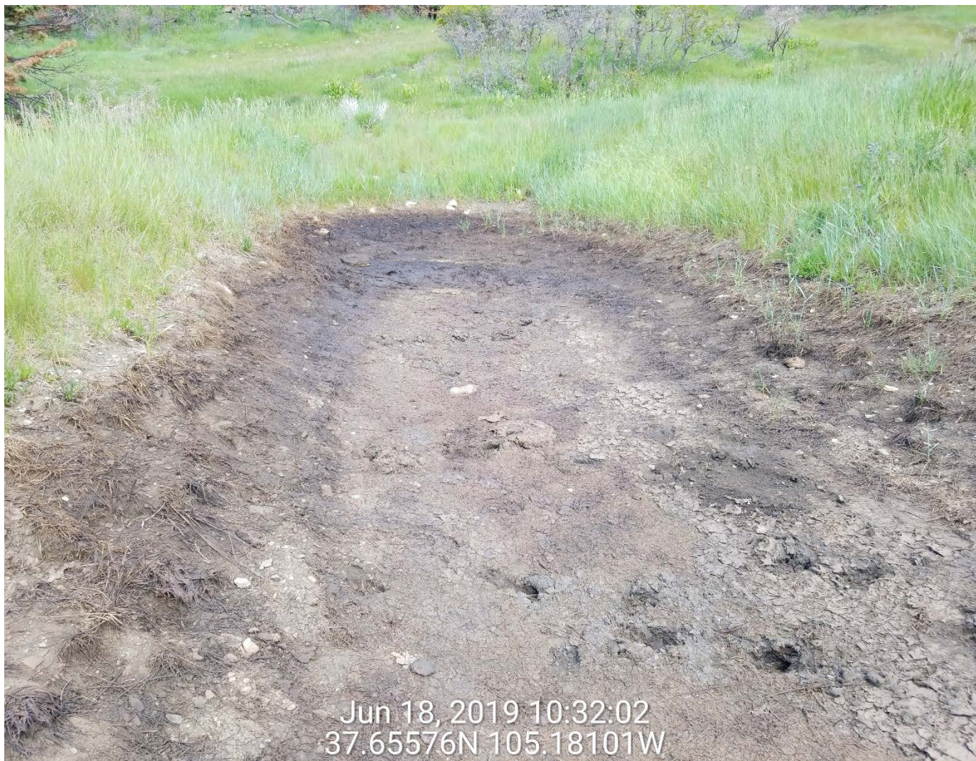
Stained soil in stormwater controls on northwest side of location.

Location Name: Garcia #1-WD API: 055-06012 Inspection Date: 6/18/2019