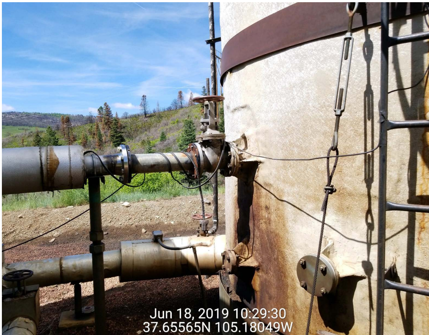
Source of leak

Location Name: Garcia #1-WD API: 055-06012 Inspection Date: 6/18/2019