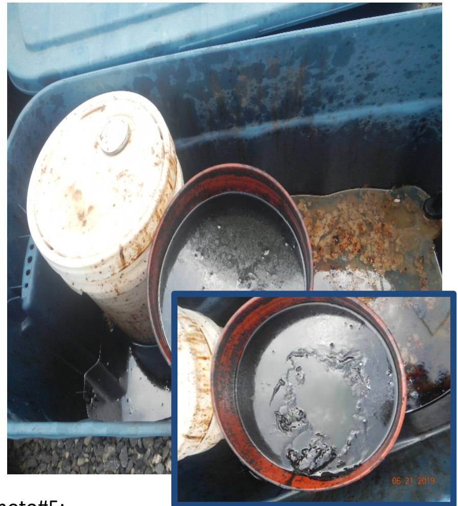
Photo#5: Close up of Bucket not in secure containment (contents of which should be disposed of in accordance with 907.e.