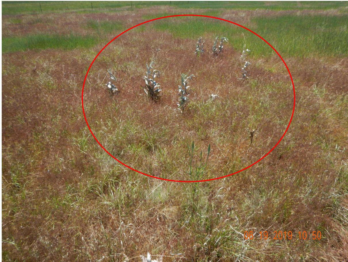
Photo 3. Photo taken from the 6/19/19 Point #2 location. Photo illustrates a group of Scotch thistle plants that appear to have been recently sprayed as they appear to be wilting.

Inspection Photos Location Name: FIELDS #X8-11 API: 05-123-14957