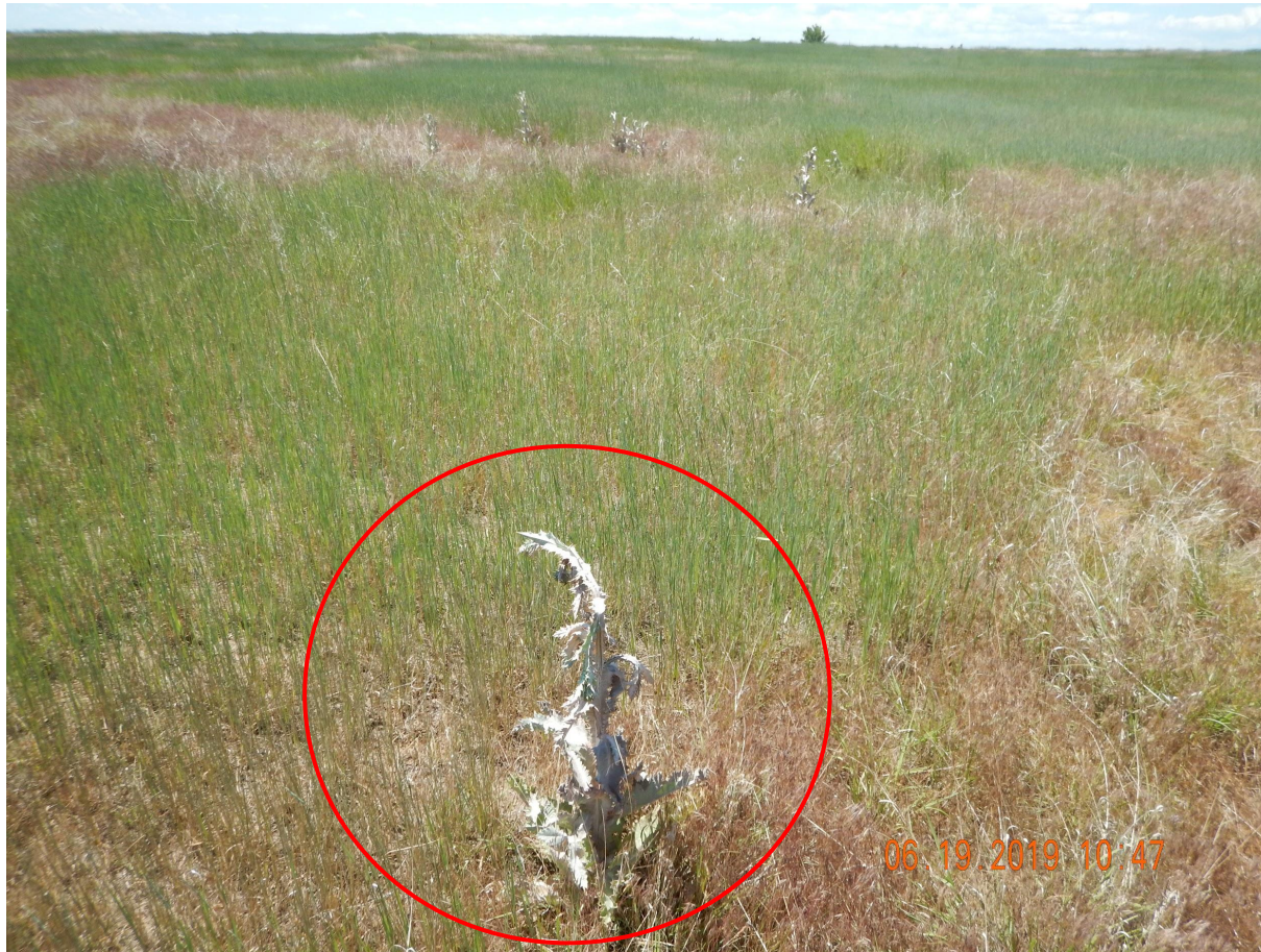
Photo 2. Photo taken from the 6/19/19 Point #1 location. Photo illustrates an individual Scotch thistle plant that appears to have been recently sprayed as it appears to be wilting.

Inspection Photos Location Name: FIELDS #X8-11 API: 05-123-14957