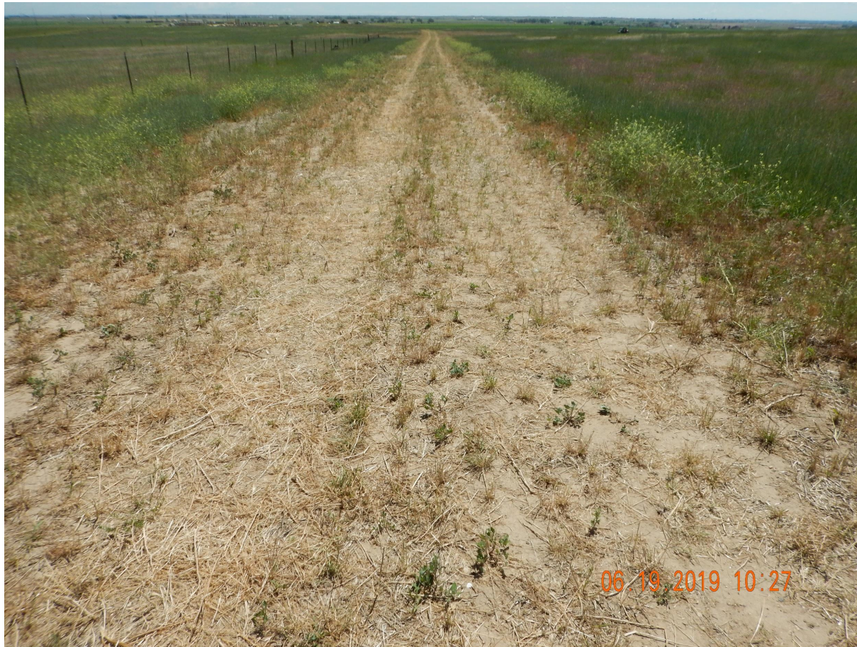
Photo 1. Photo taken from the western access road, facing East. Photo illustrates the establishment of Hordeum jubatum throughout most of the access road. Surface owner thought this was a listed weed species; however, it is a native cool season grass. Therefore, there is no violation with the presence of this grass species.

Operator plans to perform compaction alleviation and reseed the access road as soon as possible in response to the lack of establishment of desirable species.