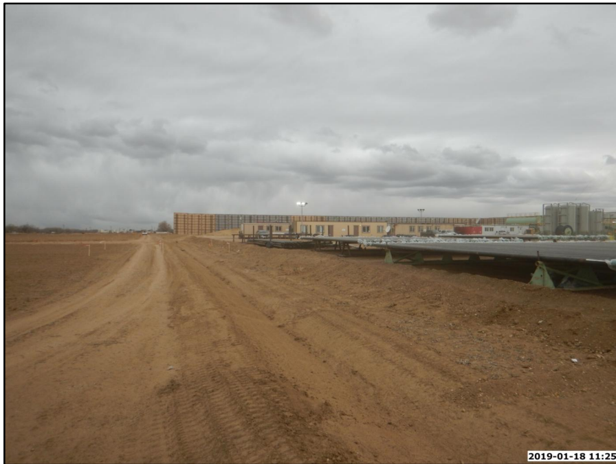
PICTURE OF BEEBE-SPUR 3-34 PAD EAST WELL PAD LOCATION - CAMERA ANGLE WEST