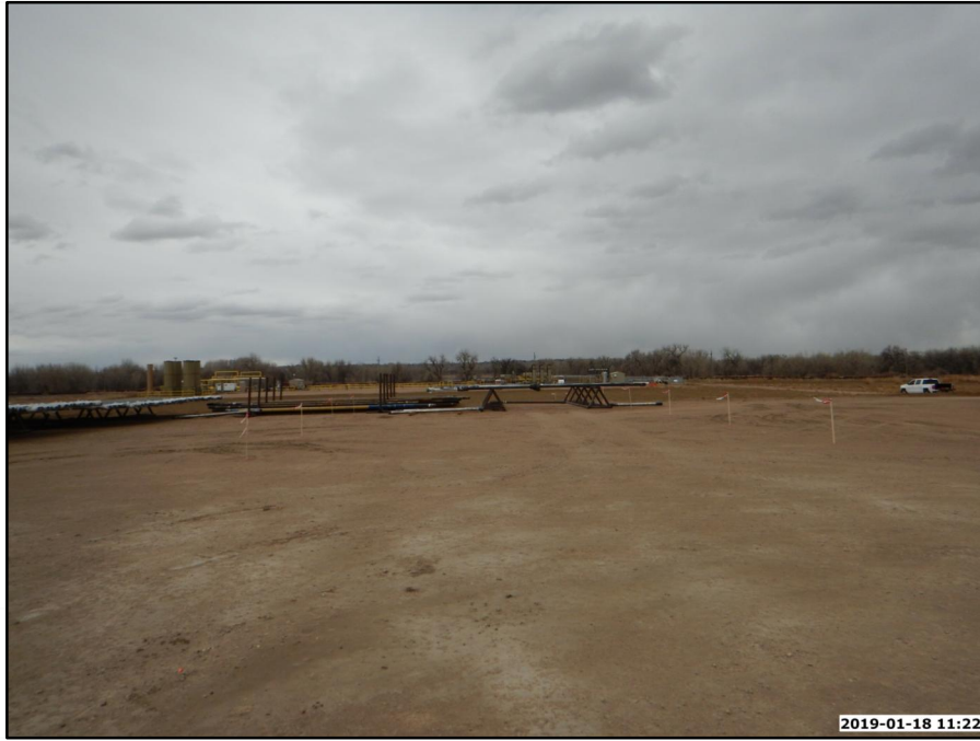
PICTURE OF BEEBE-SPUR 3-34 PAD EAST WELL PAD LOCATION - CAMERA ANGLE SOUTH