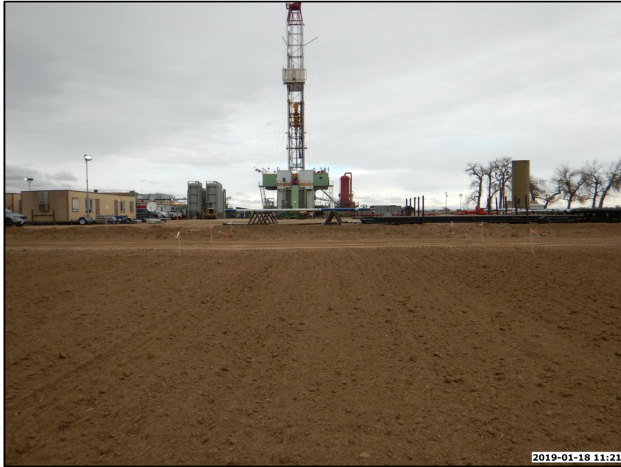
PICTURE OF BEEBE-SPUR 3-34 PAD EAST WELL PAD LOCATION - CAMERA ANGLE NORTH