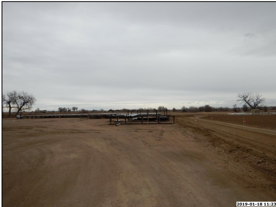
PICTURE OF BEEBE-SPUR 3-34 PAD EAST WELL PAD LOCATION - CAMERA ANGLE EAST

K:\SYNERGY RESOURCES\2016\2016_108_BEEBE_76N_R66W_SEC_34\PHOTOS\BEEBE_3-34\img_411\2019 10:07:10 AM.jpg