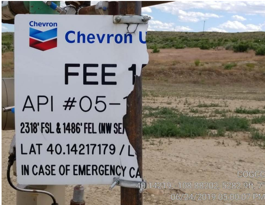
Photo 2. Well head sign.

Fee 154X API: 05-103-10365 Inspection: 679704602