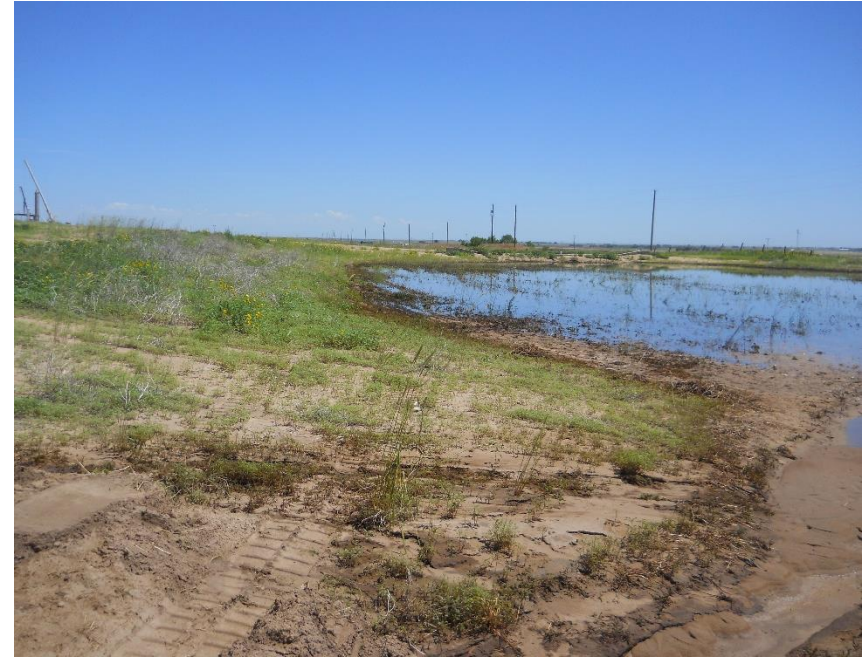
Storm water retention pond on southeast side of facility. Photo looking south east.