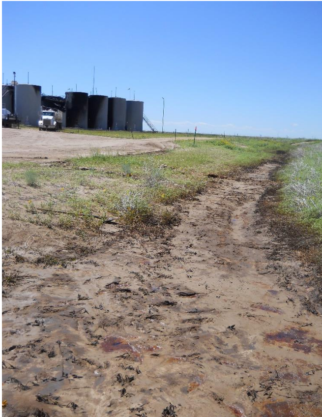
Storm water ditch looking to south from location in previous photo. Note staining.