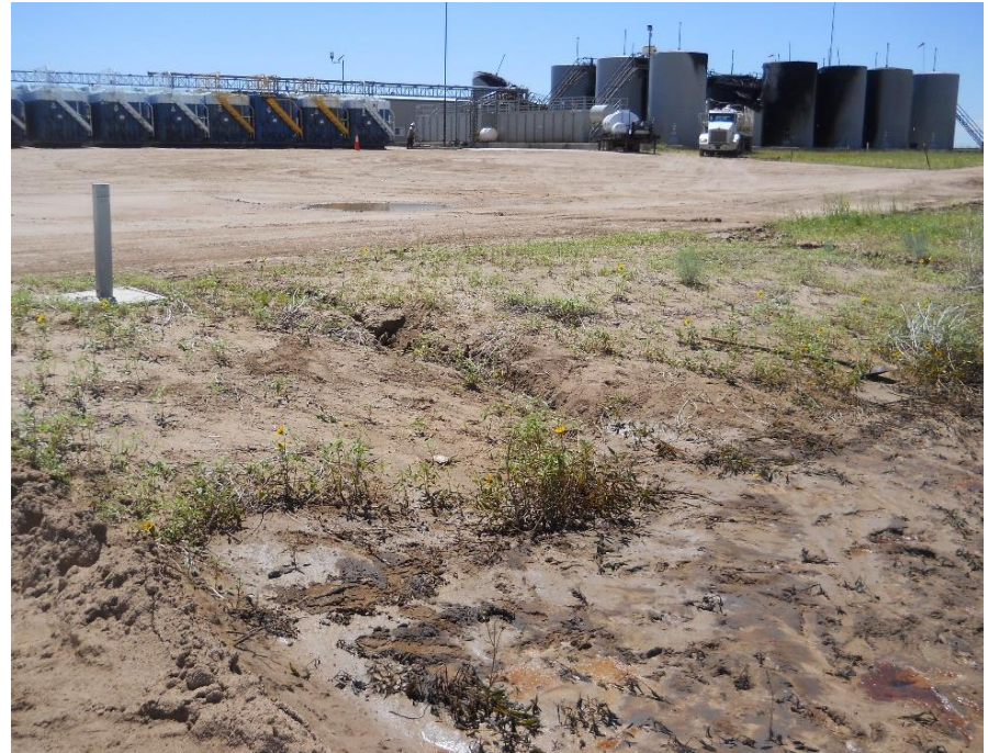
Storm water ditch northeast side of facility. GW monitoring location. Ditch passes under road through culvert to east side. Note staining. Photo looking south west.