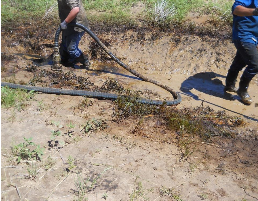
Fluid removal from storm water ditch.