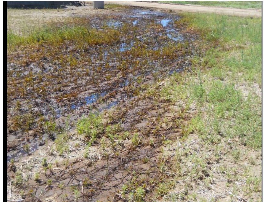
Oil stained area north of TB.