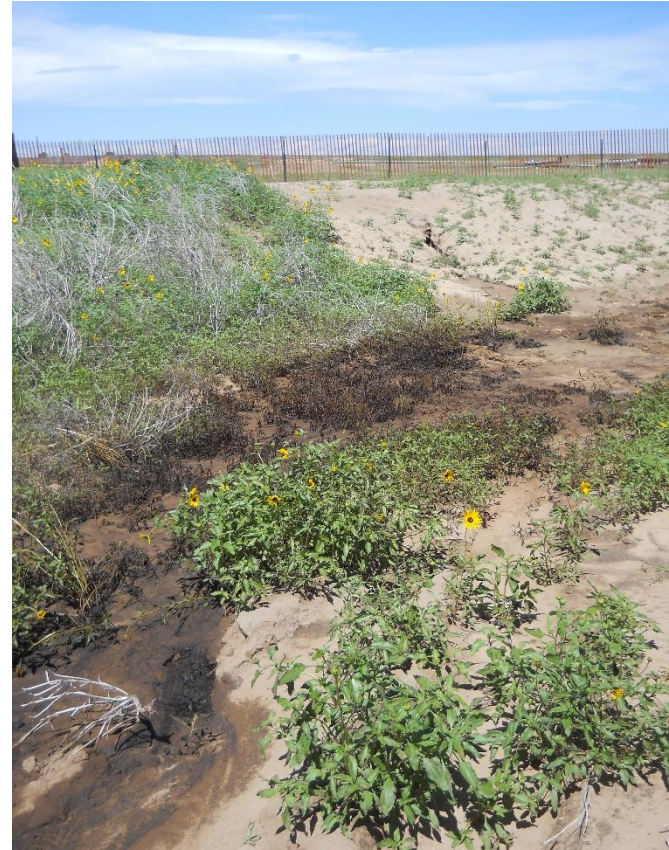
Storm water control ditch. Note staining. Photo looking north.