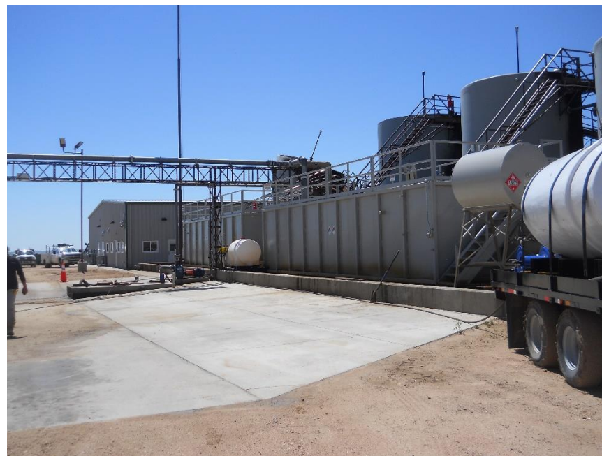
Looking south from north side of TB.