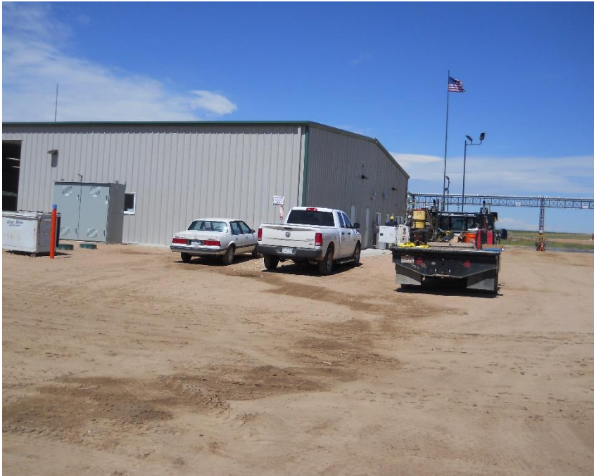
EWS #4 TB Facility. Looking north.