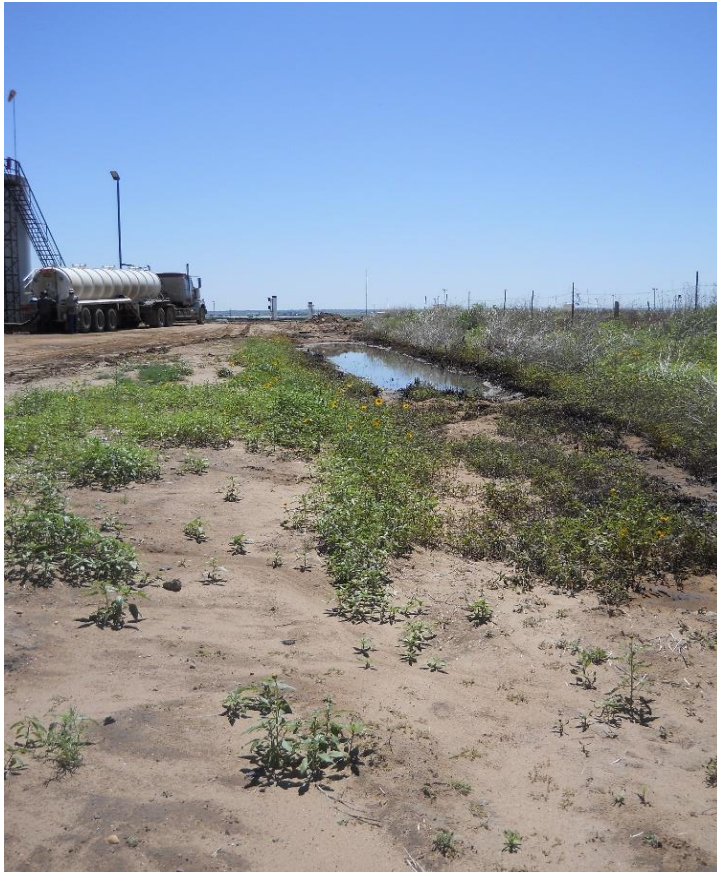
Fluid collection area west of TB (storm water control ditch). Note staining. Photo looking south