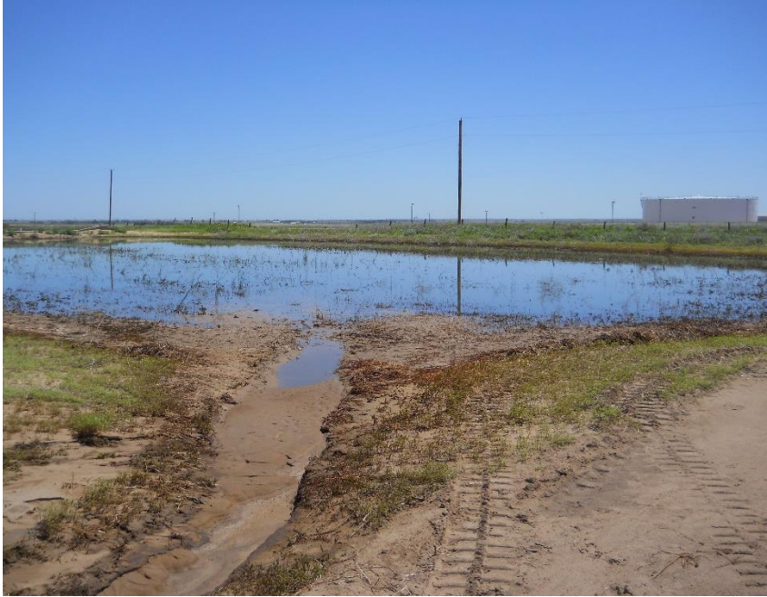
Storm water retention pond. Photo looking south.