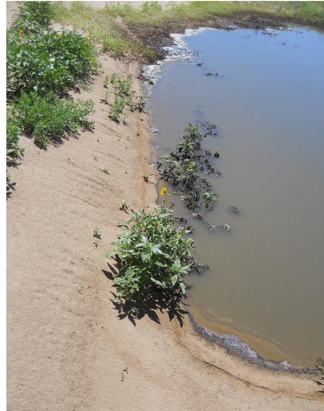
East side of storm water retention pond. Note stained vegetation. Photo looking south.