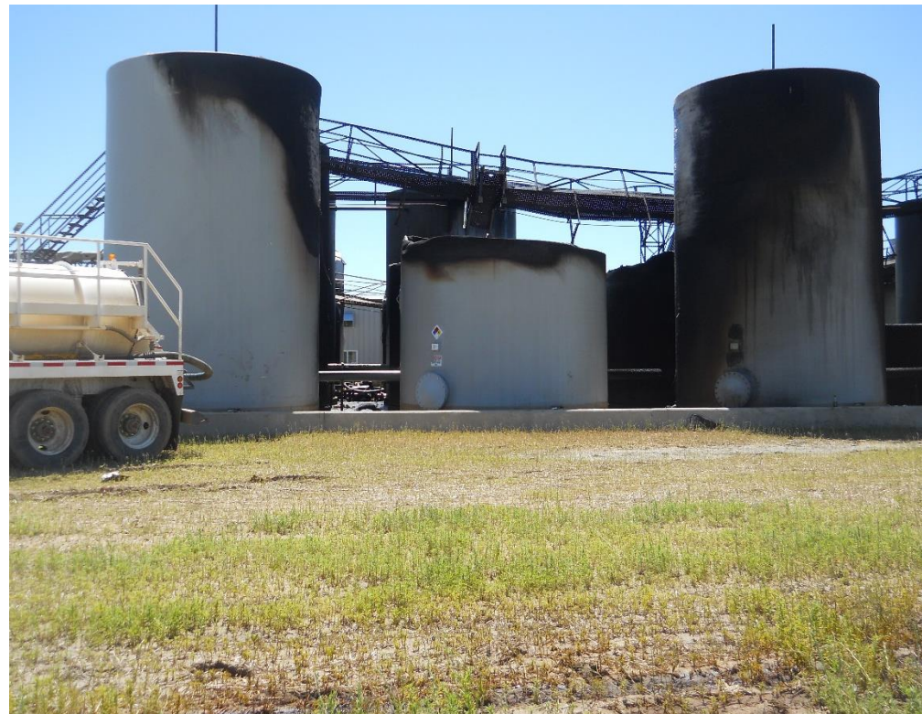
Damaged tanks. North end of TB. Photo looking south.