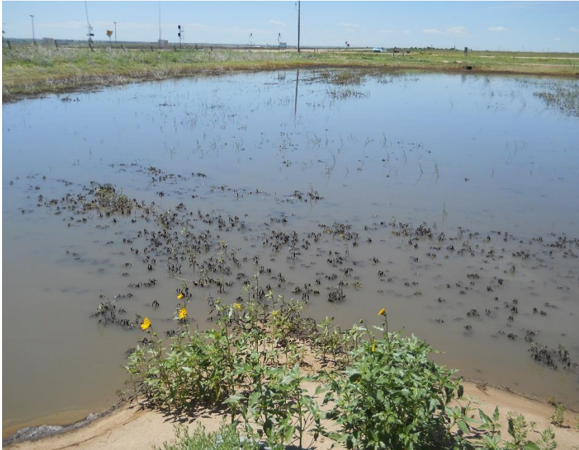
Storm water retention pond from east side looking to west. No sheen or floating oil observed. Photo looking west.