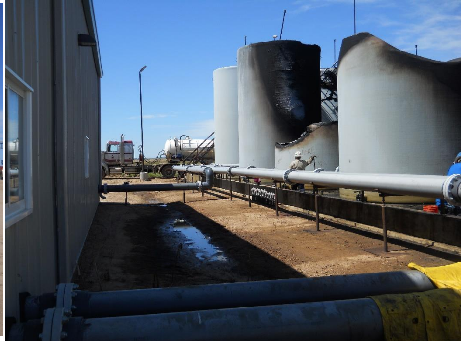
North side building showing tank damage. All 28 FG tanks damaged/destroyed. 5 steel tanks (oil) undamaged. Photo looking east.