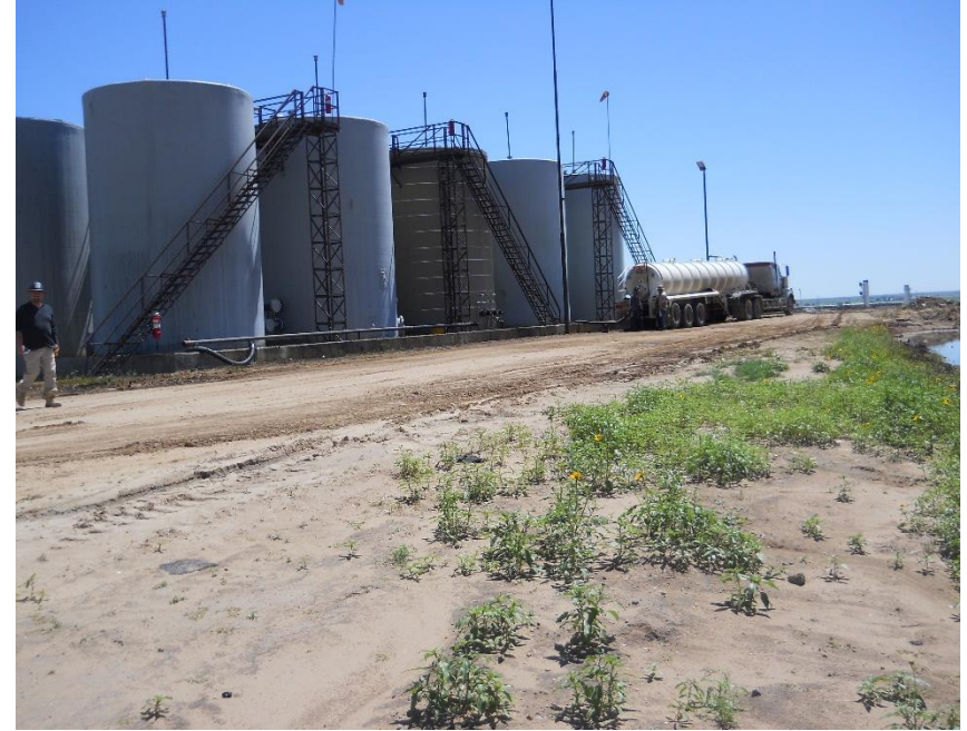
West side of TB showing undamaged tanks. Photo looking southeast.