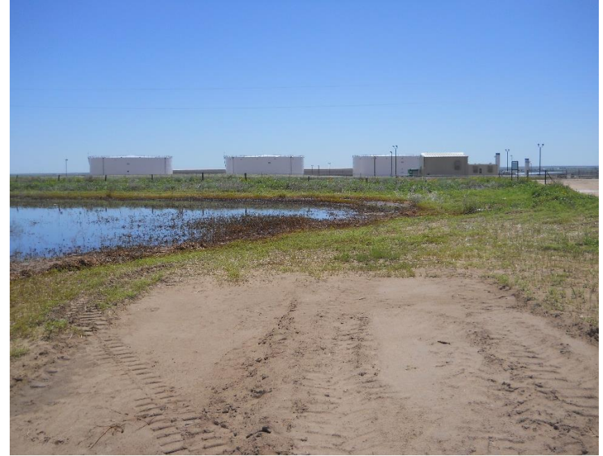
Western end of retention pond. Photo looking southwest.