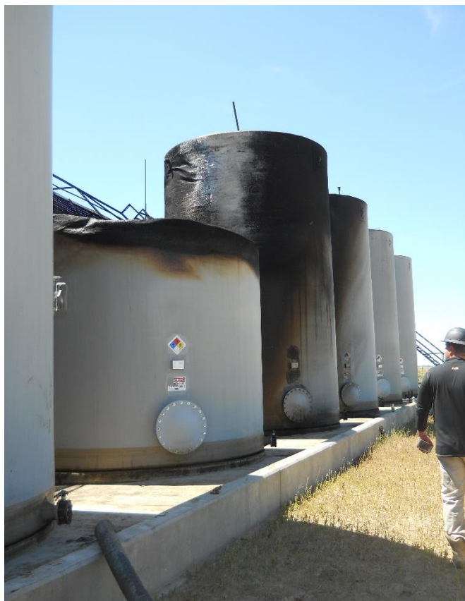
Damaged tanks. North end of TB. Photo looking west.