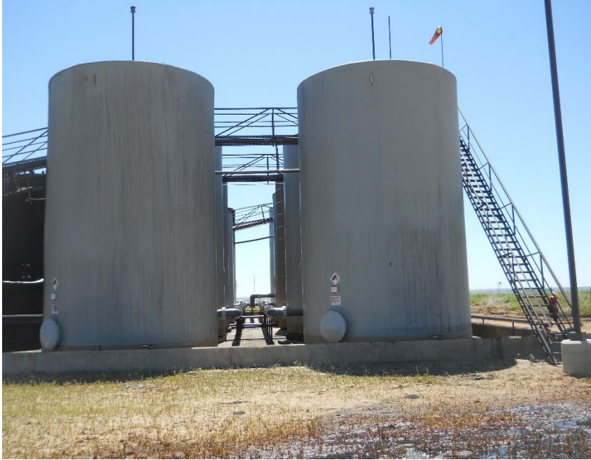
Northwest end of TB showing undamaged tanks. Photo looking south.