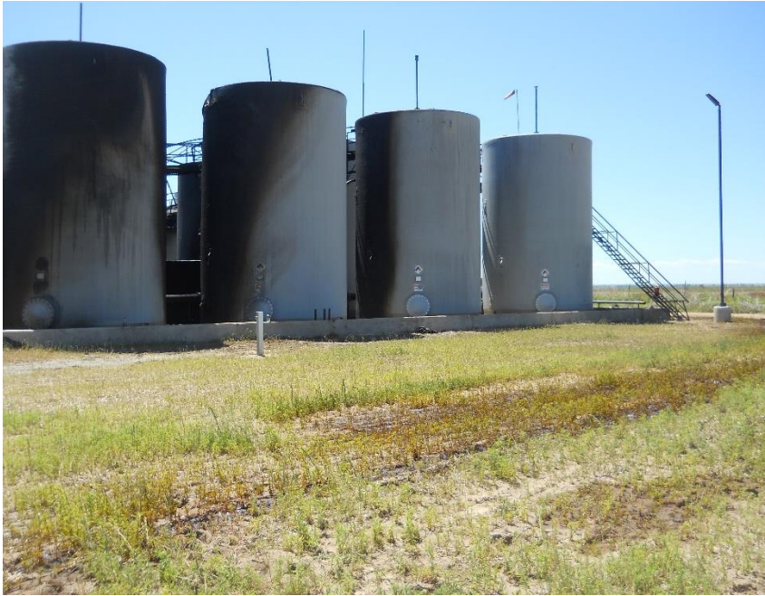
Northwest end of TB showing little or no tank damage. Note stained area north of TB. Photo looking southwest