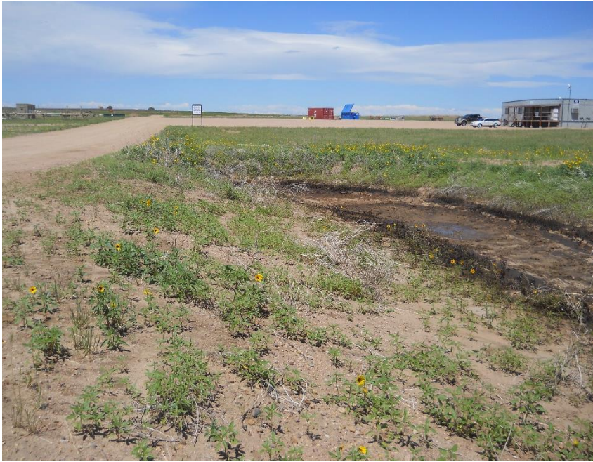
Storm water ditch passes under road through culvert to east side. Note staining. Photo looking north.