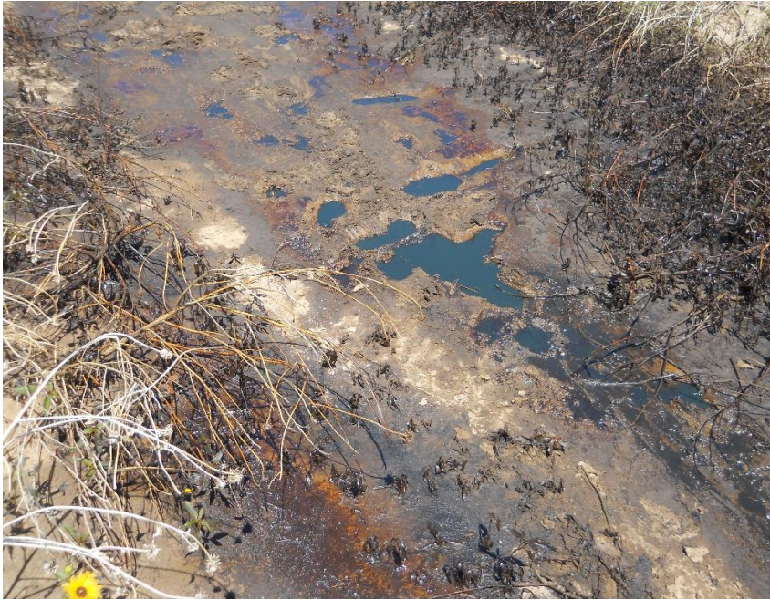
Detail showing oily fluid in storm water ditch eastern side of facility.