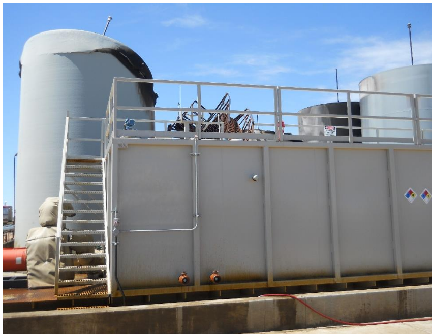
Damaged tanks. Tank on left same tank as in previous photograph. Photo looking east from off-loading area.