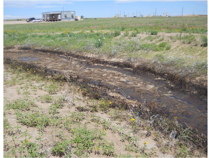
Storm water ditch east side. Note staining. Photo looking north.