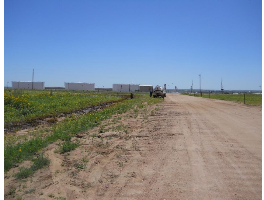
Storm water ditch on east side of facility. Crew removing fluids from ditch. Photo looking south.