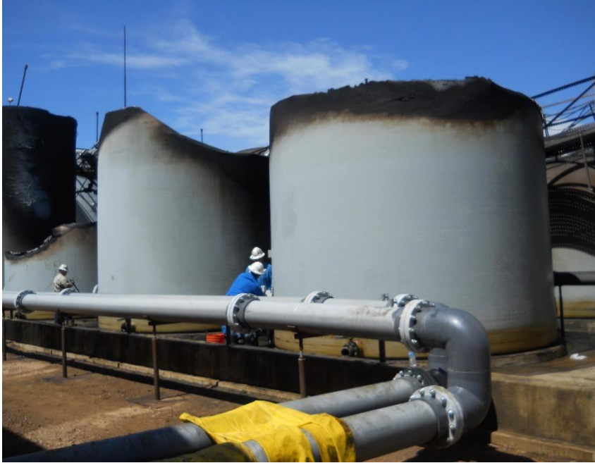
North side building showing tank damage. All 28 FG tanks damaged/destroyed. Crews cleaning out tanks in preparation for removal. Photo looking north.