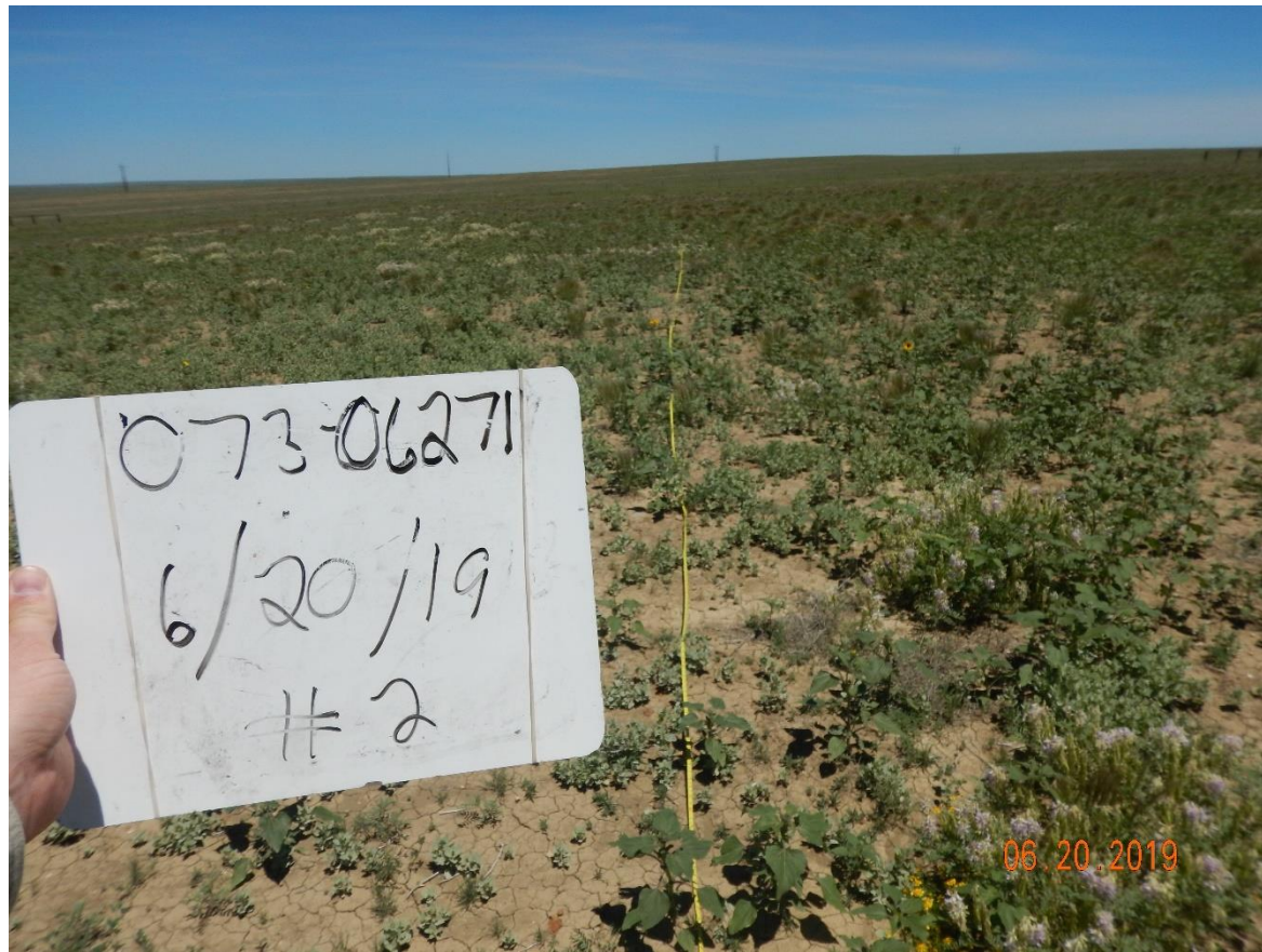
Photo 7: Photo taken from the south-central area of the location, facing north. Photo shows germination survey transect #2 conducted on the location.