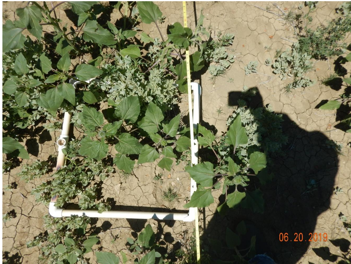
Photo 6: Photo taken from the 50 th point of germination survey transect #1. Vegetation seen in photo include Helianthus annuus , Chenopodium sp., and Kochia . Very little desirable perennial vegetative germination and establishment observed.