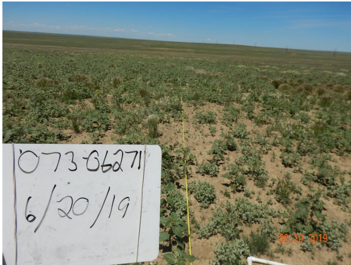
Photo 5: Photo taken from the east-central area of the location, facing west. Photo shows germination survey transect #1 conducted on the location.