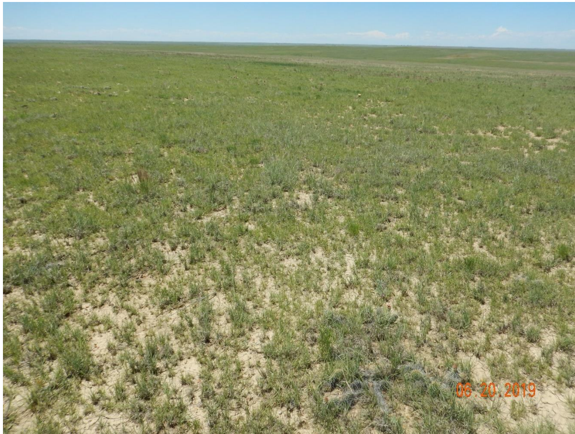
Photo 9: Photo taken from the adjacent reference area. Photo shows reference vegetation to compare to vegetation on the location.