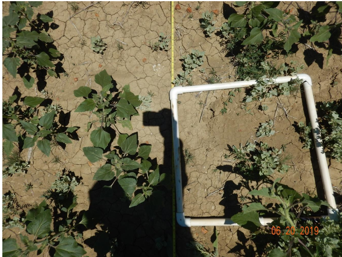
Photo 8: Photo taken from the 50 th point of germination survey transect #2. Vegetation seen in photo include Helianthus annuus , Chenopodium sp., and Kochia . Very little desirable perennial vegetative germination and establishment observed.