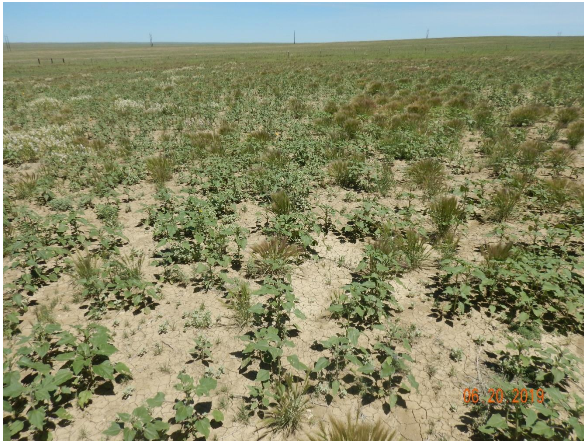
Photo 1: Photo taken from the central area of the location, facing north. Photos 1-4 provide an overview of the location from north, to south, to east, to west. Photos show vegetation over the reclamation area. Vegetation observed is predominantly undesirable weedy plant species (such as Kochia, Amaranth, Chenopodium and Salsola sp), and annual forbs. Unable to find evidence that additional reclamation/seeding activities have been conducted, or stabilization controls installed per corrective actions.