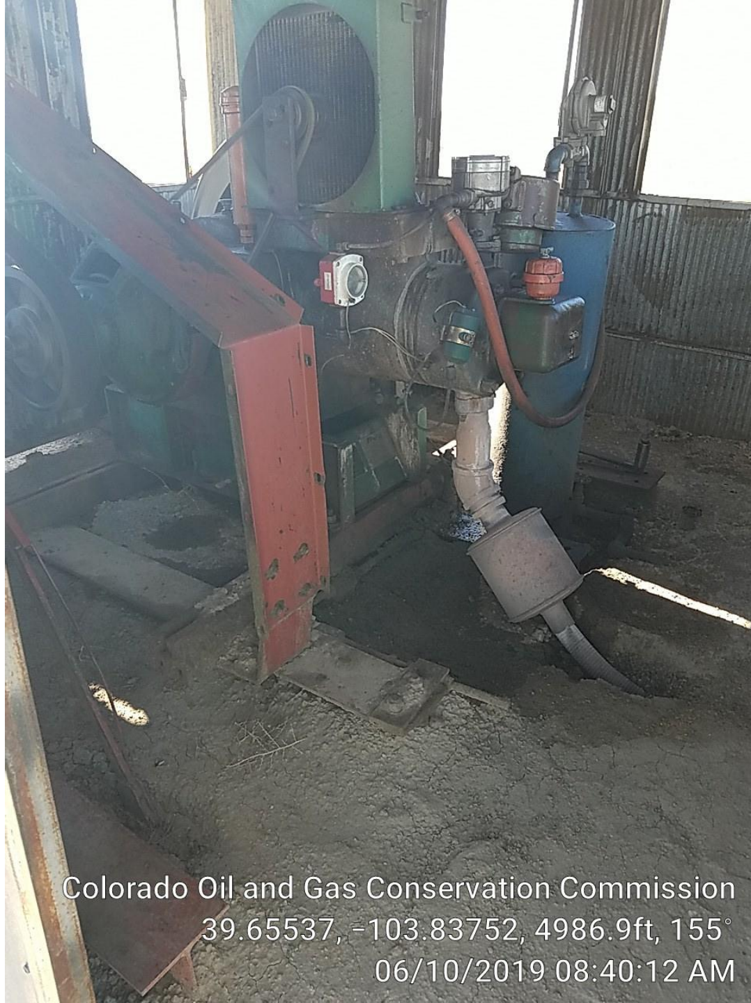
Engine oil leak.

Colorado Oil and Gas Conservation Commission 39.65537, -103.83752, 4986.9ft, 155° 06/10/2019 08:40:12 AM