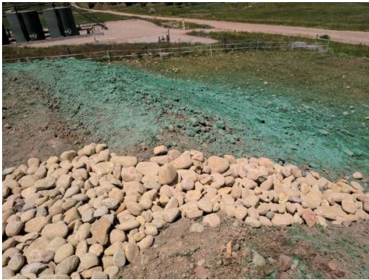
Completed work description

created diversion ditch and installed rock rundown, seeded and hydromulched