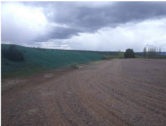
Completed work description