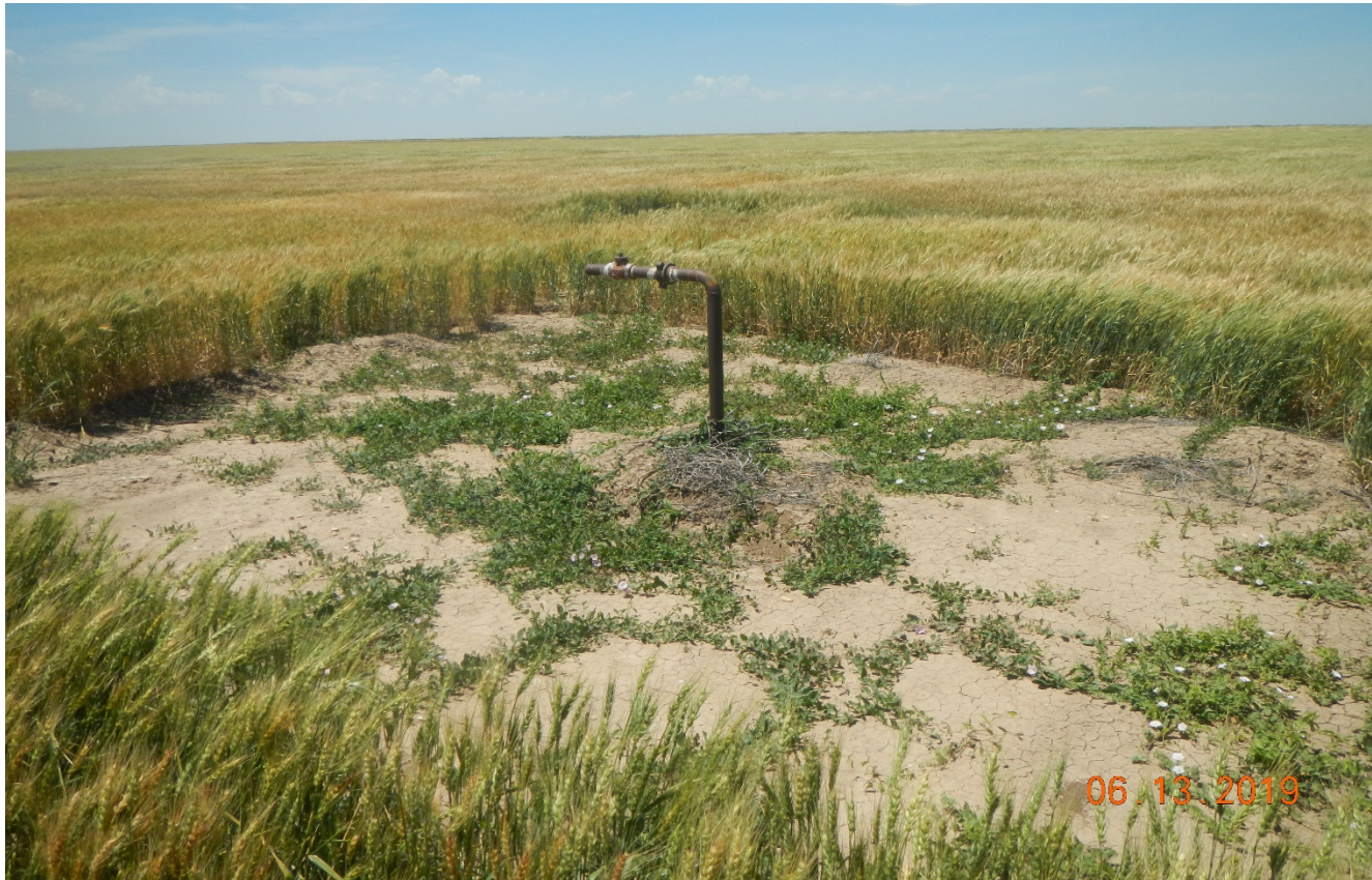
Photo 1. An abandoned pipe riser remains at the location.