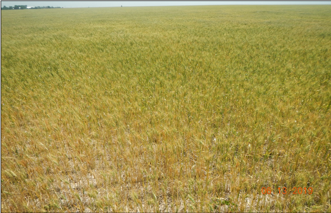
Photo 3. Facing south at the surrounding crop.