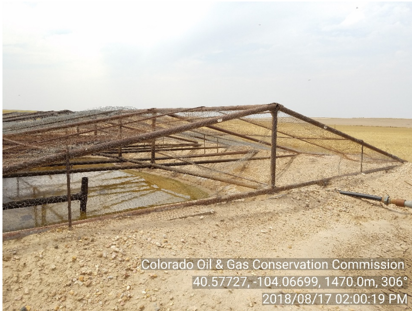
Photo #11 April 12-14, Dryer #1 Pit Area Gaps appear on / beneath pit netting from prior insp.