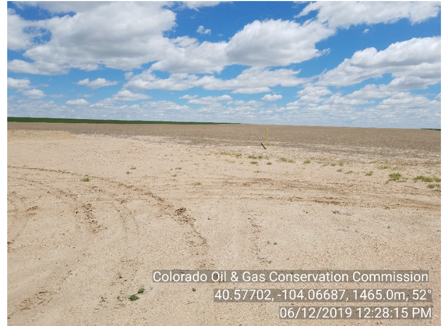
Photo #4 April 12-14, Dryer #1 Battery Unused Equip (Steps / Walkways) from removed oil tanks – NOW removed