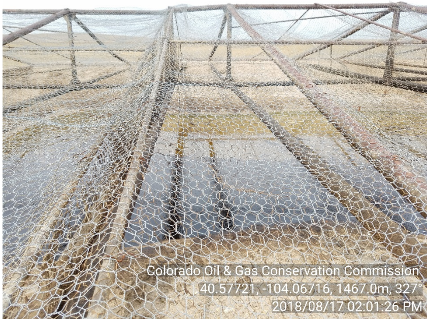
Photo #13 April 12-14, Dryer #1 Pit Area Oil skim appears on pit water surface from prior insp.