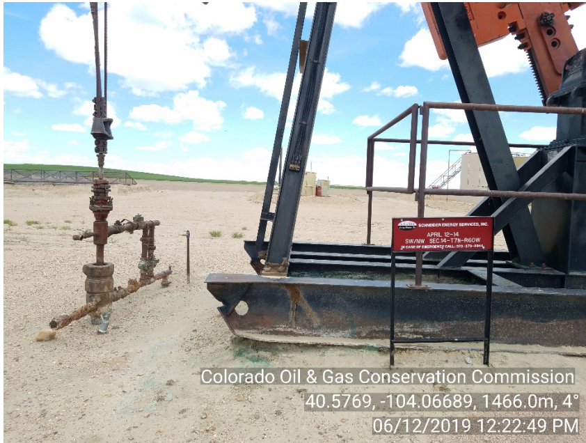
Photo #1 April 12-14 (05-123-05372) Wellsite Shut-In | SI