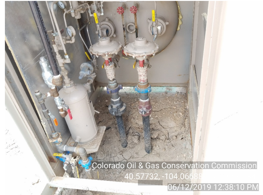
Photo #10 April 12-14, Dryer #1 Battery - Separator Stained soil appears beneath separator NOW appears mitigated