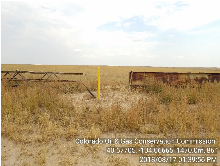
Photo #3 April 12-14, Dryer #1 Battery Unused Equip (Steps / Walkways) from removed oil tanks from prior insp.