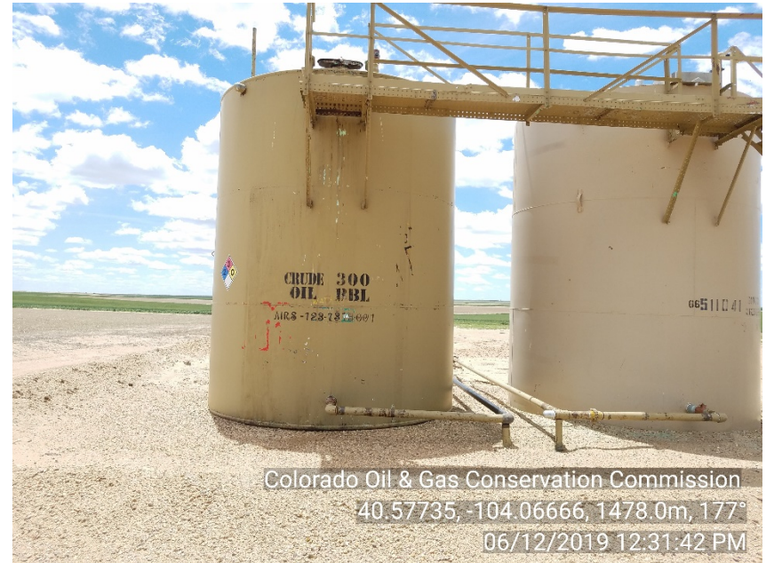
Photo #6 April 12-14, Dryer #1 Battery Stain appears on oil tank NOW appears mitigated