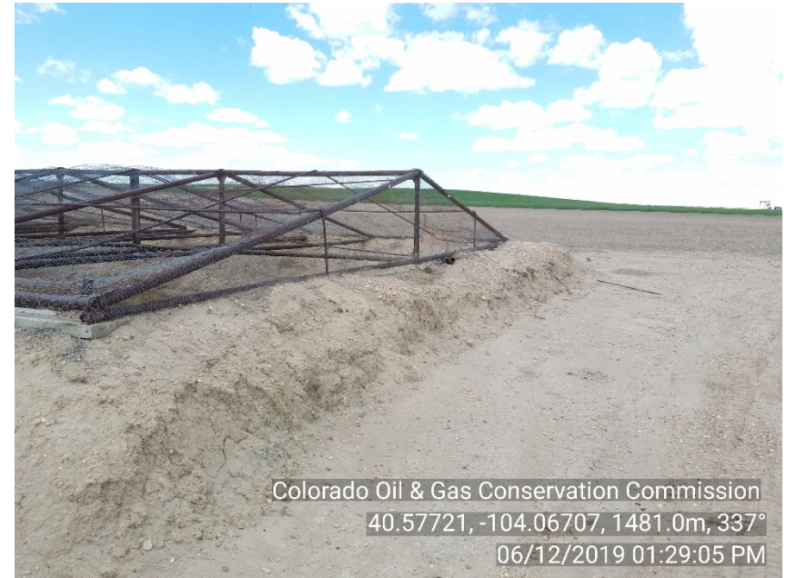
Photo #12 April 12-14, Dryer #1 Pit Area Gaps appear on / beneath pit netting NOW appears mitigated