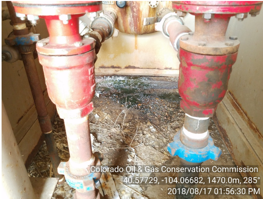
Photo #9 April 12-14, Dryer #1 Battery - Separator Stained soil appears beneath separator from prior insp.