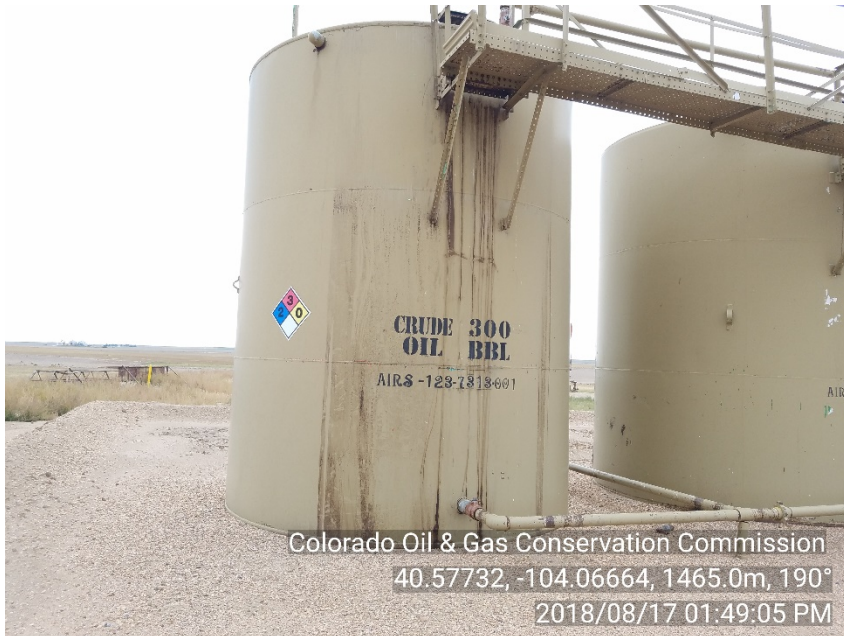
Photo #5 April 12-14, Dryer #1 Battery Stain appears on oil tank from prior insp.