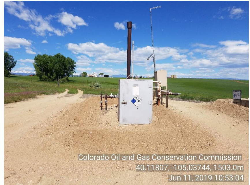
Photo 4 Sepco Meter house Berms repaired