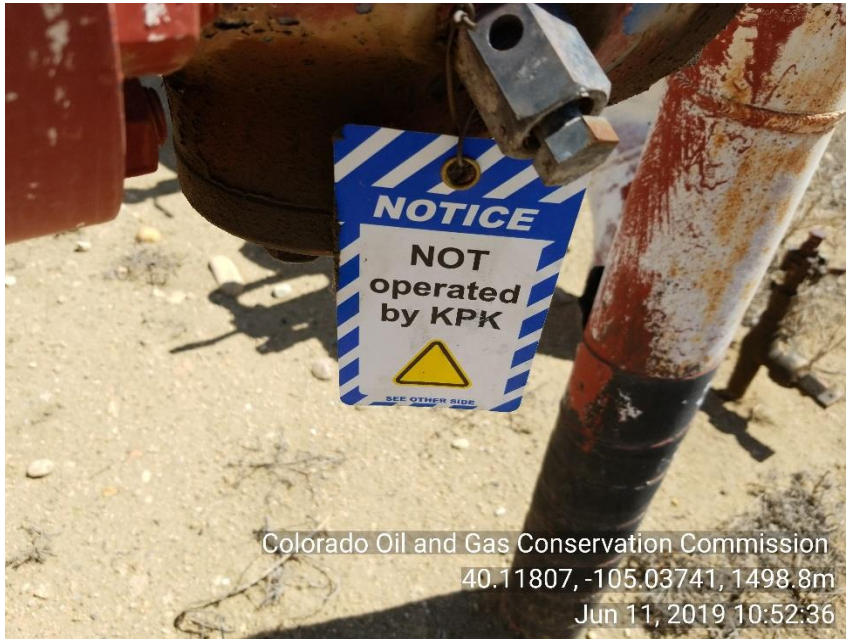
Photo 3 Unused flow lines have been marked