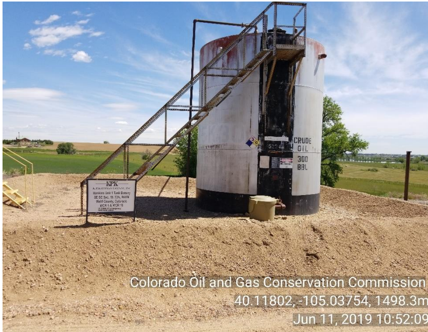
Photo 1 TNK BTRY