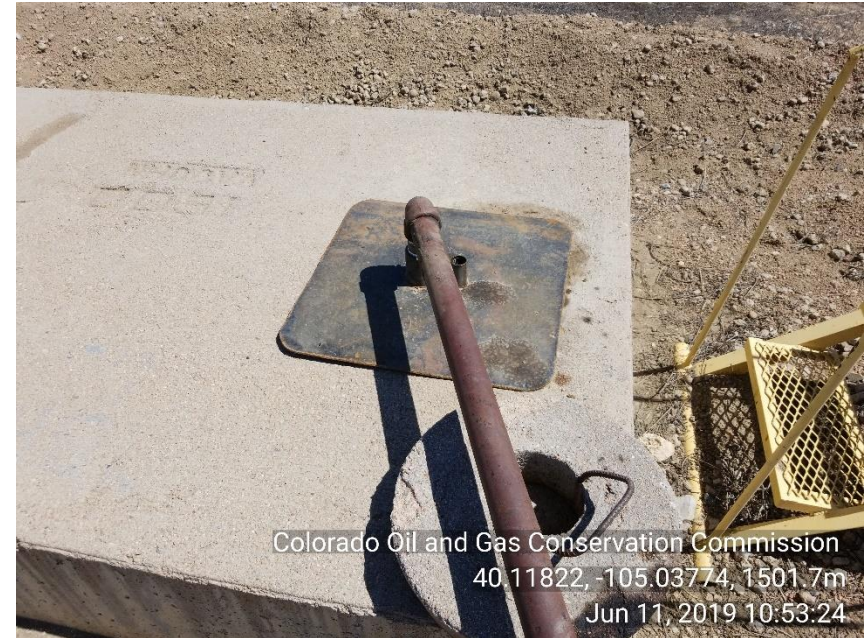
Photo 6 Produced water tank plate installed of opening