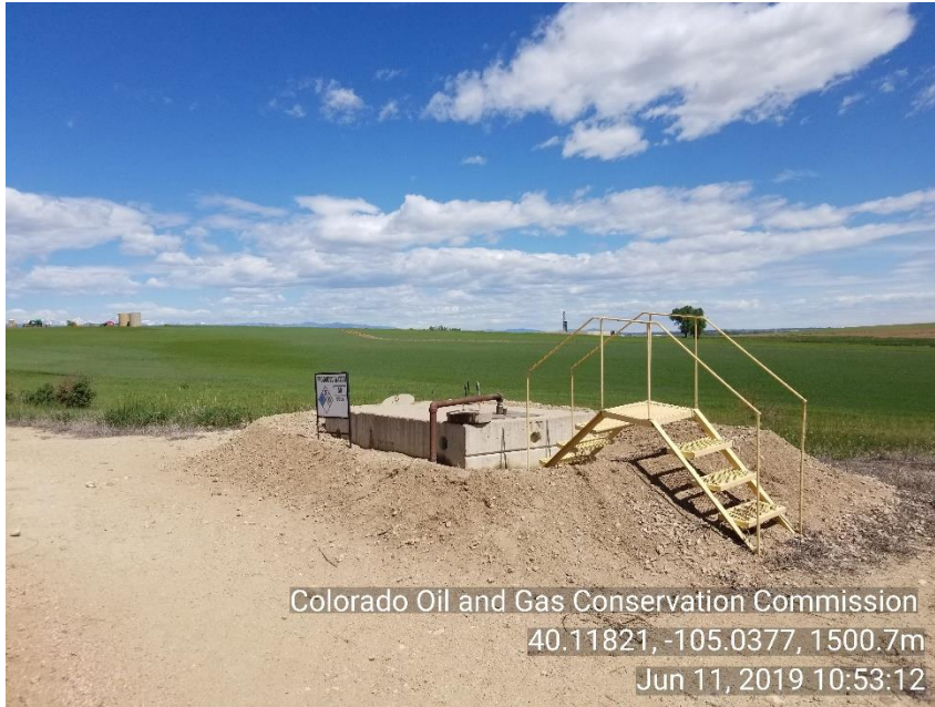
Photo 5 produced water tank berms have been repaired