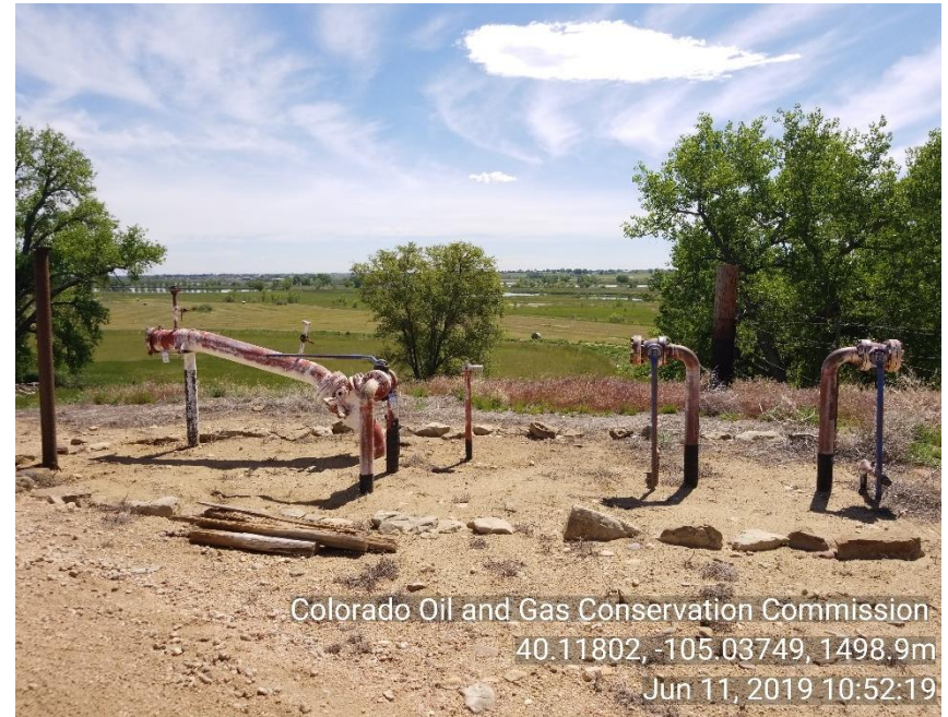
Photo 2 Pig launcher.