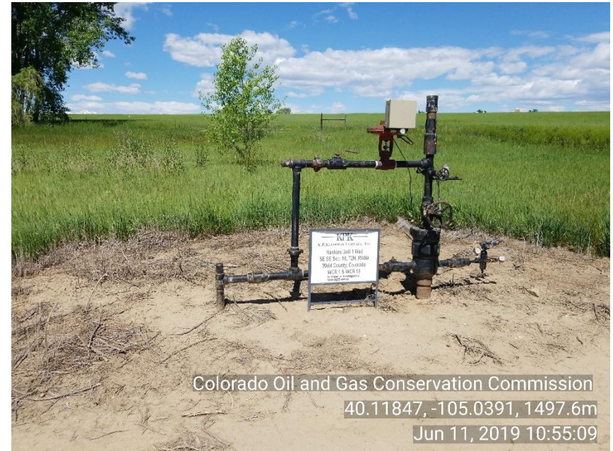
Photo 8 WH