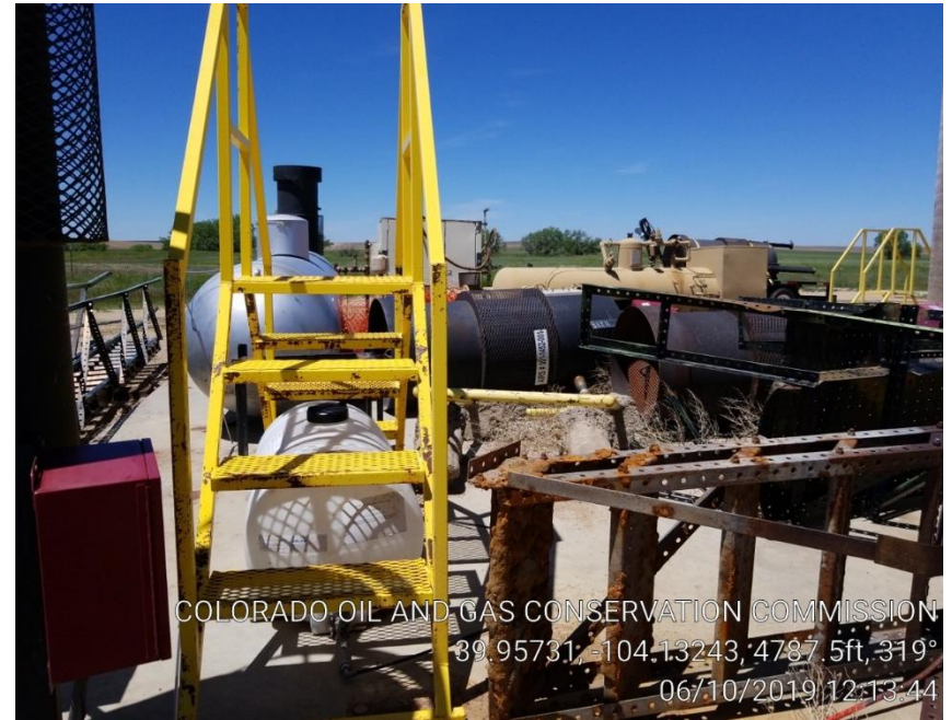
Pic 2 unused equipment