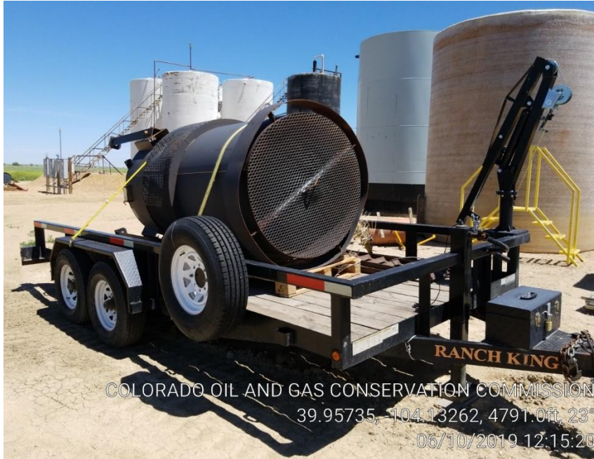
Pic 5 unused equipment