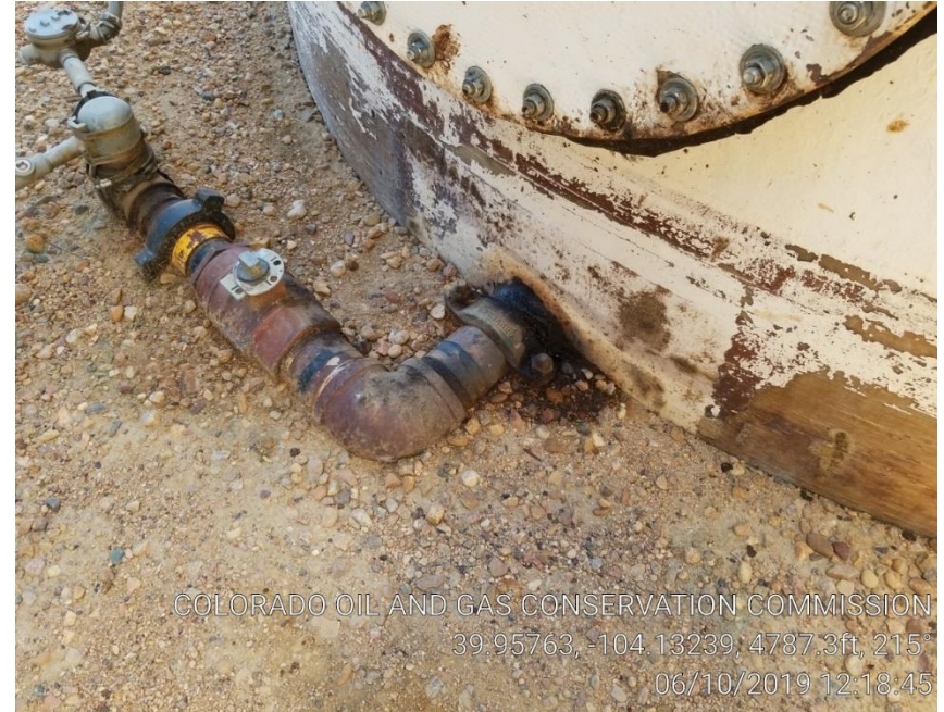
Pic 12 stained soil/possible leak