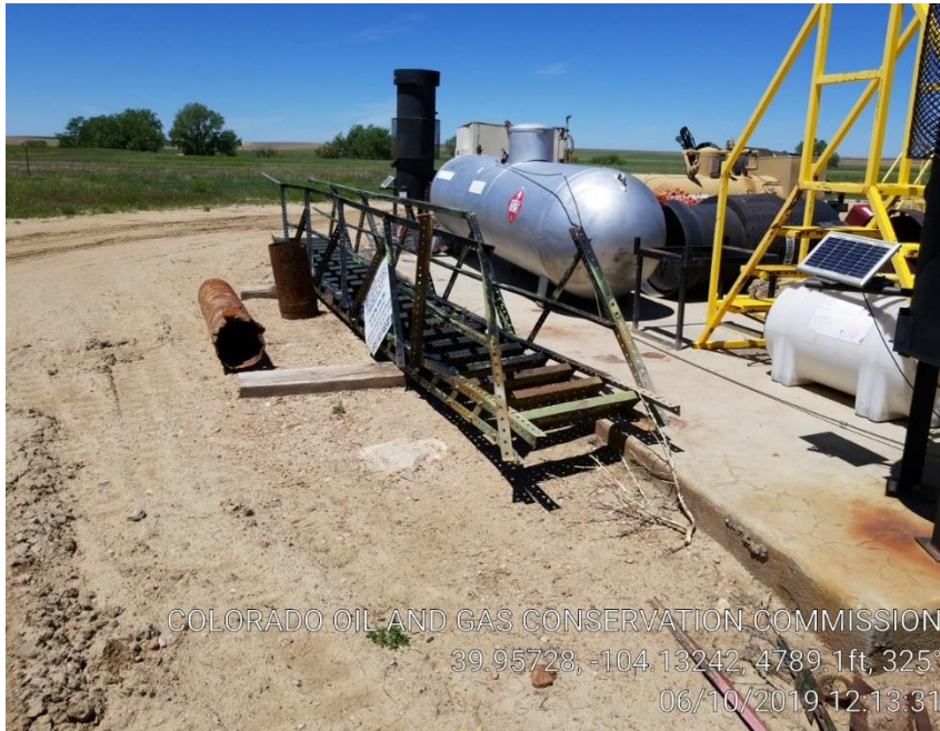
Pic 1 unused equipment