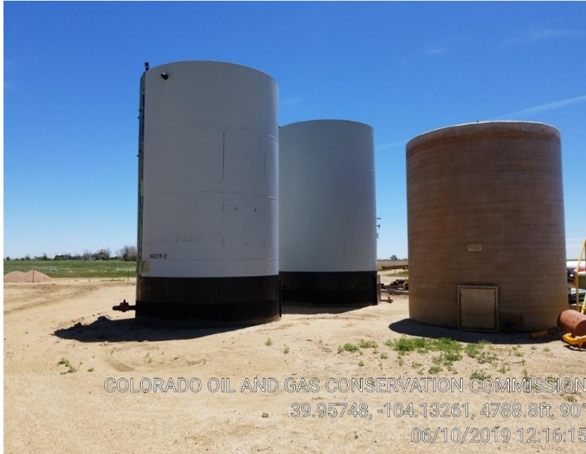
Pic 9 unused equipment