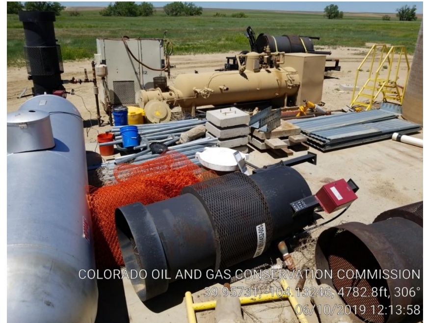
Pic 4 unused equipment