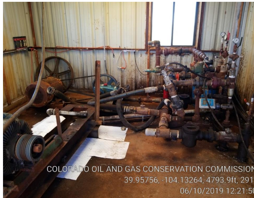
Pic 14 pump house