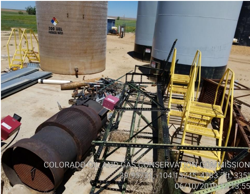
Pic 3 unused equipment