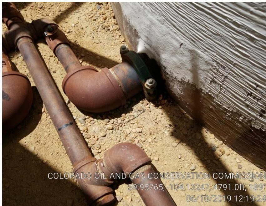
Pic 13 stained soil/possible leak