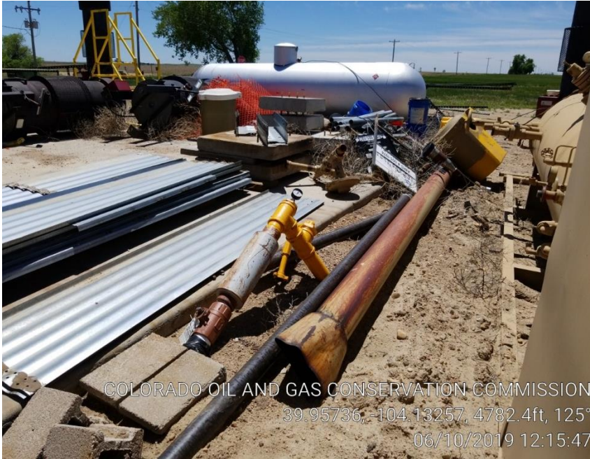
Pic 7 unused equipment