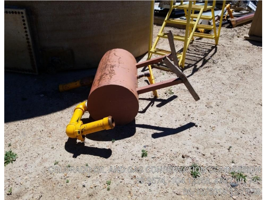
Pic 8 unused equipment