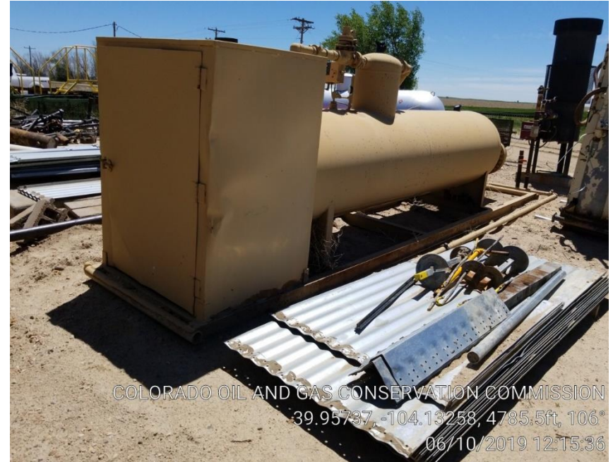
Pic 6 unused equipment