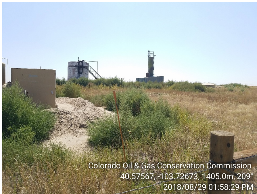
Photo #3 Northrup 1-14, 2-14, Chinook #1 Battery Shut-down from prior insp.