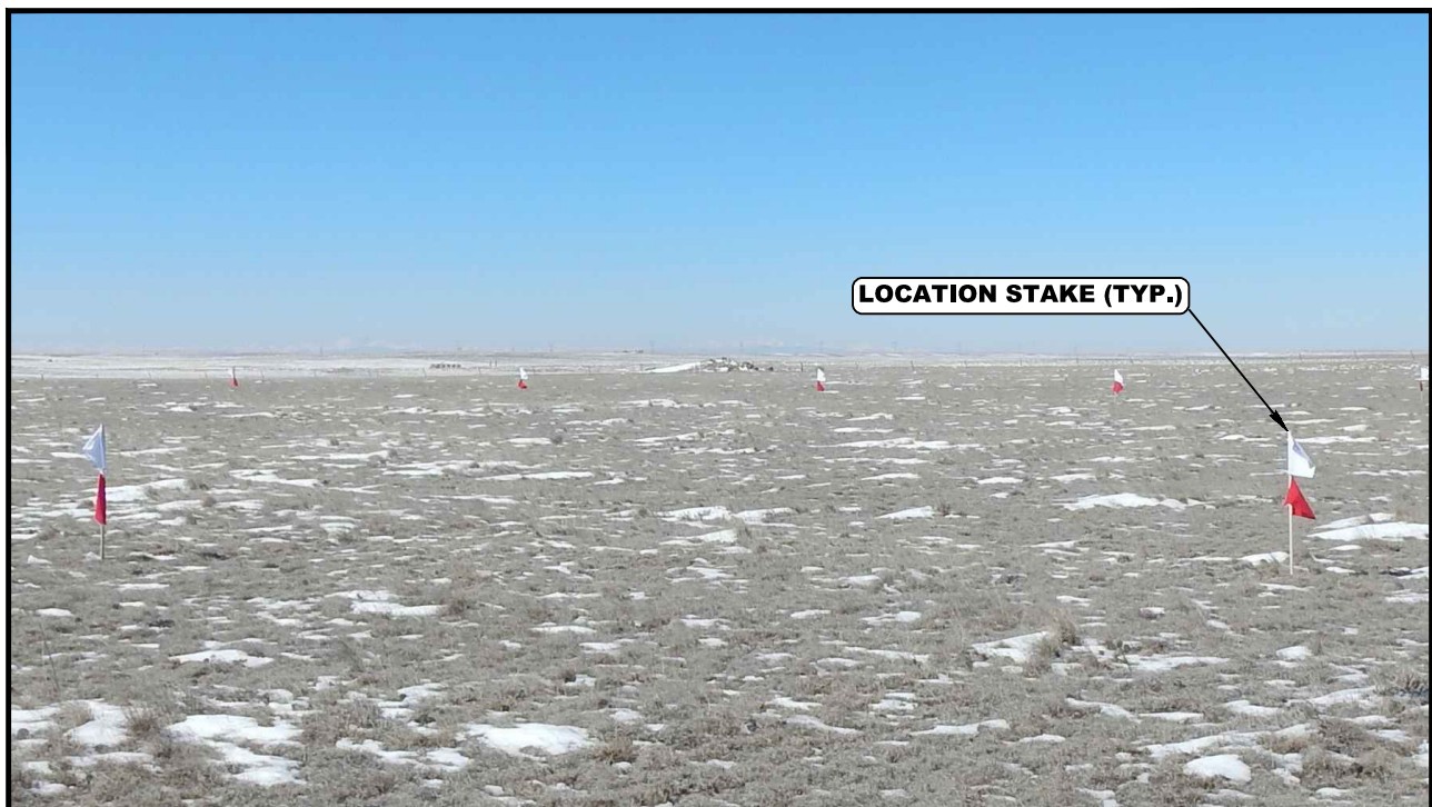
PHOTO: VIEW OF LOCATION STAKES