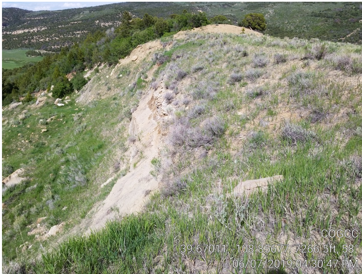
Photo 3. West side of location sliding off.

Kirby Eidson 28-4 API: 05-103-08974 Inspection: 679704407