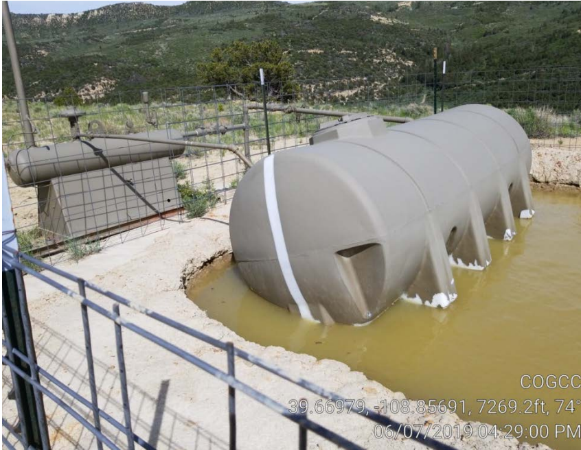
Photo 9. Blowdown tank floating in secondary containment.