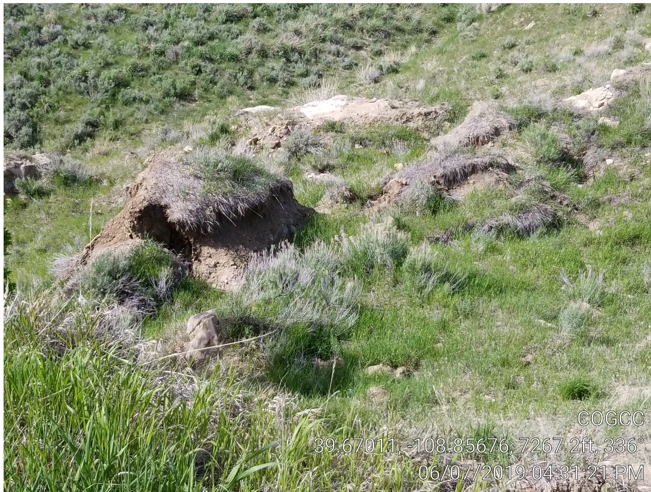
Photo 4. Close up of hillside sliding.

Kirby Eidson 28-4 API: 05-103-08974 Inspection: 679704407