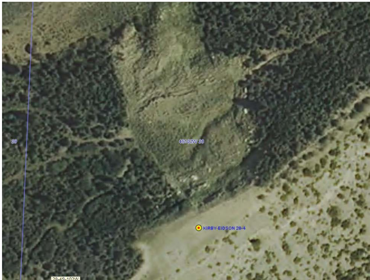
Photo 6. Location & landslide from 2013 satellite image

Kirby Eidson 28-4 API: 05-103-08974 Inspection: 679704407