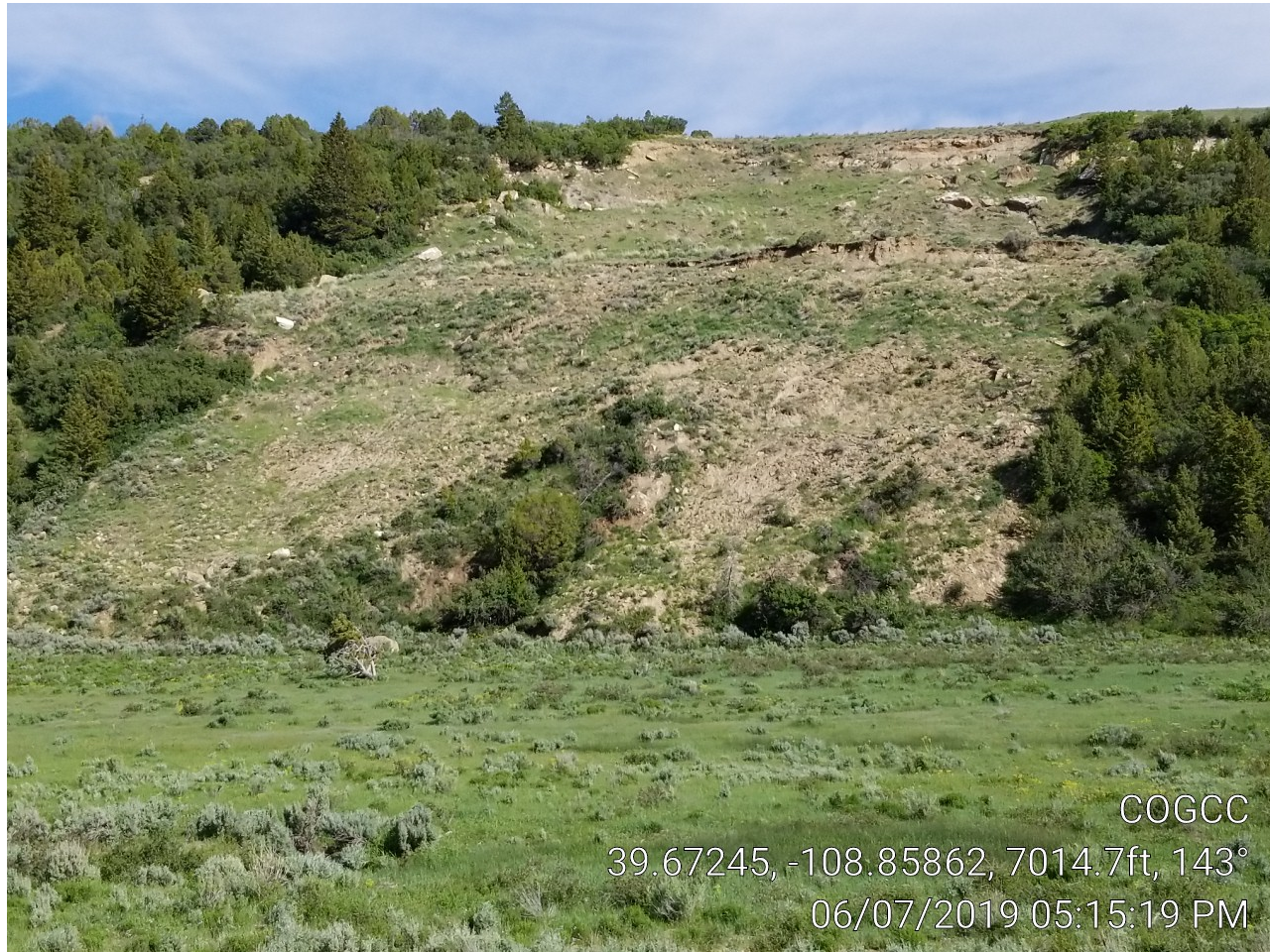
Photo 2. Landslide off edge of location.