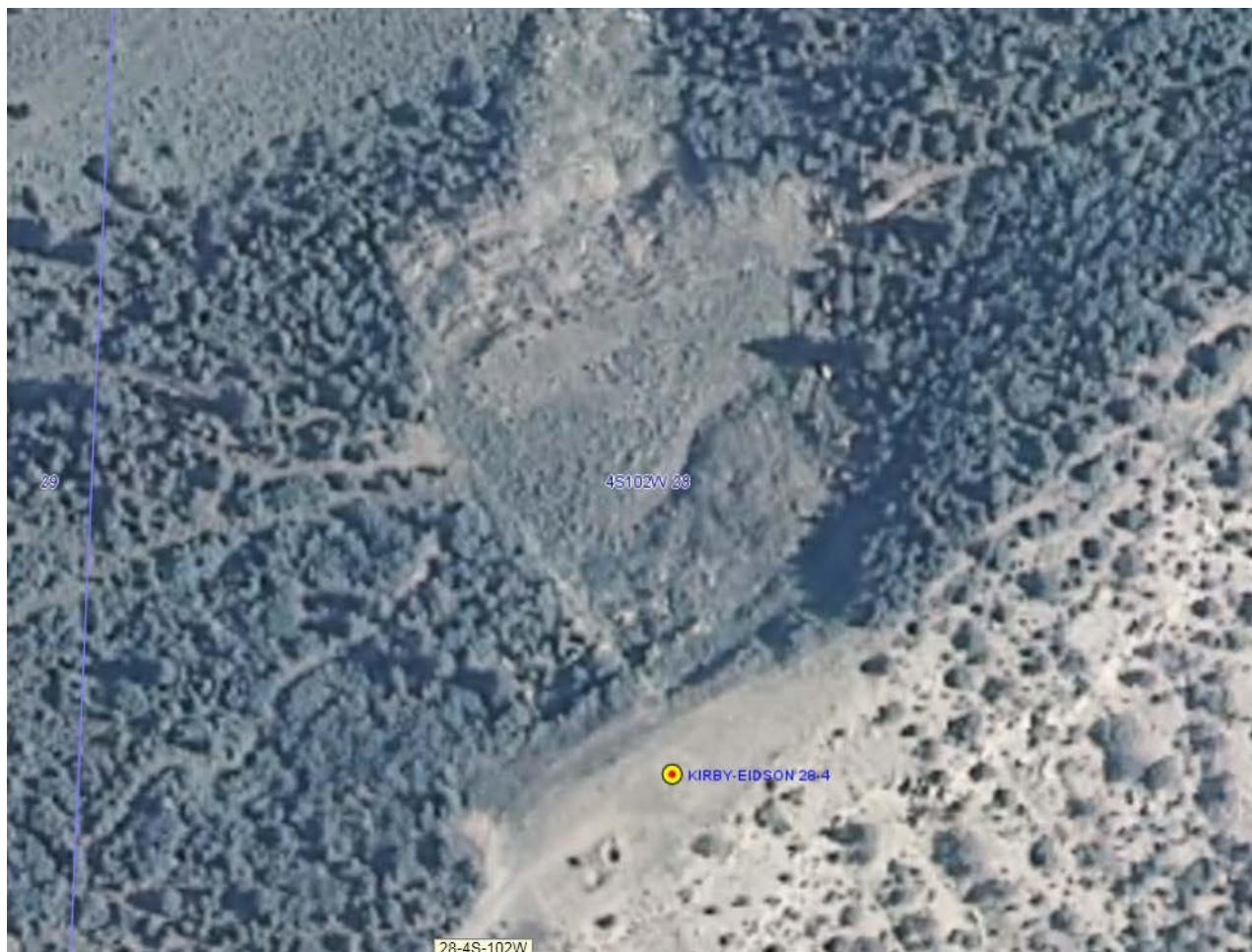
Photo 7. Location & landslide from 2009 satellite image

Kirby Eidson 28-4 API: 05-103-08974 Inspection: 679704407