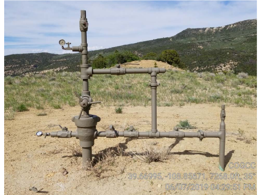
Photo 10. Wellhead without sign.