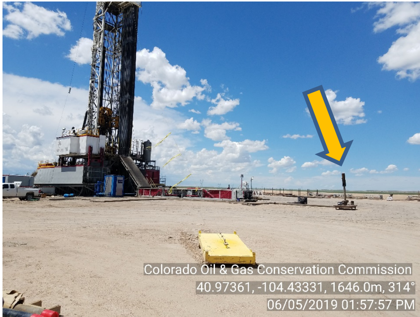
Photo #1 Fox Creek # 12-63-33-0758B (05-123-48512) Drill site Drilling Open Flare