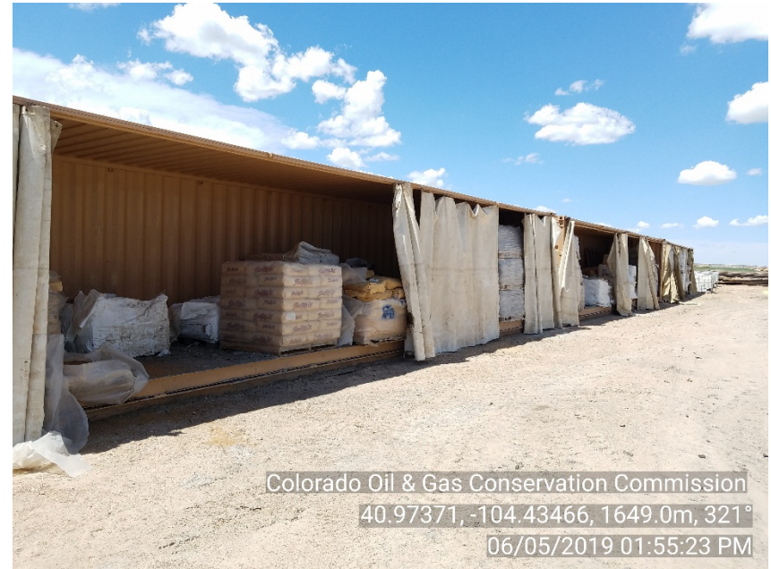
Photo #2 Fox Creek # 12-63-33-0758B Chemical Storage Improper Storage Plastic covers torn / Tarps open