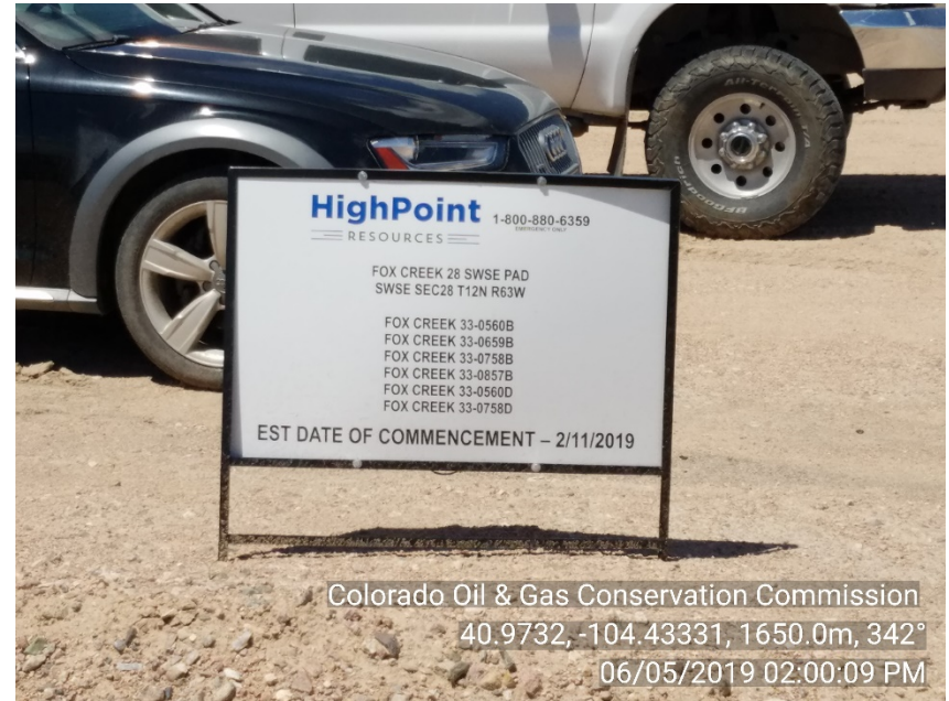
Photo #4 Fox Creek # 12-63-33-0758B Drill Site Facility sign at location entrance