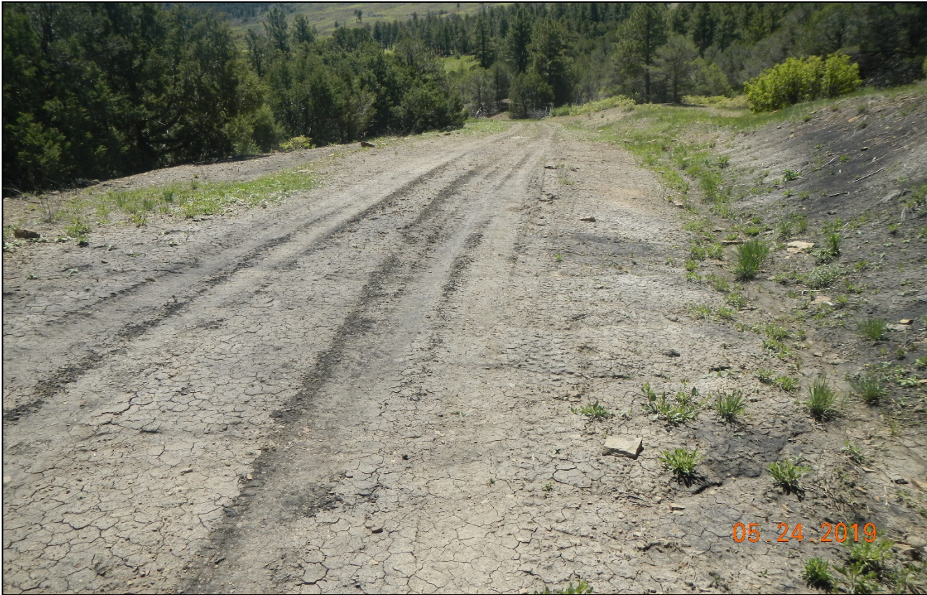
Photo 2. Facing toward the access road to the well site. Near the beginning of the road.