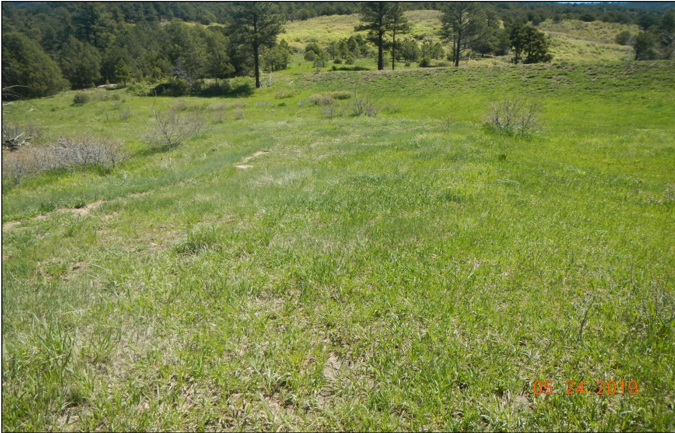
Photo 4. Facing northeast along the reclaimed portion of the access road.