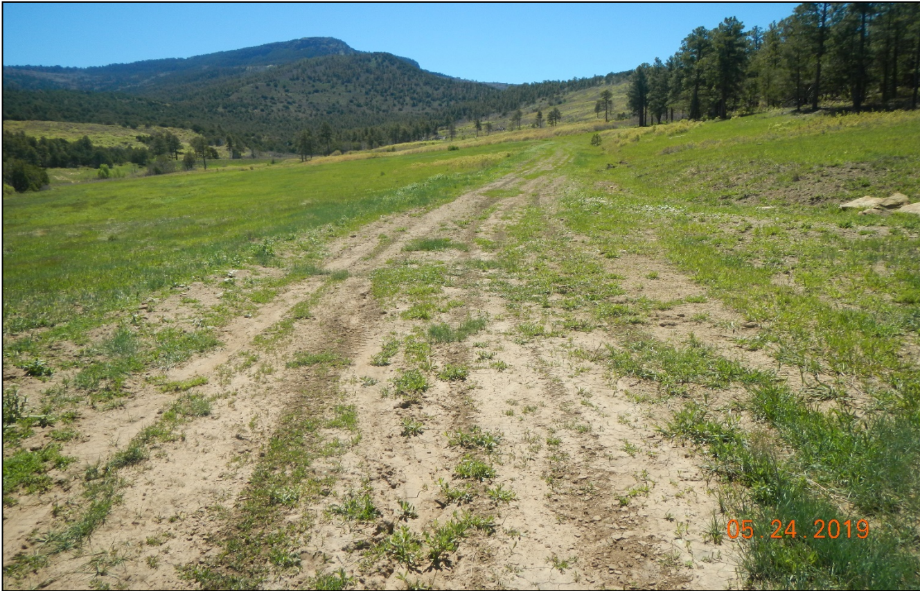
Photo 3. Facing southeast along the access road.