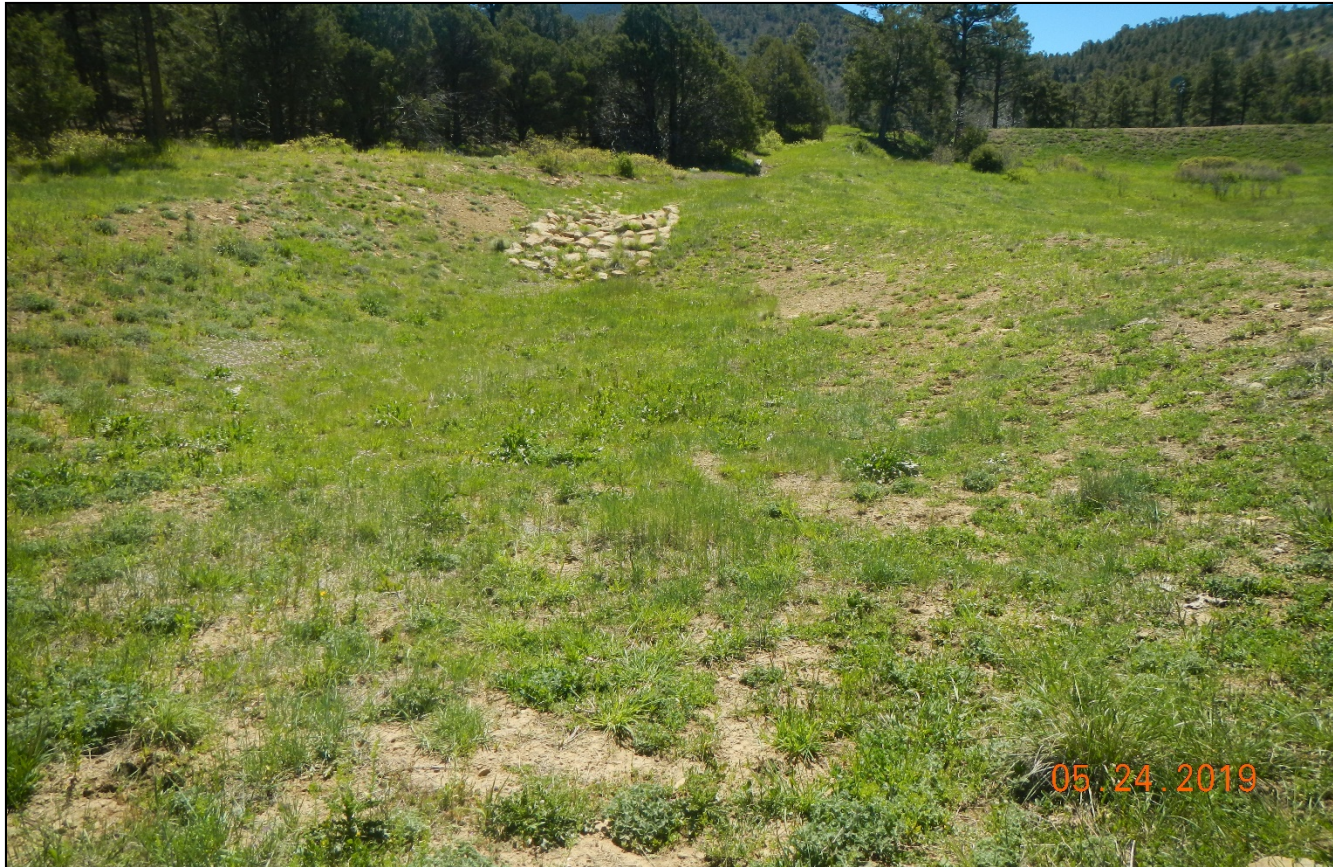
Photo 6. Facing east toward the location. A shallow pit remains per approved variance request.