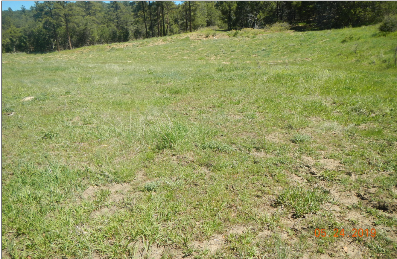
Photo 5. Facing north toward the location. Vegetation is well established and consist of Bro ine, Pas smi.