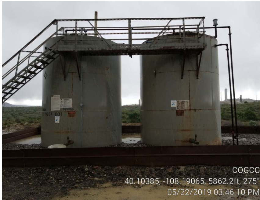
Photo 2. Tank battery.