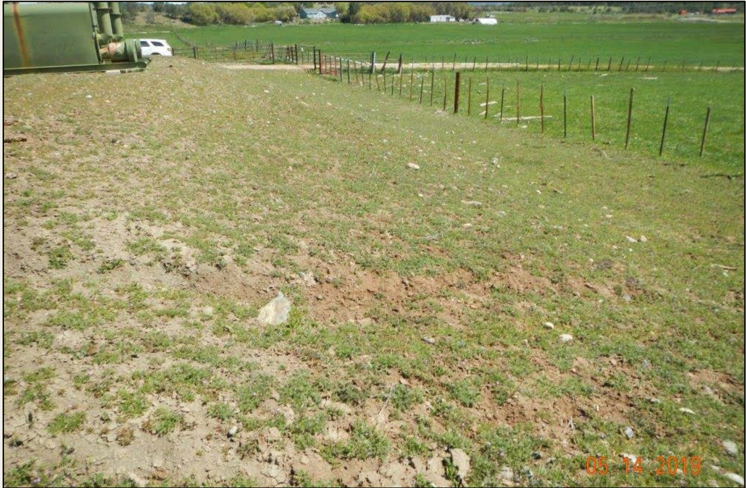
Photo 2. View of musk thistles in foreground and background, within the southern project area.