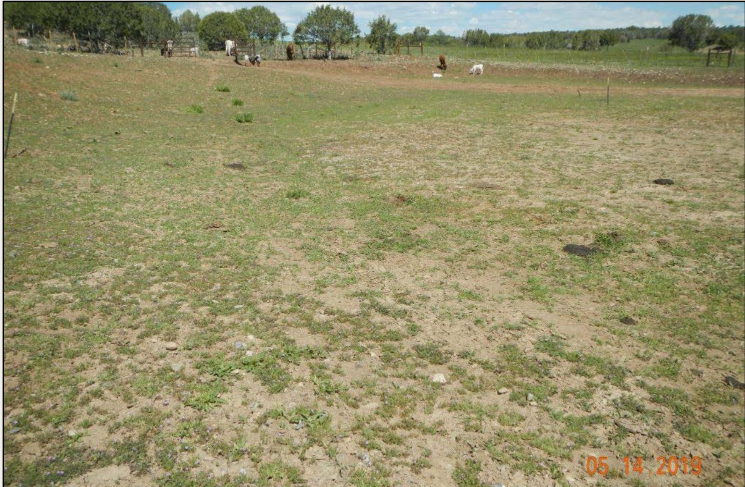
Photo 1. View of the southern project area from the southeastern corner facing westward.