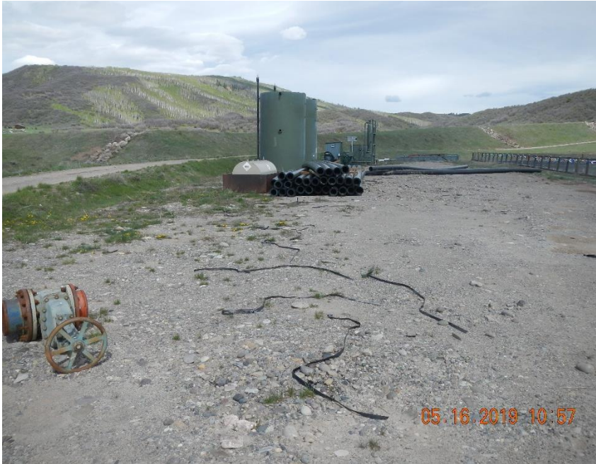
Water transfer pipe joints and production equipment from nearby well pad remain on site.