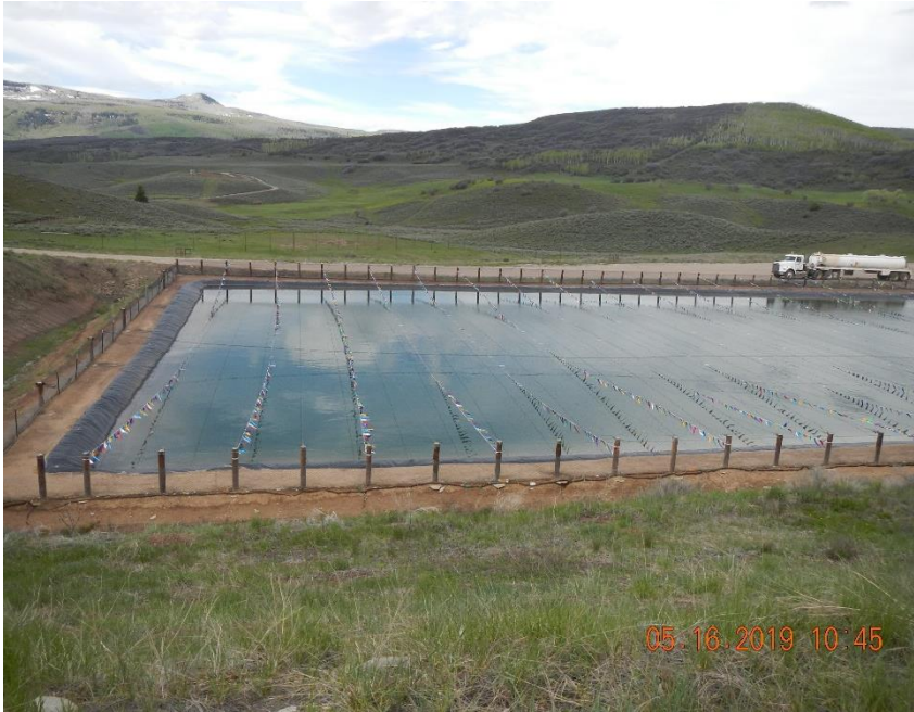
Pit Facility ID #418791. Ensure that 2' of freeboard exists in both pits, at all times.