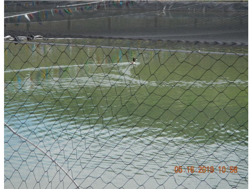
Duck observed in lower pit.