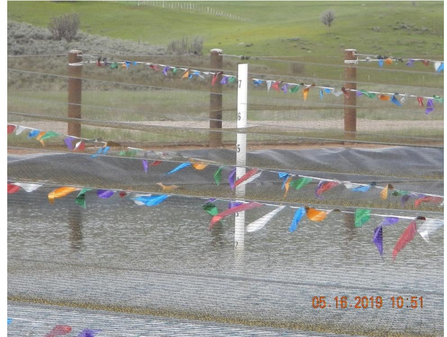
Pit Facility ID #418790 gauge stick reads almost 12'.