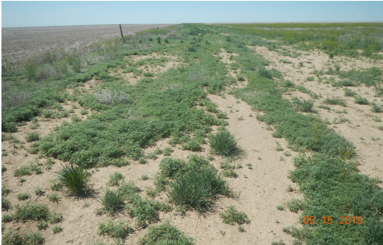
Photo 1. Facing south along the former access road. There is predominately weeds (Kochia) growing along the road.