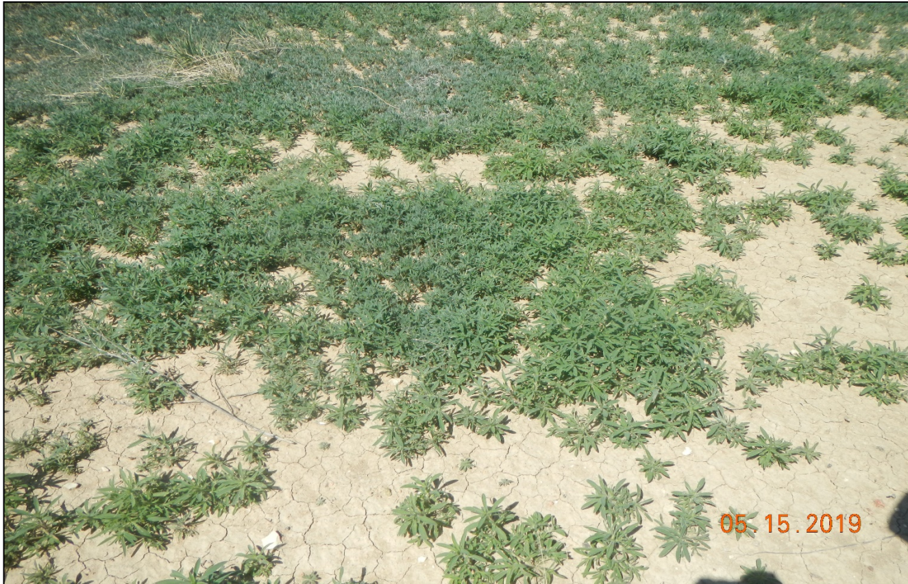
Photo 4. View of undesirable weed growth.