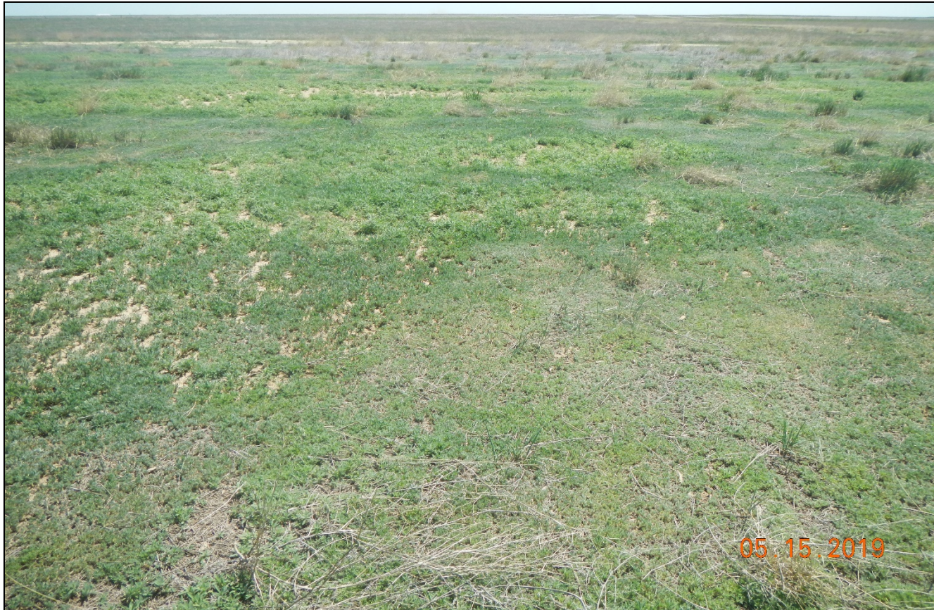
Photo 5. Facing east toward the location. There is predominately weeds (Kochia) growing at the location.