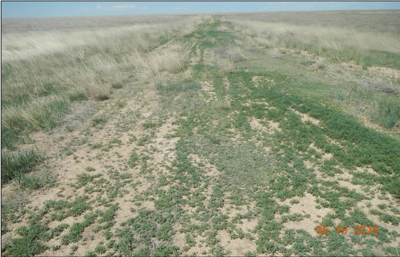
Photo 2. Facing west along the former access road. There is predominately weeds (Kochia) growing along the road.