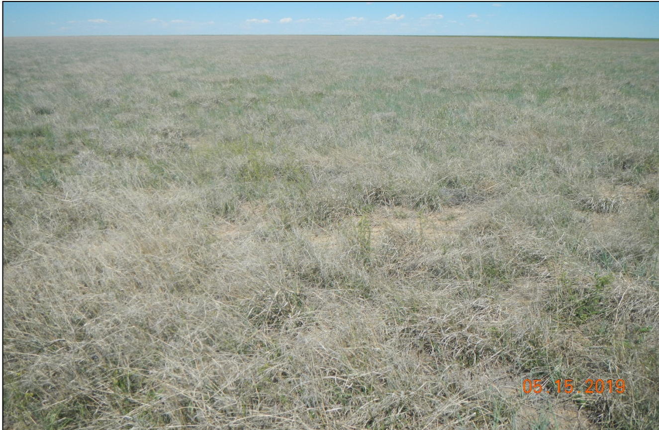
Photo 7. Facing toward the surrounding undisturbed pasture which contains Bou gra, Spo cry, Oli ari, Pas smi, among other native plants.