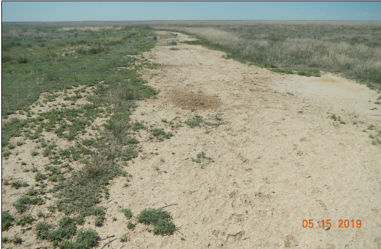
Photo 6. Facing south at the east side of the location. Vegetation is not establishing in this area.