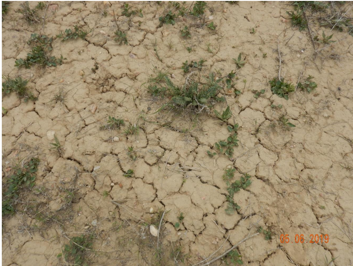
Photo 20: Photo taken from the ditch on the west end of the location. Photo shows Canada Thistle rosettes are now present on the west end of the location.