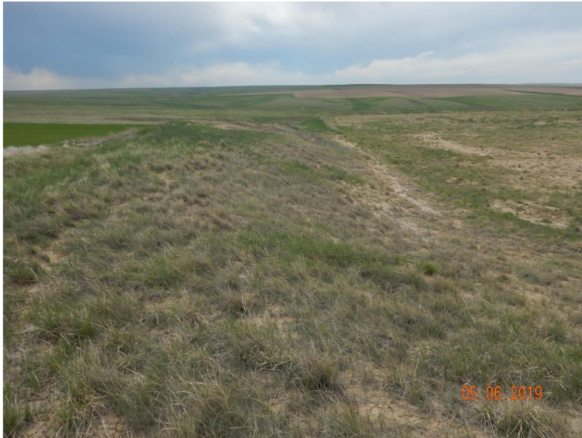
Photo 15: Photo taken from the southeast end of the location, facing west. Corrective actions and COAs required operator to conduct reclamation and reduce the location's disturbance area to 0.92 acres. Photo shows reclamation has not been conducted; disturbance area has not been reduced.