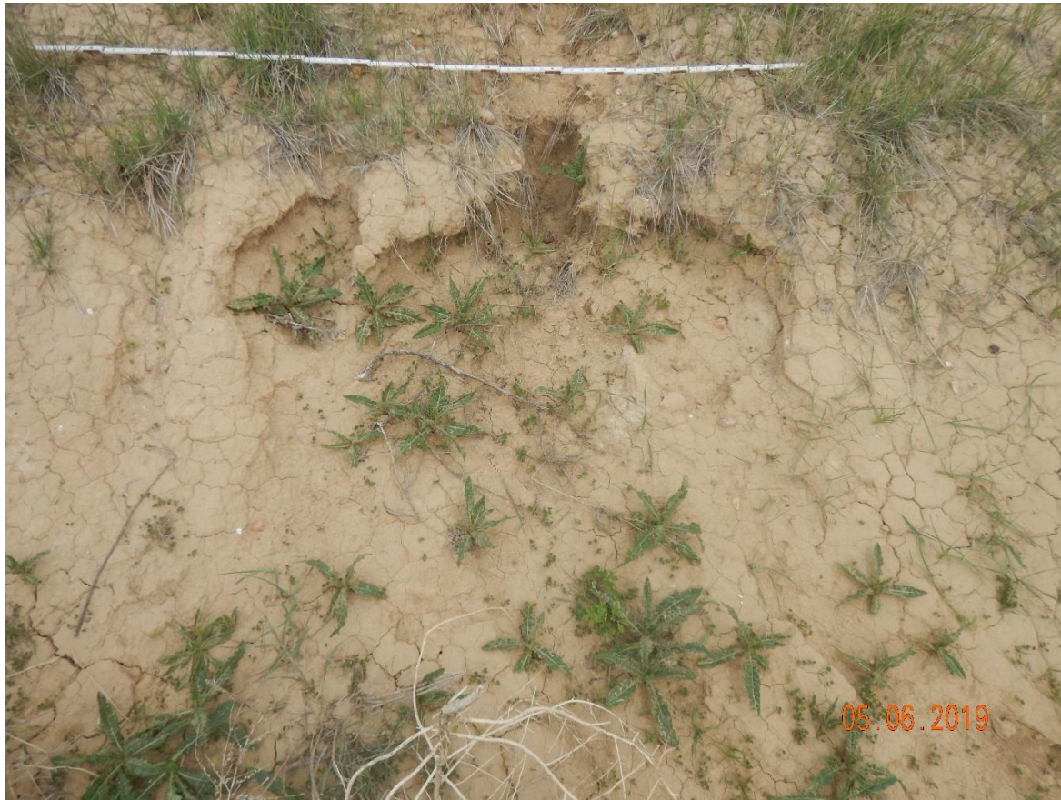
Photo 28: Continued from photo 26. Photo shows Canada thistle rosettes within ditch.