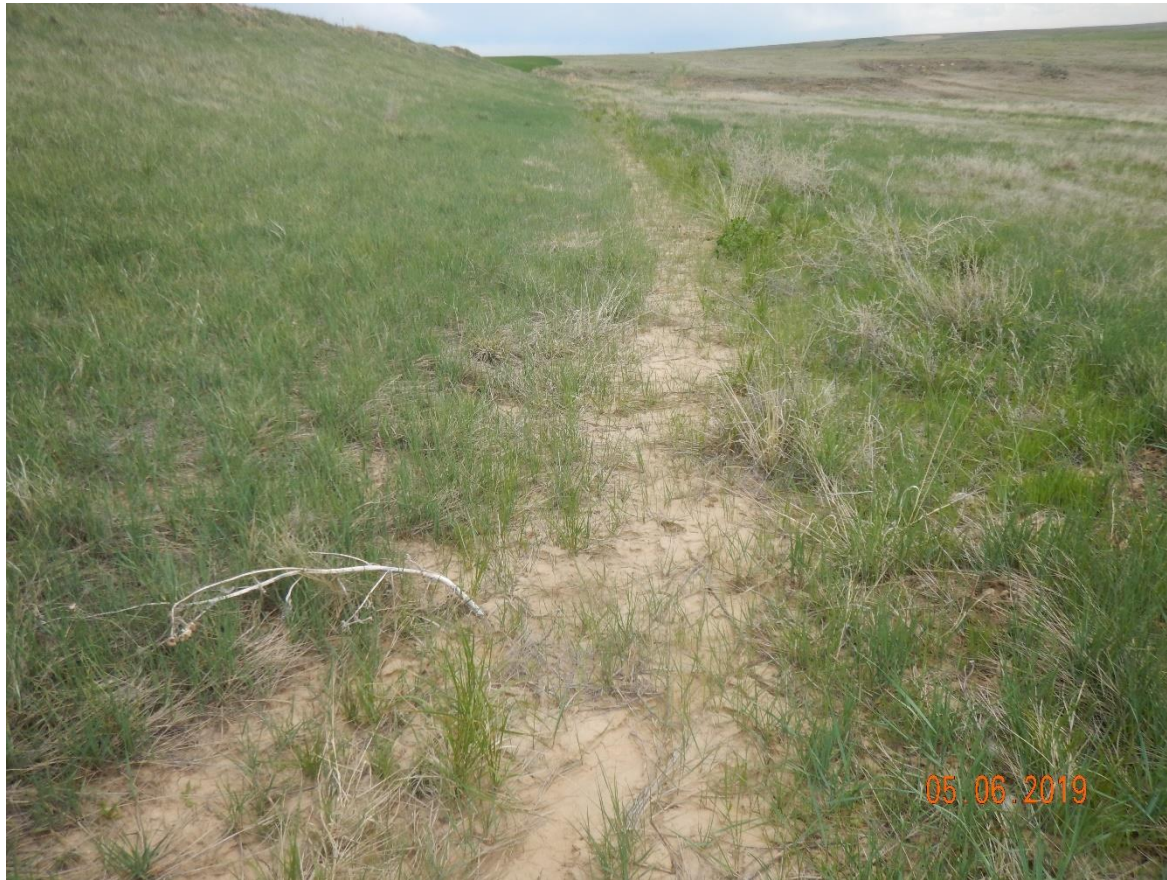
Photo 35: Photo taken from the stormwater ditch along the perimeter of the west end of the location. Previous inspections documented that the ditch BMP has filled with sediment and is no longer in proper functioning condition. Additionally, BMP should have been reclaimed during interim reclamation. Photo shows BMP remains filled with sediment. Photo also shows interim reclamation to reduce the area of disturbance has not been conducted.