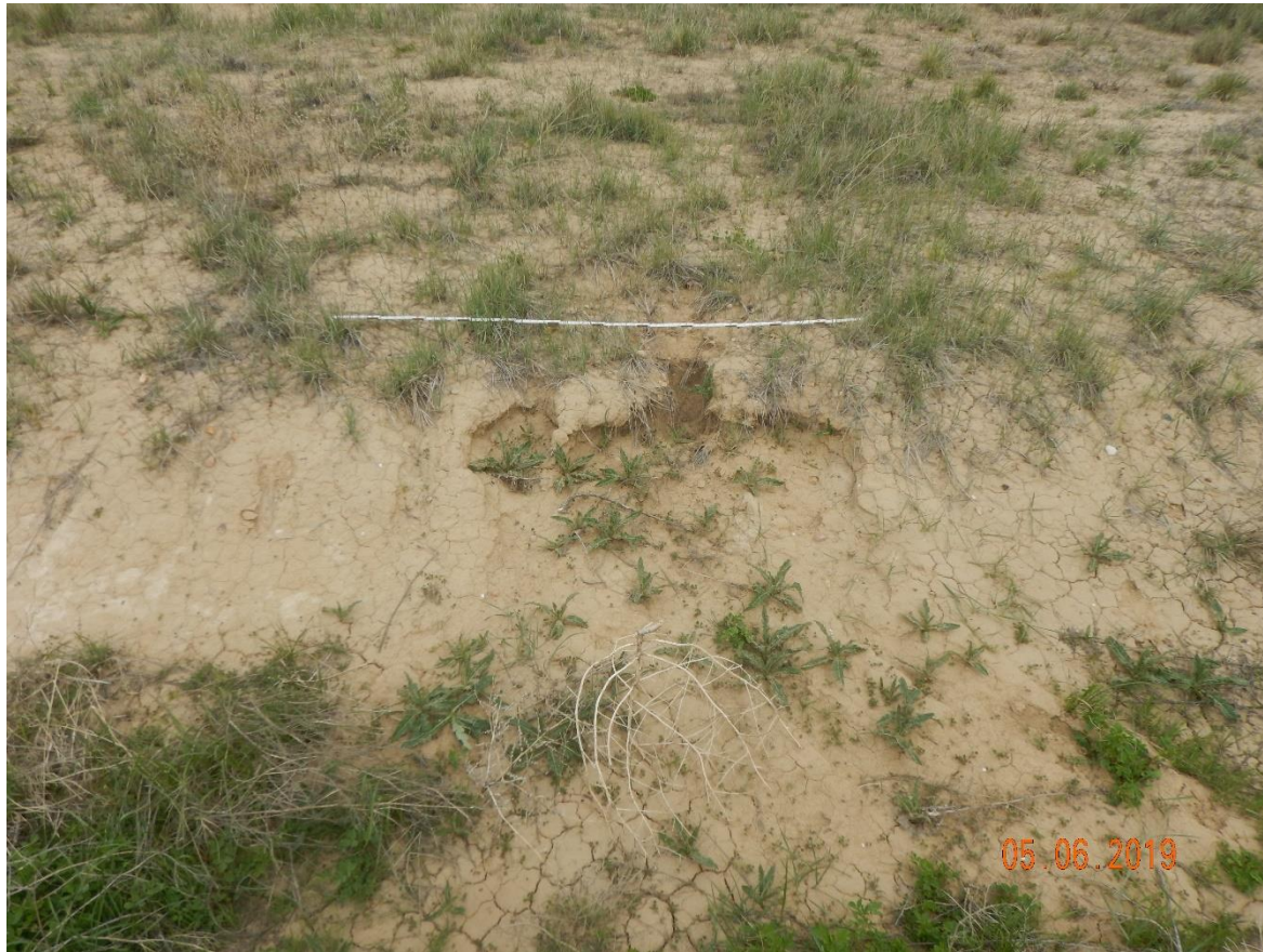
Photo 27: Photo taken from the ditch on the northwest end of the location, facing east. Photo shows erosion degradation cutting eastward into the pad has not been repaired or stabilized. 6 foot measuring stick for reference.