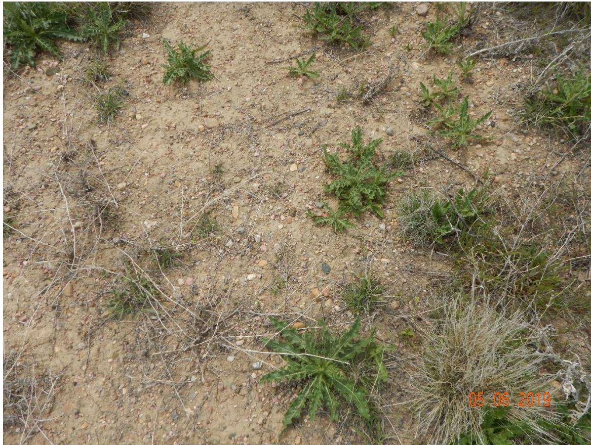
Photo 6: Continued from photo 5. Photo shows Canada thistle rosettes on location. Operator does not appear to be conducting ongoing weed management.