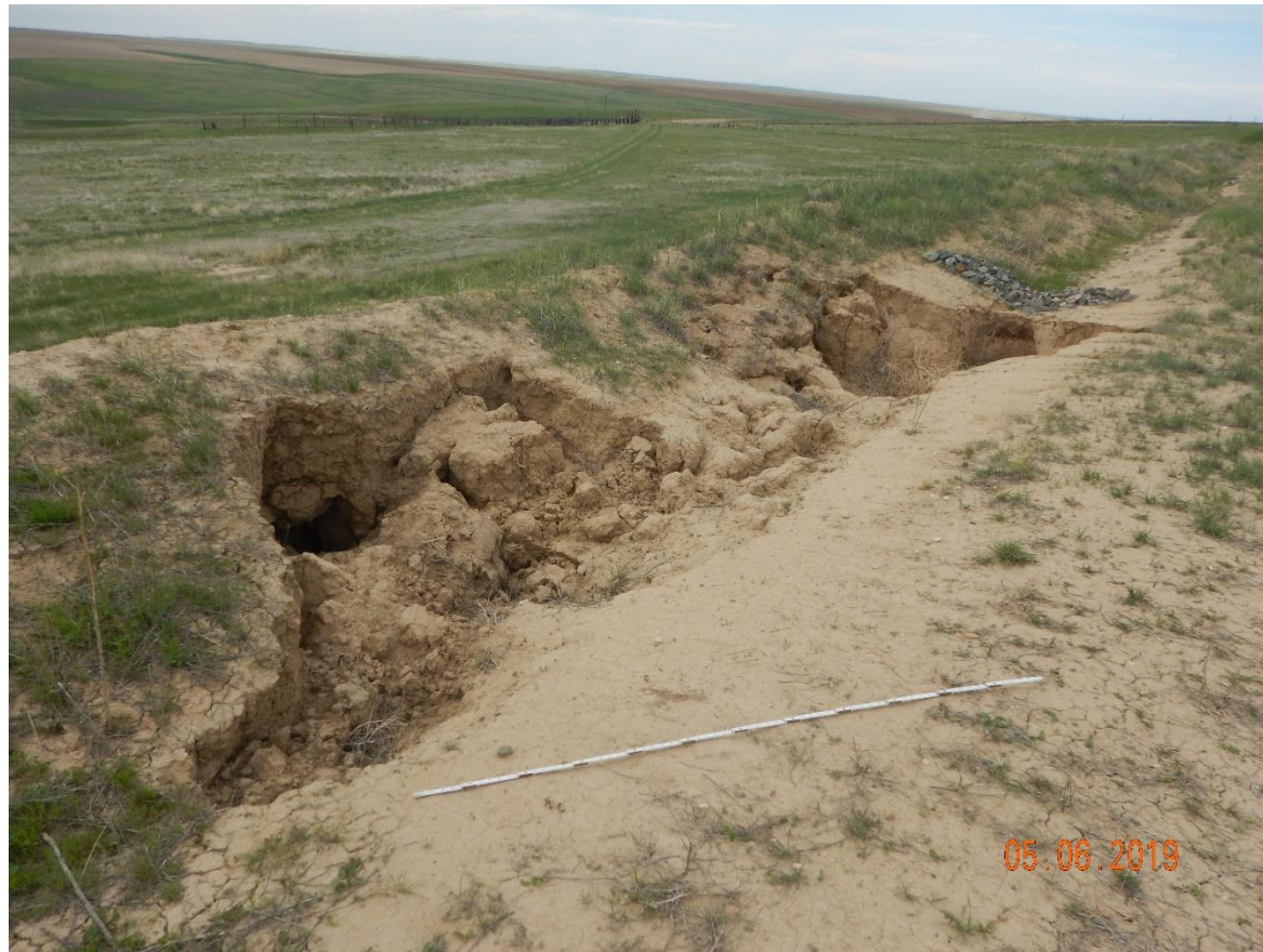
Photo 22: Photo taken from the ditch on the west end of the location, facing northwest. See comments under photo 20. 6 foot measuring stick for reference.