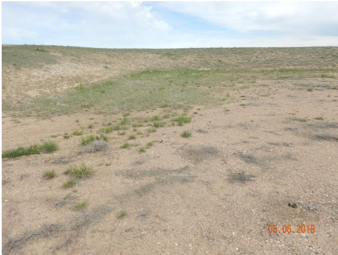
Photo 1: Photo taken from the north end of the location, facing east. Photos 1-4 provide an overview of the location from east, southeast, southwest, to west. Corrective actions and COAs required operator to conduct reclamation and reduce the location's disturbance area to 0.92 acres. Photos show reclamation has not been conducted; disturbance area has not been reduced.