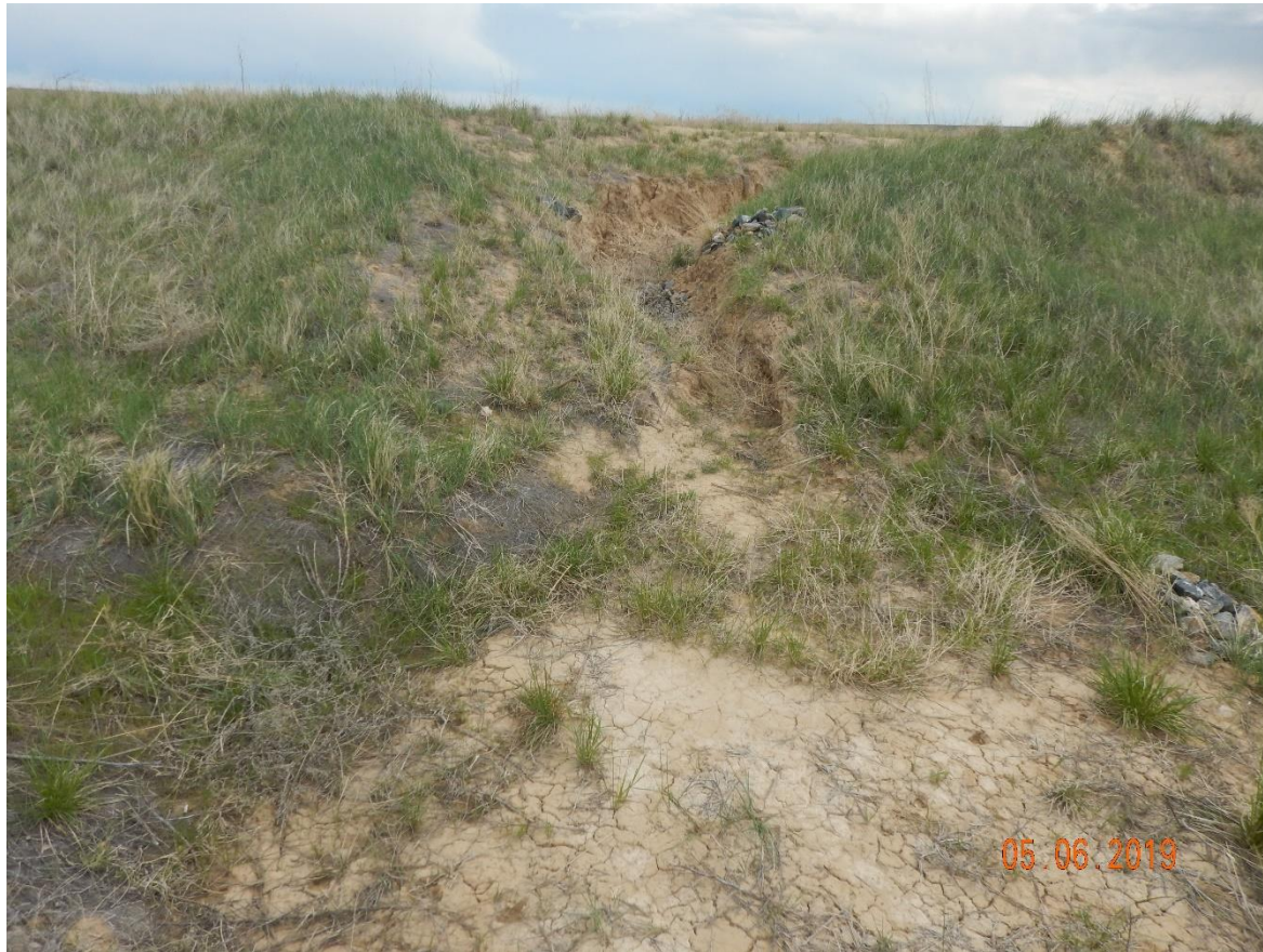
Photo 34: Photo taken from the north end of the location, facing south. Photo shows gulley erosion due to stormwater runoff from the ditch has not been repaired or stabilized.