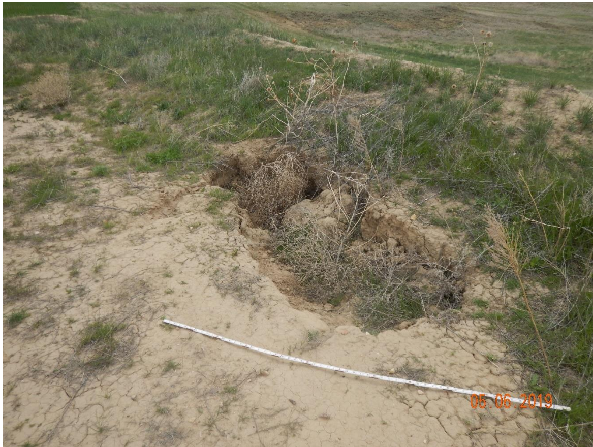
Photo 21: Photo taken from the ditch on the southwest corner of the location, facing southwest. Previous inspections documented that stormwater runoff has incised the ditch along the west end of the pad and created sinkholes within the ditch. Photo shows erosion degradation has not been repaired and stabilized. Stormwater has continued to incise within the ditch and sinkholes appear to be expanding. 6 foot measuring stick for reference.