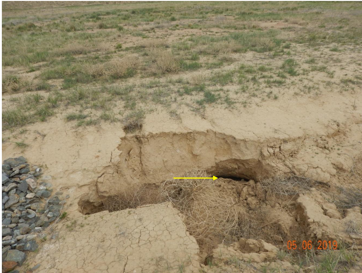
Photo 26: Photo taken from the ditch on the west end of the location, facing east. See comments under photo 20. Photo shows additional sinkhole from ditch expanding under pad. 6 foot measuring stick for reference.