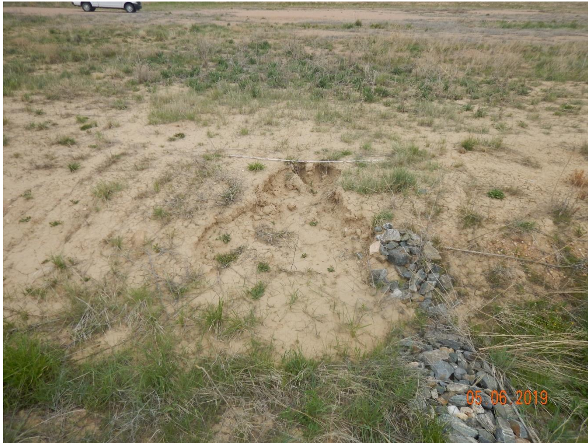
Photo 30: Photo taken from the ditch on the northwest end of the location, facing east. Photo shows erosion degradation cutting eastward into the pad has not been repaired or stabilized. 6 foot measuring stick for reference.