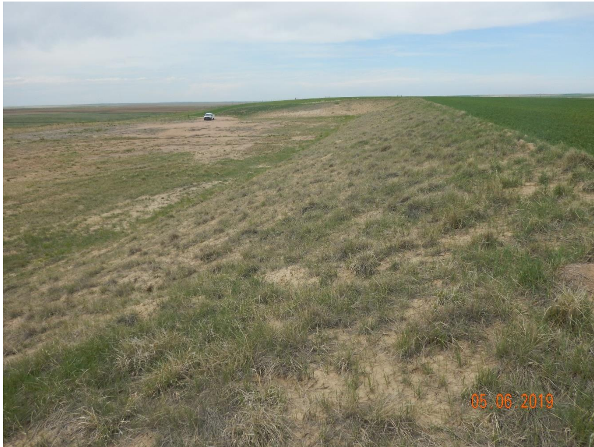
Photo 14: Photo taken from the southeast end of the location, facing north. Corrective actions and COAs required operator to conduct reclamation and reduce the location's disturbance area to 0.92 acres. Photo shows reclamation has not been conducted; disturbance area has not been reduced.