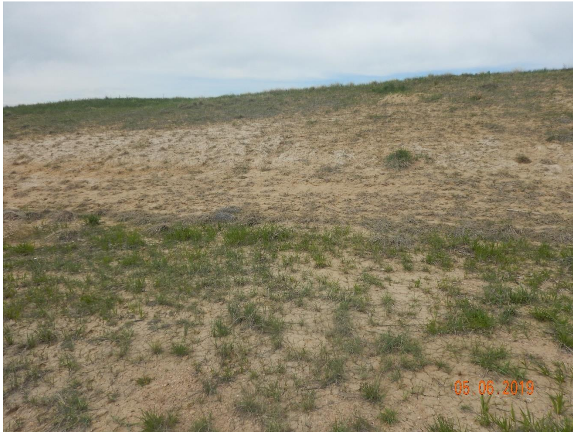
Photo 7: Photo taken from the northeast end of the location, facing north. Previous inspections documented that the cut slopes on the east end of the location remain predominantly bare and exposed soil with erosion degradation evident. Photos 7-10 show erosion degradation has not been repaired, no BMPs have been installed, and no revegetation activities appear to have been conducted.