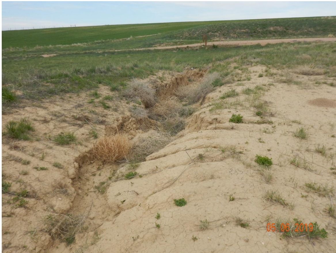
Photo 31: Photo taken from the north end of the location, facing northeast. Photo shows gulley erosion due to stormwater runoff from the ditch has not been repaired or stabilized.