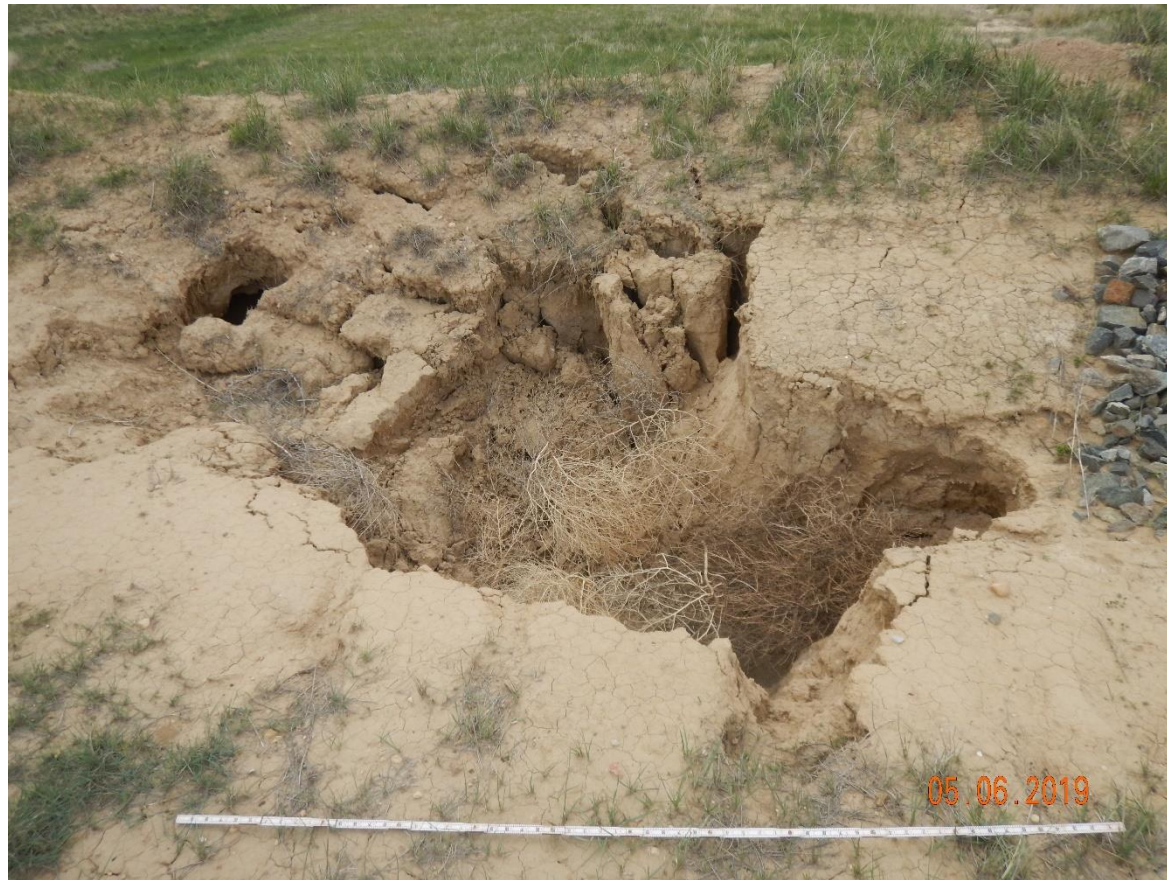
Photo 24: Photo taken from the ditch on the west end of the location, facing west. See comments under photo 20. 6 foot measuring stick for reference.