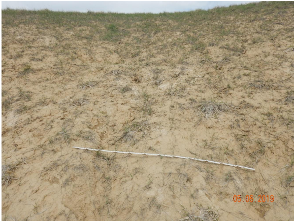
Photo 9: See comments under photo 7. 6 foot measuring stick for reference.