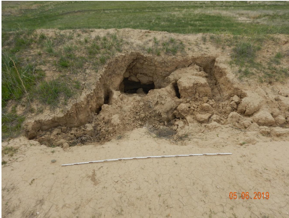
Photo 23: Photo taken from the ditch on the west end of the location, facing west. See comments under photo 20. 6 foot measuring stick for reference.