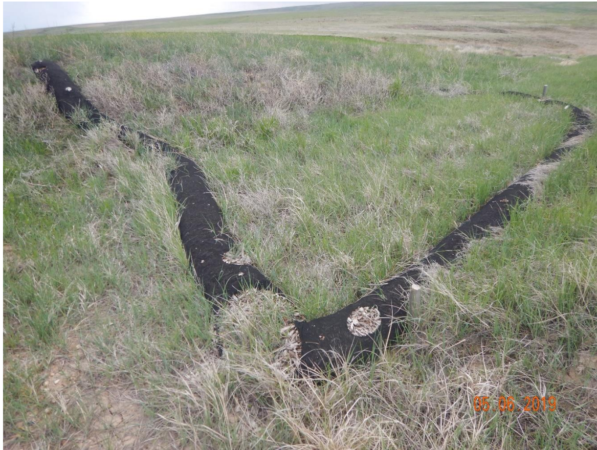
Photo 17: Photo taken from south end of the location, facing southwest. Photo shows wood-mulch wattle stormwater ponding BMP. Previous inspections documented BMP was degrading. Photo shows BMP has not been maintained/repaired.