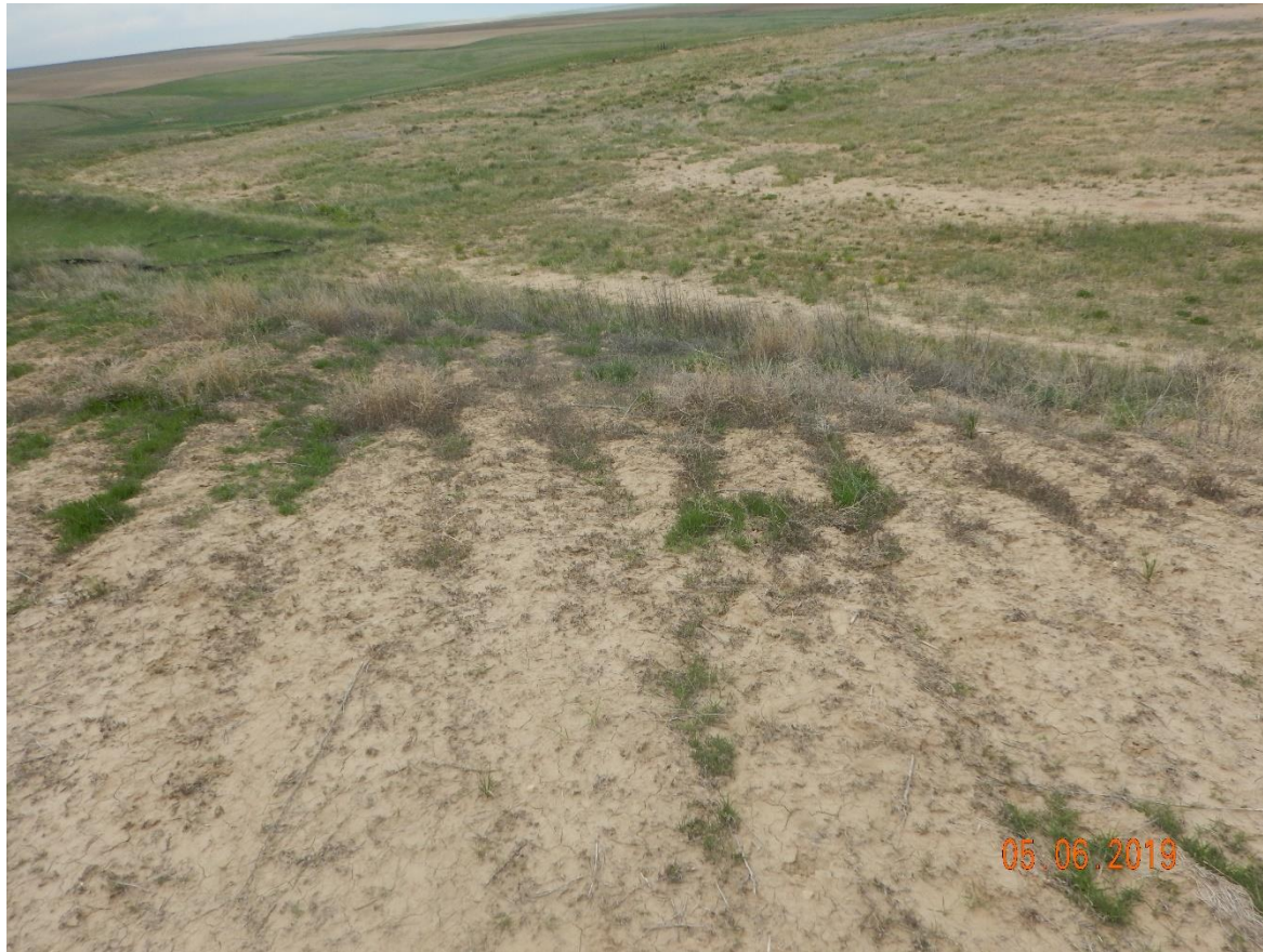
Photo 16: Photo taken from the “spoils” stockpile on the south end of the location, facing northwest. Photo shows areas of bare and exposed soil with large furrows. Previous inspections required operator to repair erosion and stabilize slopes. Photo shows erosion has not been repaired and BMP’s have not been installed. Photo also shows reclamation activities have not been conducted per CAs and COAs