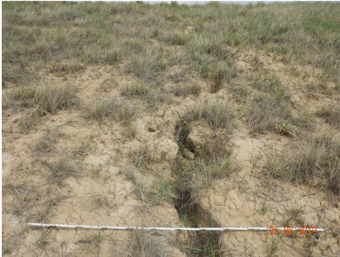
Photo 12: Photo shows gully erosion on the southeast end of the location. 6 foot measuring stick for reference.