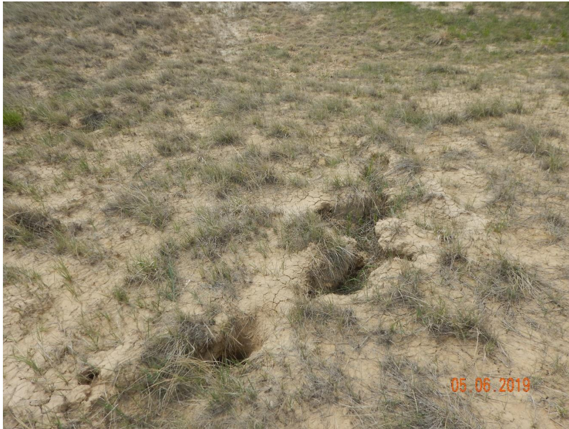
Photo 13: Photo shows gully erosion on the southeast end of the location.