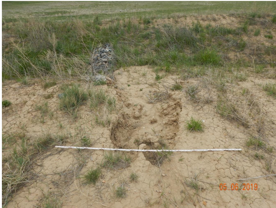
Photo 29: Photo taken from the ditch on the northwest end of the location, facing west. Photo shows erosion degradation cutting eastward into the pad has not been repaired or stabilized. 6 foot measuring stick for reference.