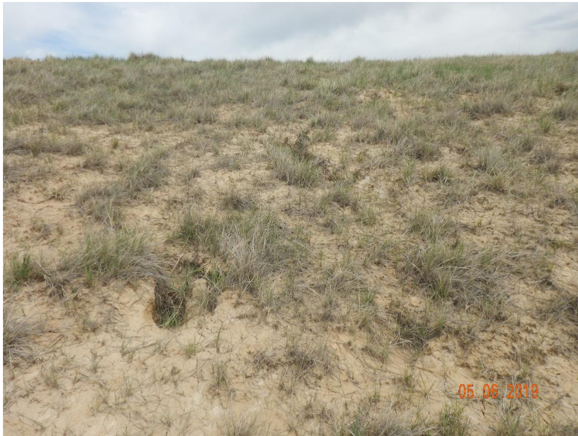
Photo 11: Photo taken from the southeast end of the location, facing east. See comments under photo 7.