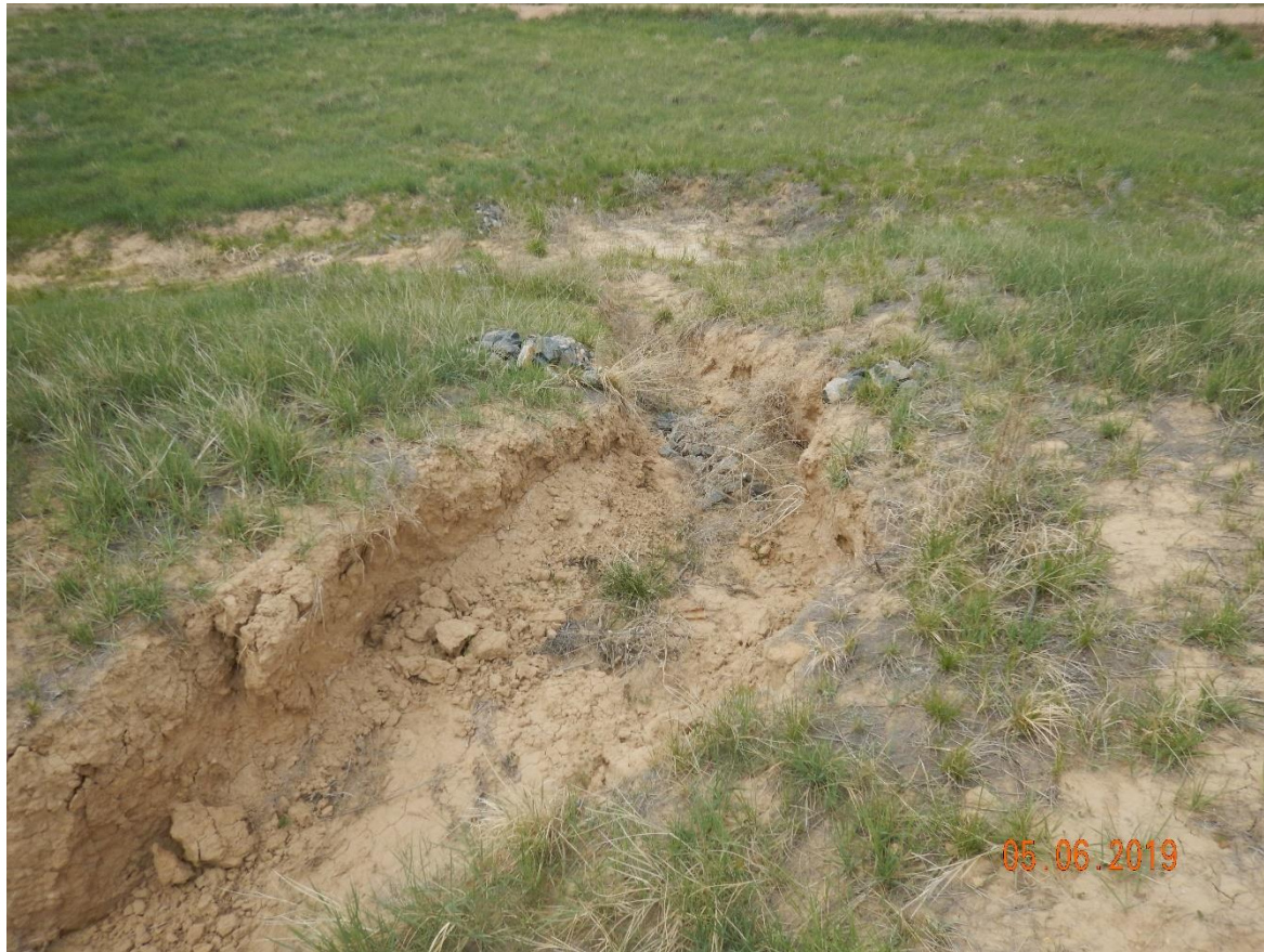
Photo 32: Photo taken from the north end of the location, facing north. Photo shows gully erosion due to stormwater runoff from the ditch has not been repaired or stabilized.