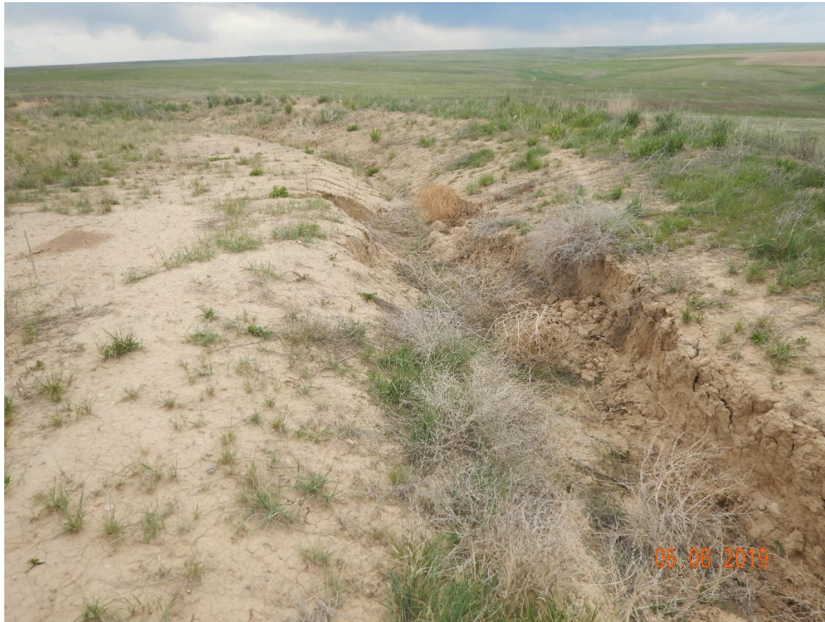
Photo 33: Photo taken from the north end of the location, facing southwest. Photo shows gully erosion due to stormwater runoff from the ditch has not been repaired or stabilized.