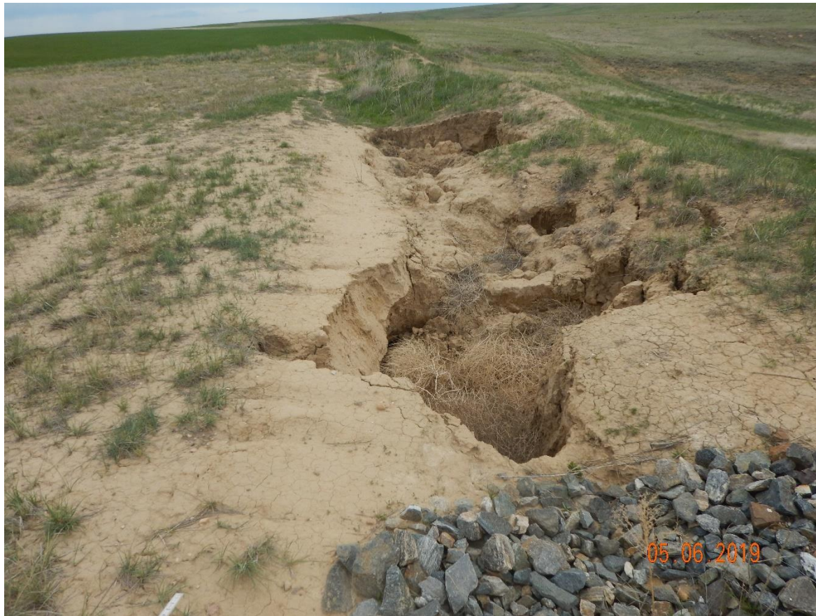
Photo 25: Photo taken from the ditch on the west end of the location, facing south. See comments under photo 20.