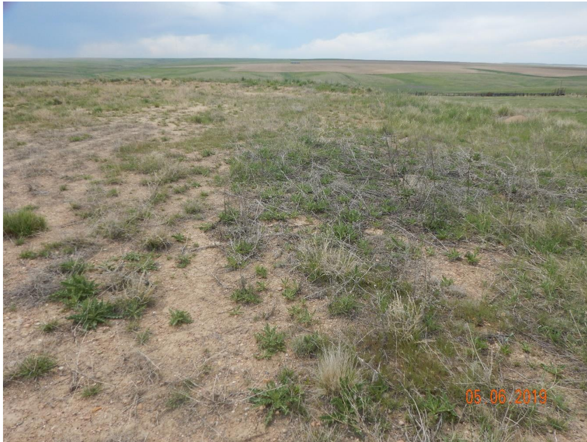
Photo 5: Photo taken from the north end of the location, facing west. Photo shows area where a patch of Canada thistle was documented. Canada thistle remains evident within this area, and appears to have expanded throughout larger areas of the location. Operator does not appear to be conducting ongoing weed management.