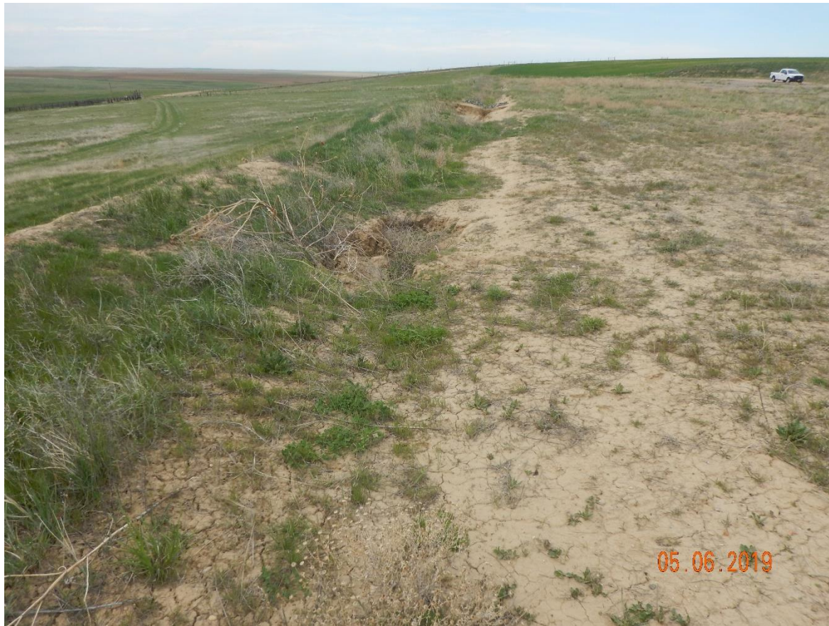
Photo 19: Photo taken from the southwest corner of the location, facing north. Photo shows stormwater ditch along perimeter of the pad.