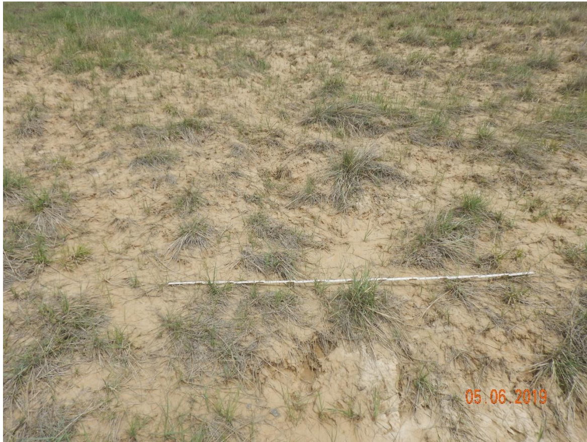
Photo 10: See comments under photo 7. 6 foot measuring stick for reference.