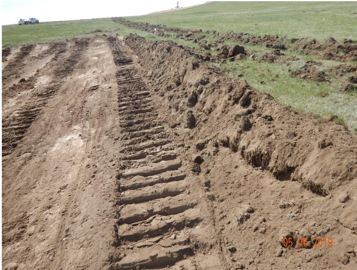
Photo 5: Photo taken from west end of the location. Photo shows operator is salvaging ~1 foot of soil (including topsoil) from the location.