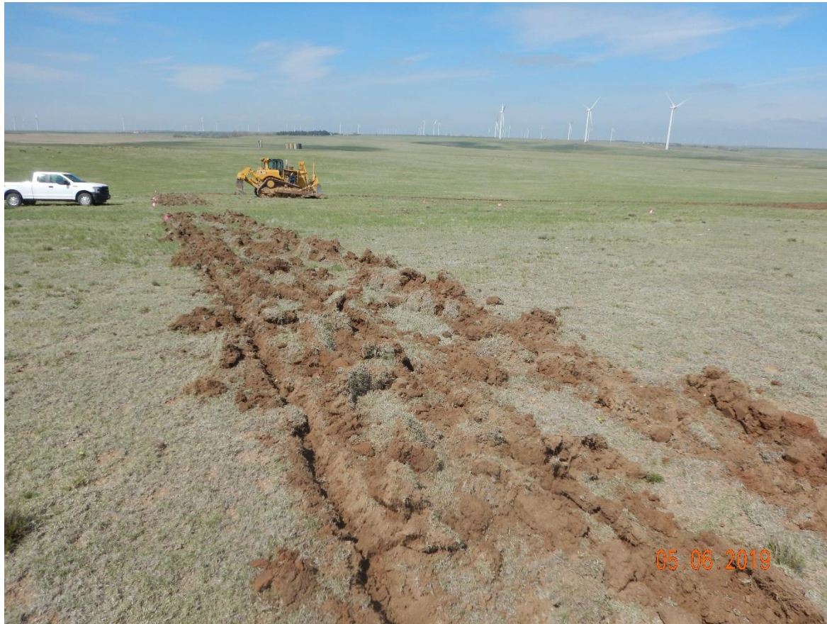
Photo 1: Photo taken from the south end of the location, facing west. Photos 1-4 provide an overview of the location and construction in process from west, northwest, northeast to east. Photos also show Operator has installed surface roughening along the perimeter of the disturbance area.