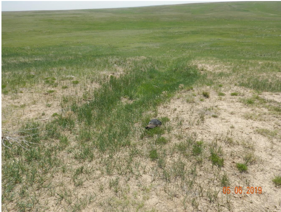
Photo 13: Photo taken from the south end of the location, facing south. Photo shows gully erosion on the fill slopes of the location. Hat for reference.