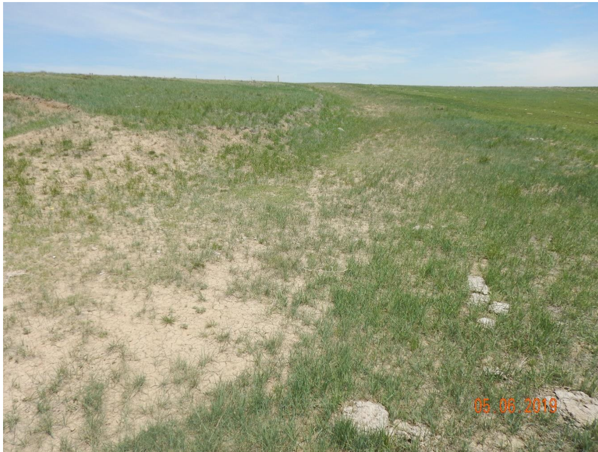
Photo 14: Photo taken from the east end of the location, facing north. See comments under photo 10.