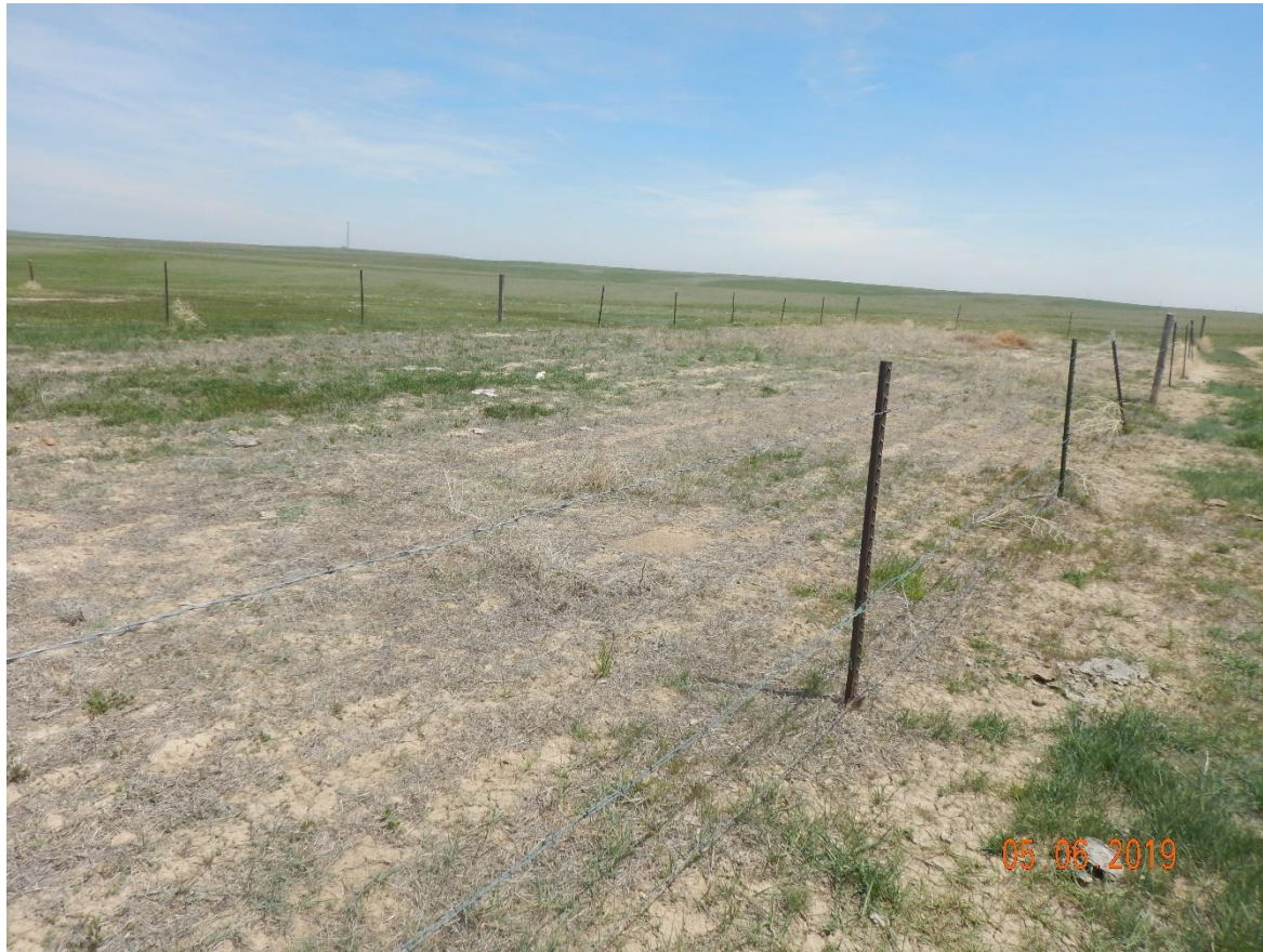
Photo 2: Photo taken from the south end of the tank battery location, facing east. Photo shows overview of the location, and that the vegetation over the reclamation is predominantly undesirable weedy plant species.