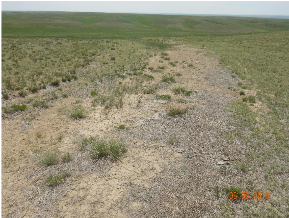
Photo 9: Photo taken from the access road west of the well location, facing south. Photo shows access road that leads to the well location has not been reclaimed in accordance with 1000 series rules and corrective actions (compaction alleviation, re-contouring, regrading, etc..).