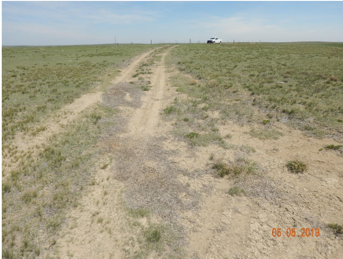
Photo 10: Photo taken from the access road west of the well location, facing north. Photo shows access road that leads to the well location has not been reclaimed in accordance with 1000 series rules and corrective actions (compaction alleviation, re-contouring, regrading, etc..).