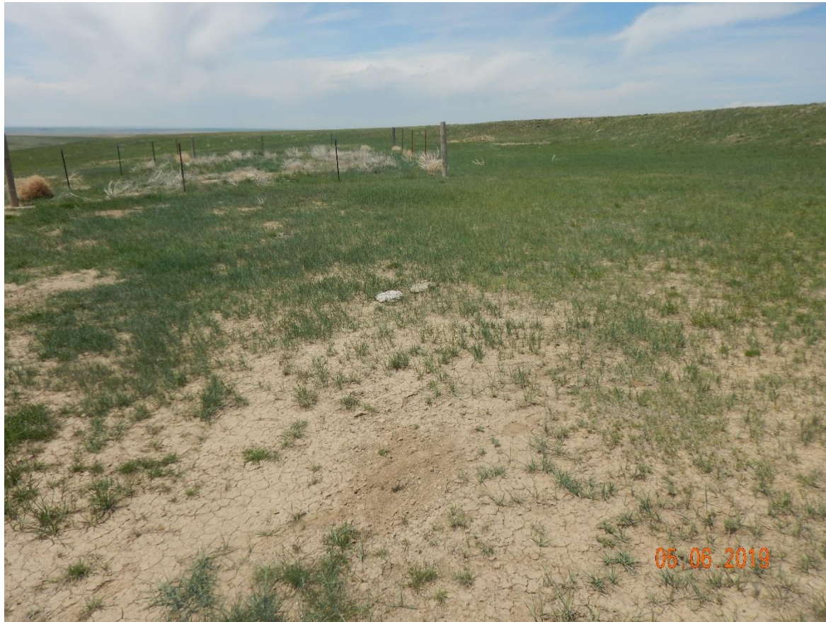
Photo 12: Photo taken from the east end of the location, facing west. Photo shows operator has failed to reclaim the entire location in accordance with 1000 series rules and corrective actions (re-contour/re-grade)