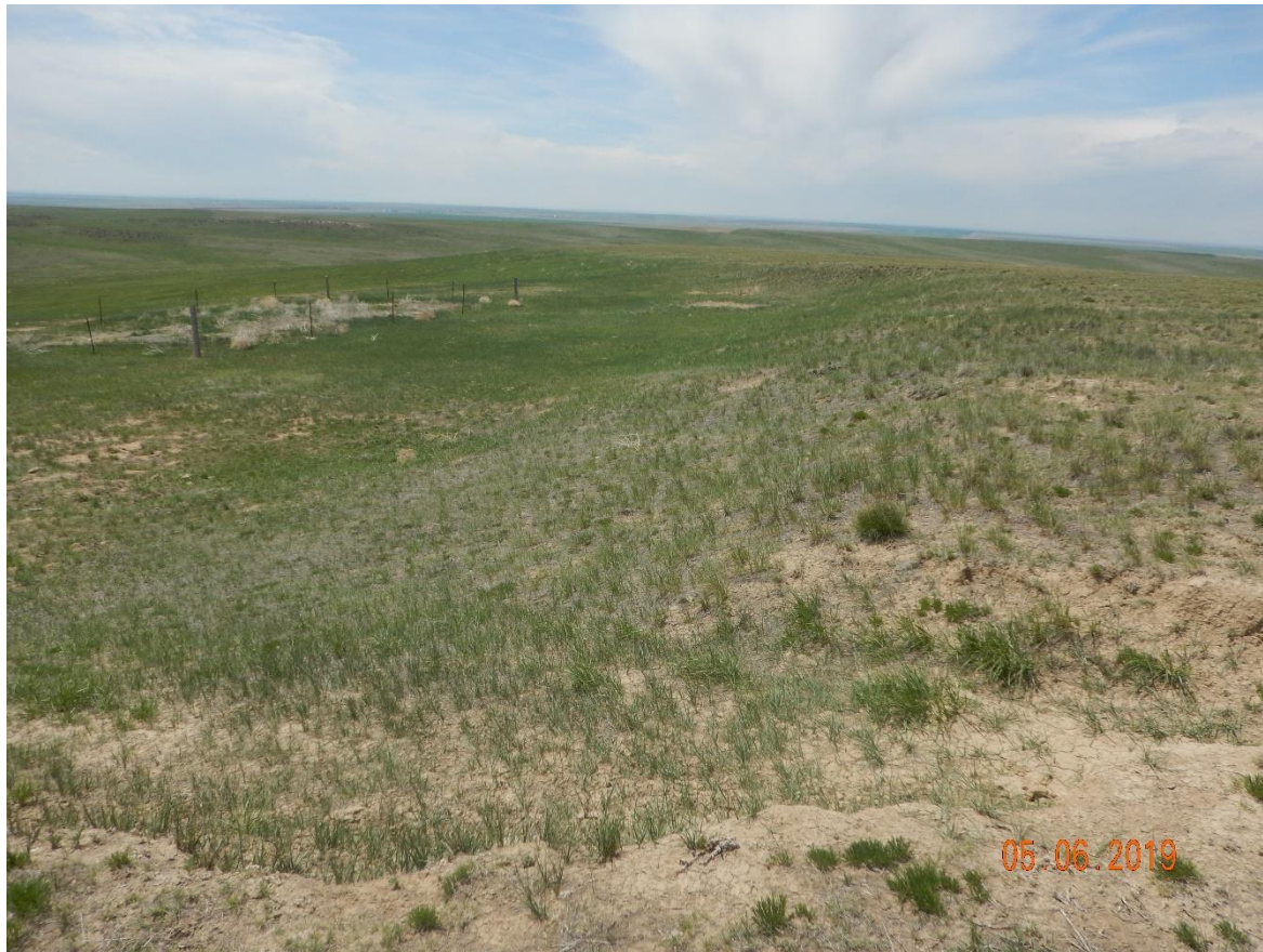
Photo 15: Photo taken from the northeast end of the location, facing west. Photo shows operator has failed to reclaim the entire location in accordance with 1000 series rules and corrective actions (re-contour/re-grade)