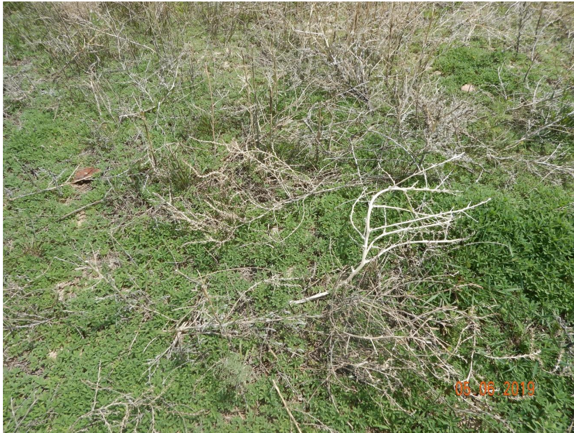
Photo 7: Photo taken from the battery location. Green vegetation observed in photo is undesirable weedy plant species observed throughout the location