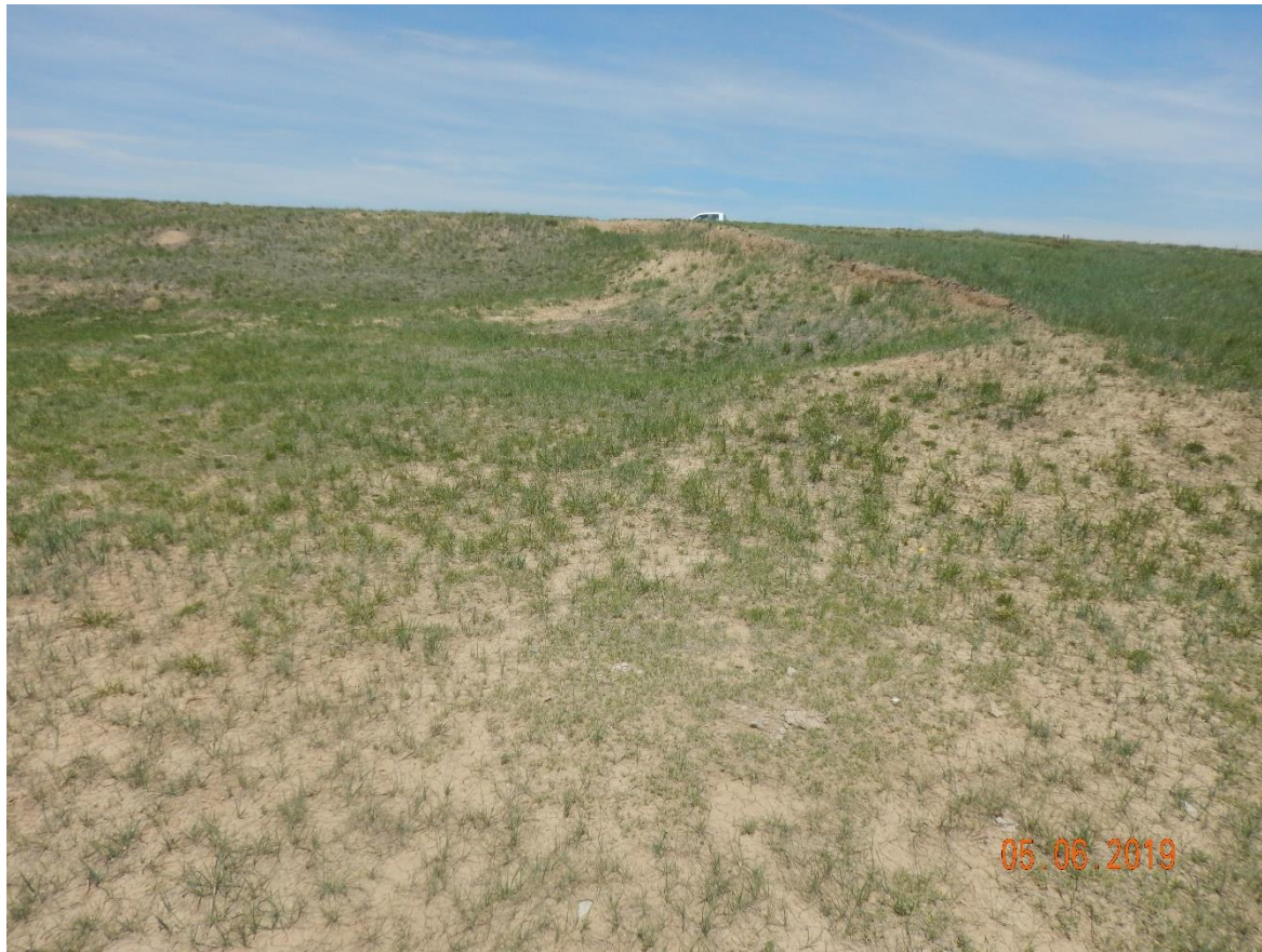
Photo 11: Photo taken from the east end of the location, facing north. Photo shows operator has failed to reclaim the entire location in accordance with 1000 series rules and corrective actions (re-contour/re-grade)