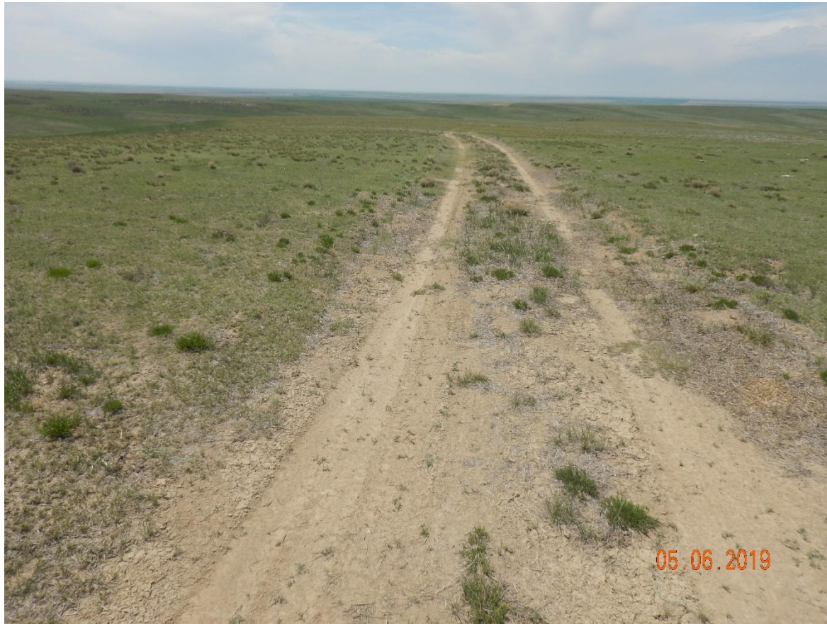
Photo 8: Photo taken from the west end of the battery location, facing southwest. Photo shows access road that leads to the well location has not been reclaimed in accordance with 1000 series rules and corrective actions (compaction alleviation, re-contouring, regrading, etc..).