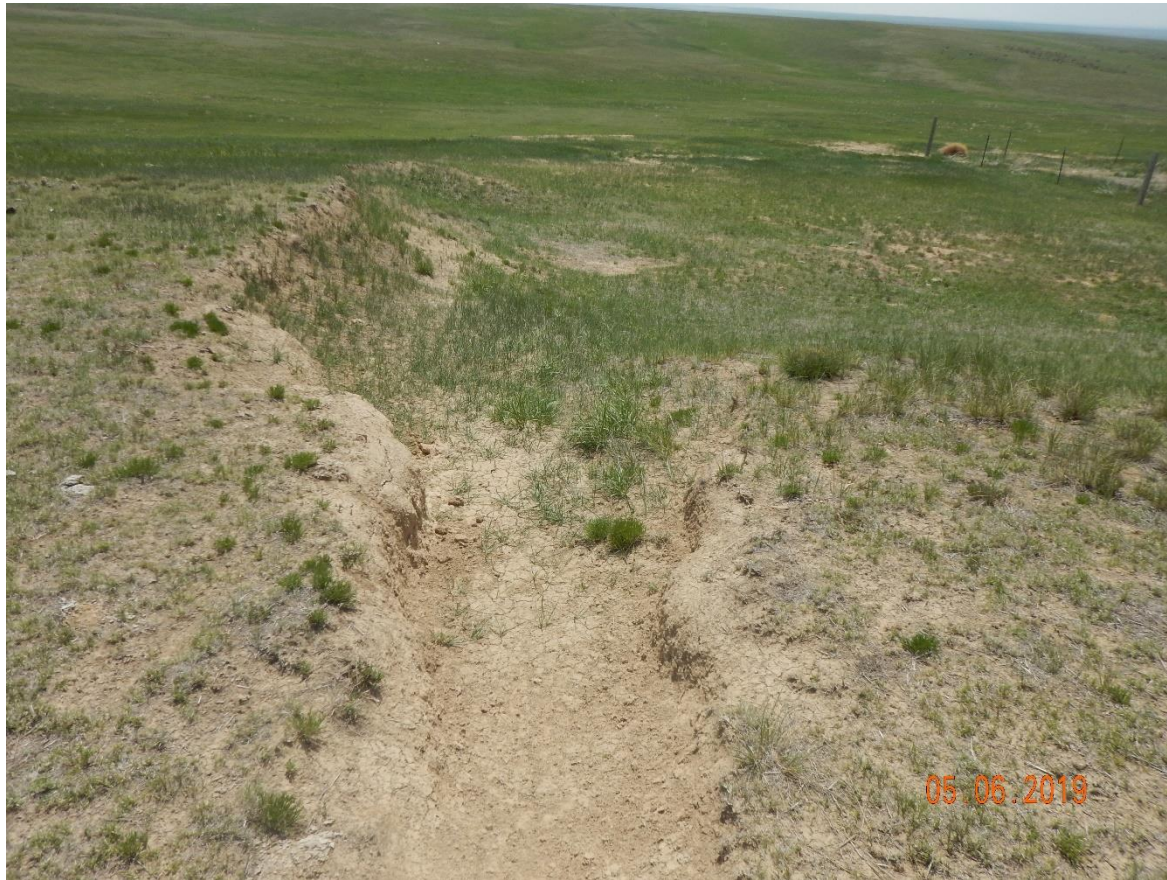
Photo 15: Photo taken from the northeast end of the location, facing south. Photo shows operator has failed to reclaim the entire location in accordance with 1000 series rules and corrective actions (re-contour/re-grade). Photo also shows erosion degradation on the cut slopes.