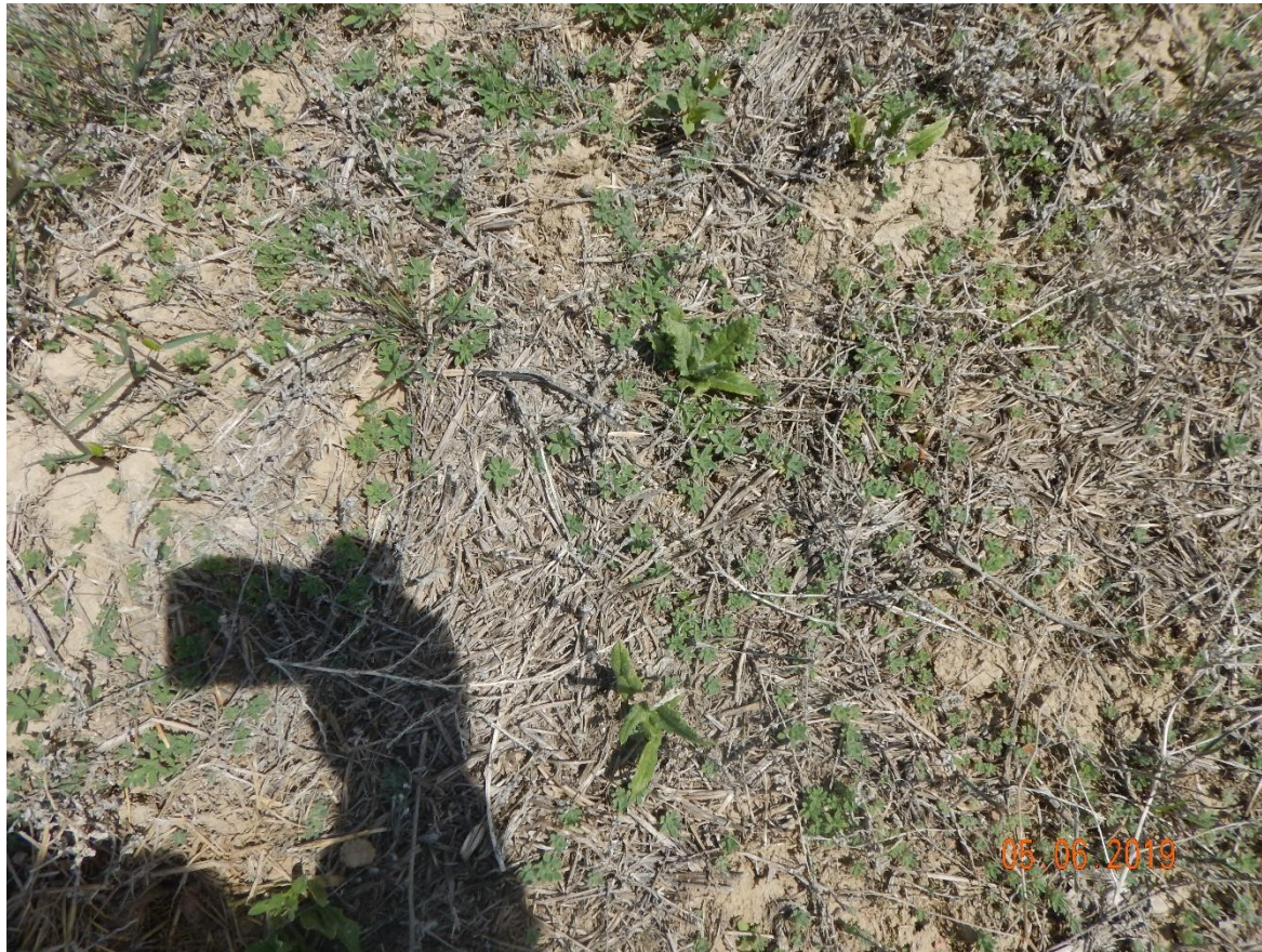
Photo 4: Photo taken from the battery location. Photo shows what appears to be bindweed ( Convolvus arvensis ) is establishing on the location. This is a Colorado State listed noxious weed. Previous inspections required operator to conduct noxious weed management.