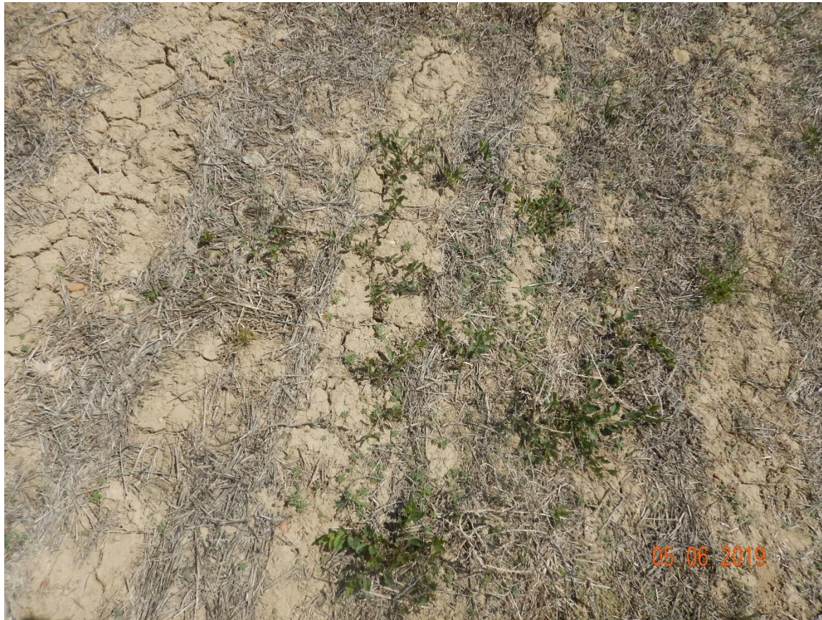
Photo 3: Photo taken from the battery location. Photo shows bindweed ( Convolvus arvensis ) appears to be establishing on the location. This is a Colorado State listed noxious weed. Previous inspections required operator to conduct noxious weed management.