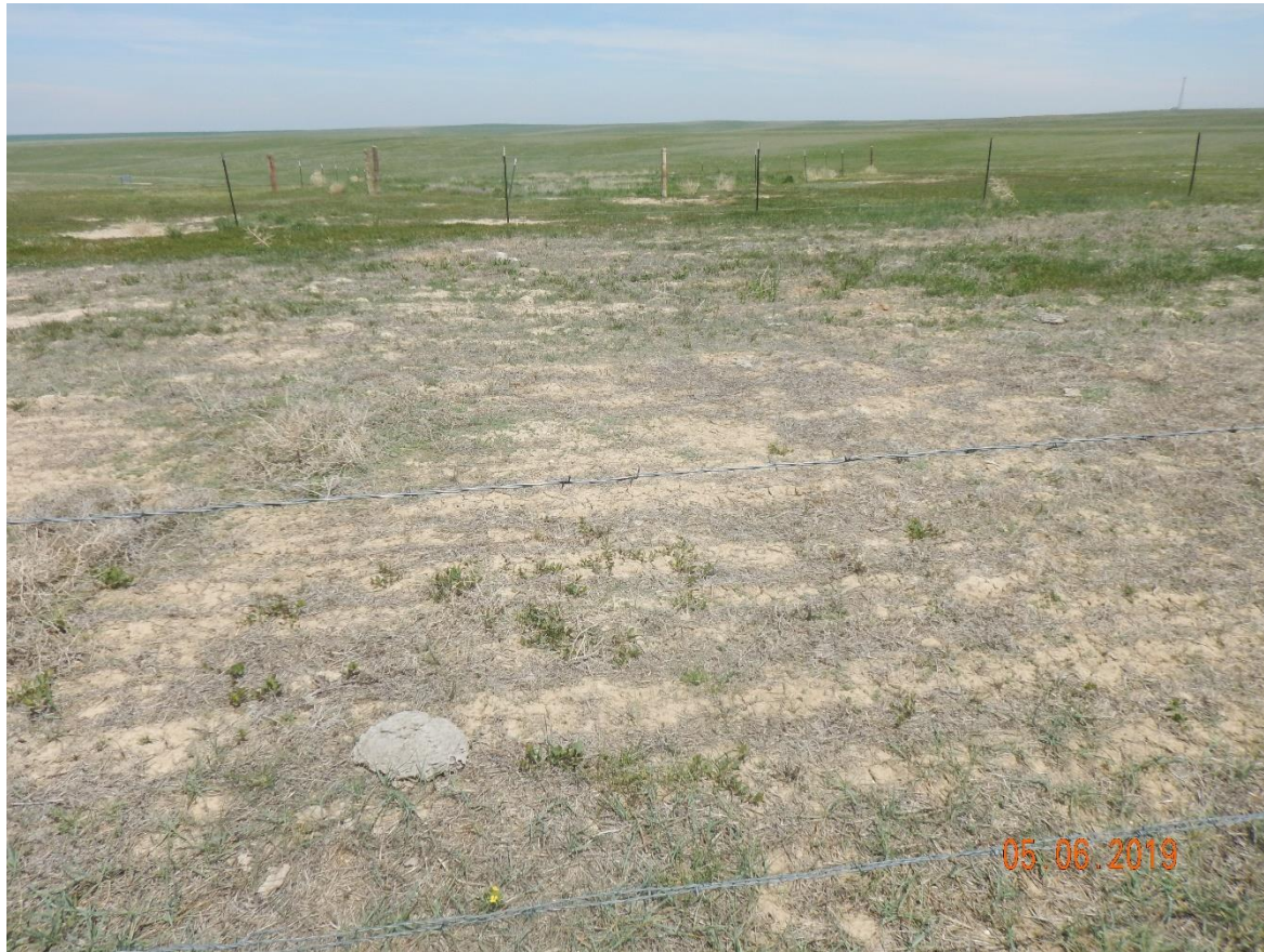
Photo 1: Photo taken from the south end of the tank battery location, facing north. Photo shows vegetation over the reclamation is predominantly undesirable weedy plant species.