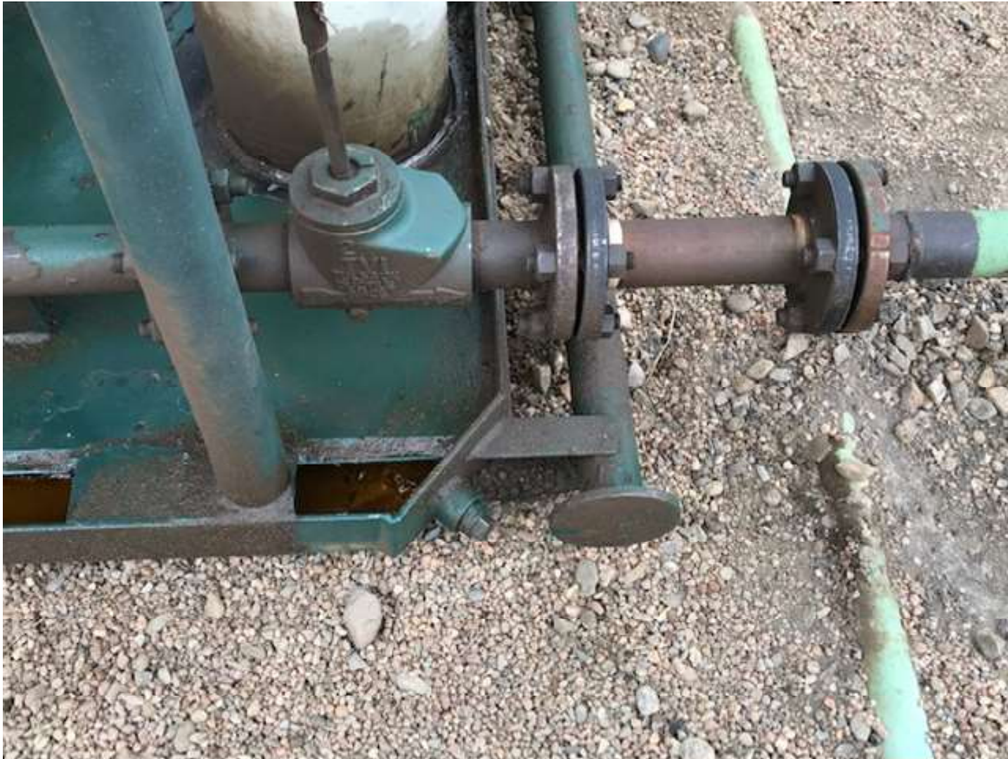
PHOTO 1: THE FLUID ACCUMULATION ON THE SKID WAS REMOVED. THE IMPACTED SOIL AROUND THE LIQUID RING COMPRESSOR WAS REMOVED FROM THE LOCATION. ALL VALVES AND FITTINGS WERE SECURELY FASTENED.

APACHE CANYON 26-01 API# 05-071-06134 – TIMBER CREEK OGCC OPERATOR NUMBER 10672 - DATE: MAY 06, 2019 CORRECTIVE ACTIONS COMPLETED REGARDING COGCC FIR DOCUMENT # 695100485