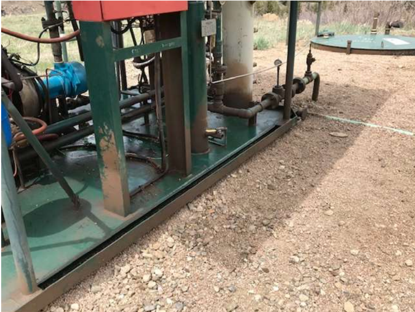
PHOTO 2:THE FLUID ACCUMULATION ON THE SKID WAS REMOVED AND THE SKID WAS CLEANED.

APACHE CANYON 26-01 API# 05-071-06134 – TIMBER CREEK OGCC OPERATOR NUMBER 10672 - DATE: MAY 06, 2019 CORRECTIVE ACTIONS COMPLETED REGARDING COGCC FIR DOCUMENT # 695100485