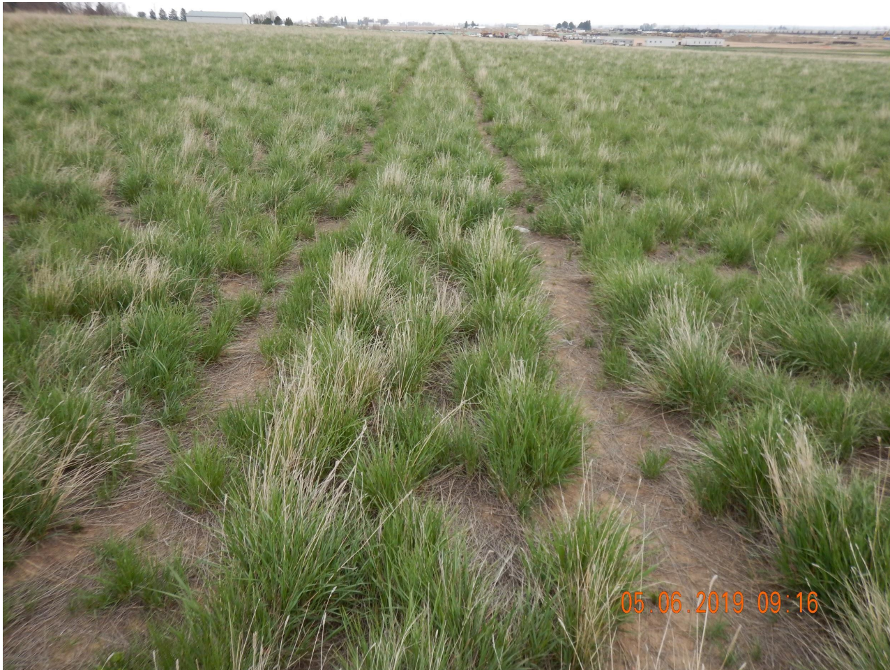
Photo 2. Photo taken from another portion of the access road, facing South. See comments under Photo 1.