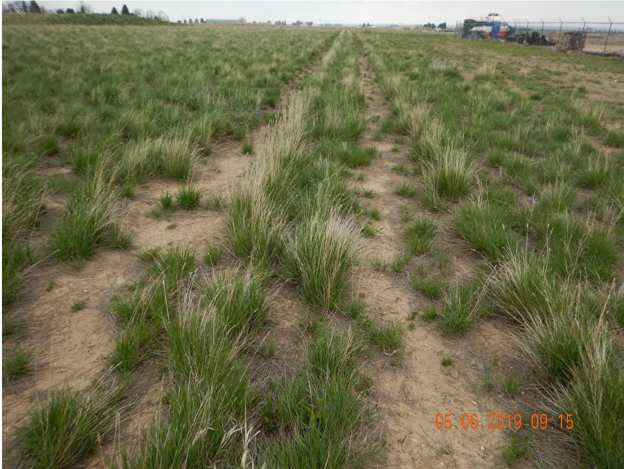
Photo 1. Photo taken from a portion of the access road, facing South. Access road is evident and has not been reclaimed per Rule 1004. It does not appear that the Operator has performed final reclamation activities throughout the access road. Reference area vegetation consists mostly of Crested wheatgrass and Smooth brome.