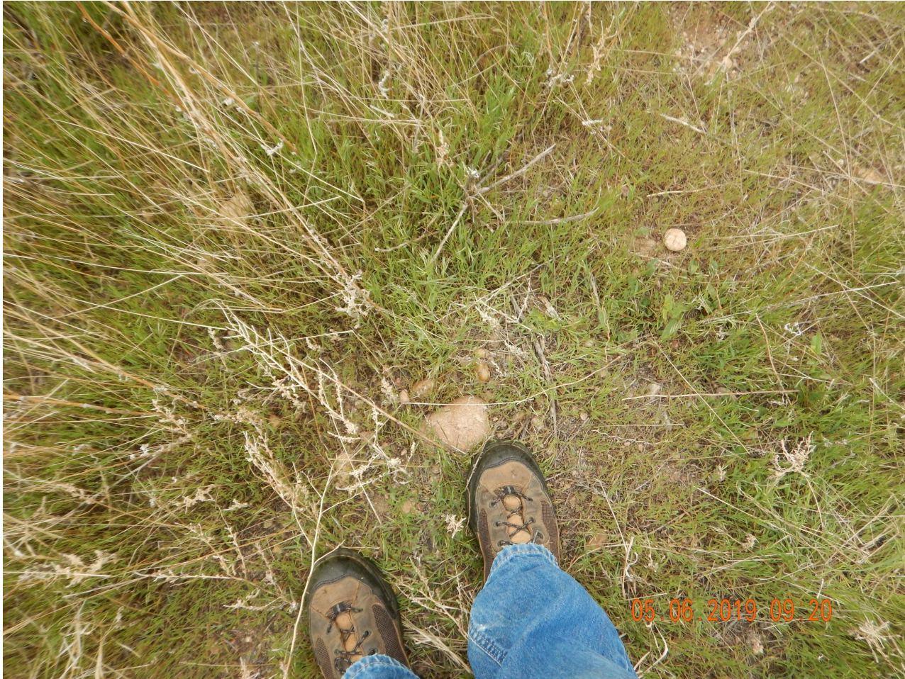
Photo 4. Photo taken from the tank battery location. Photo illustrates gravel which has not been removed from location and Cheatgrass.