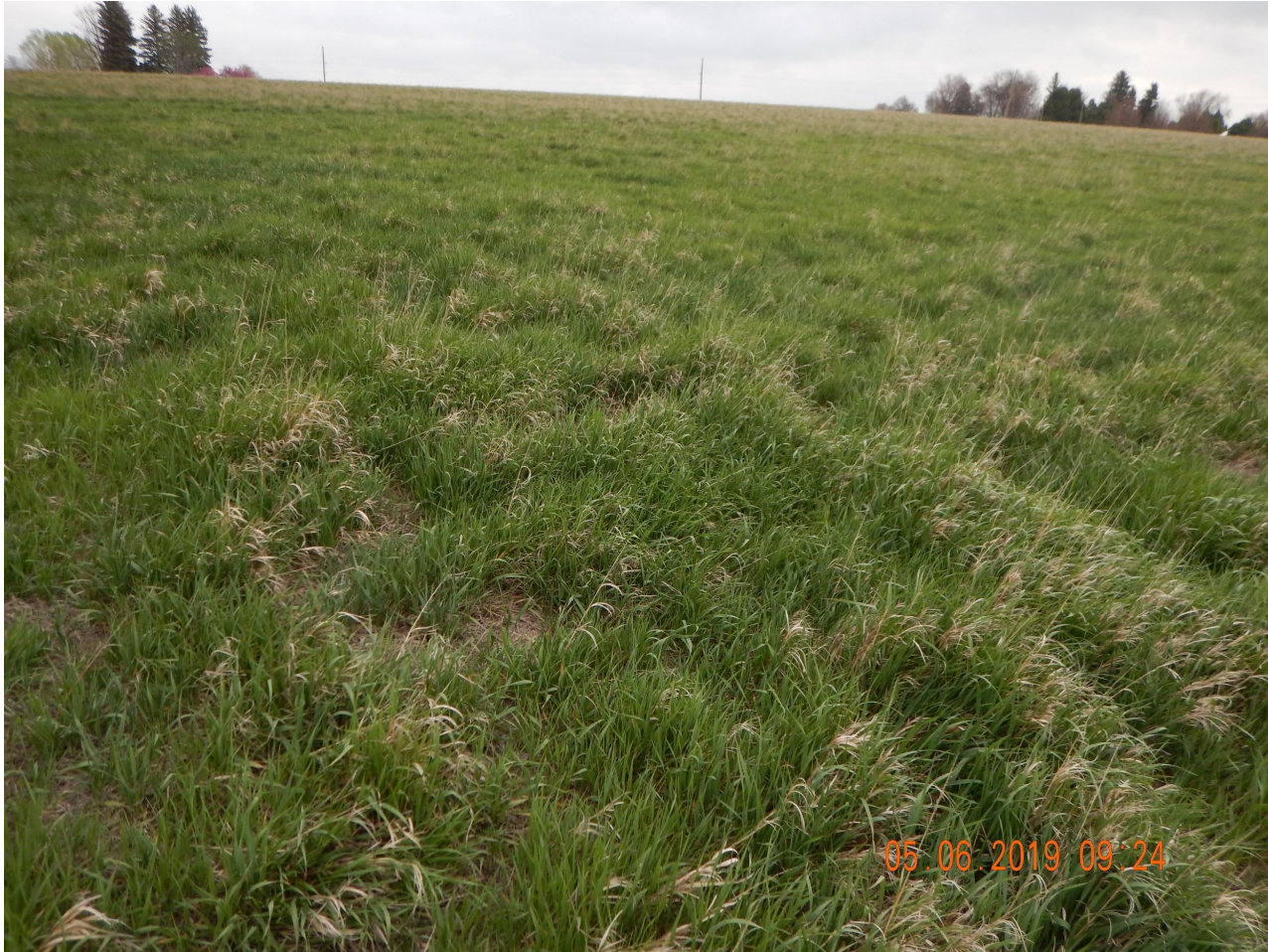
Photo 7. Reference photo taken north of the tank battery location, facing East.

Inspection Photos Location Name: HARSH #1 API #: 05-123-11416