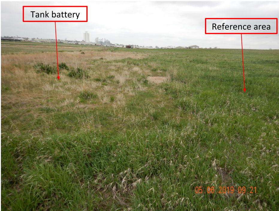
Photo 5. Photo taken from the southeastern tank battery, facing North. Photo contrasts the reference area vegetation with the tank battery vegetation.