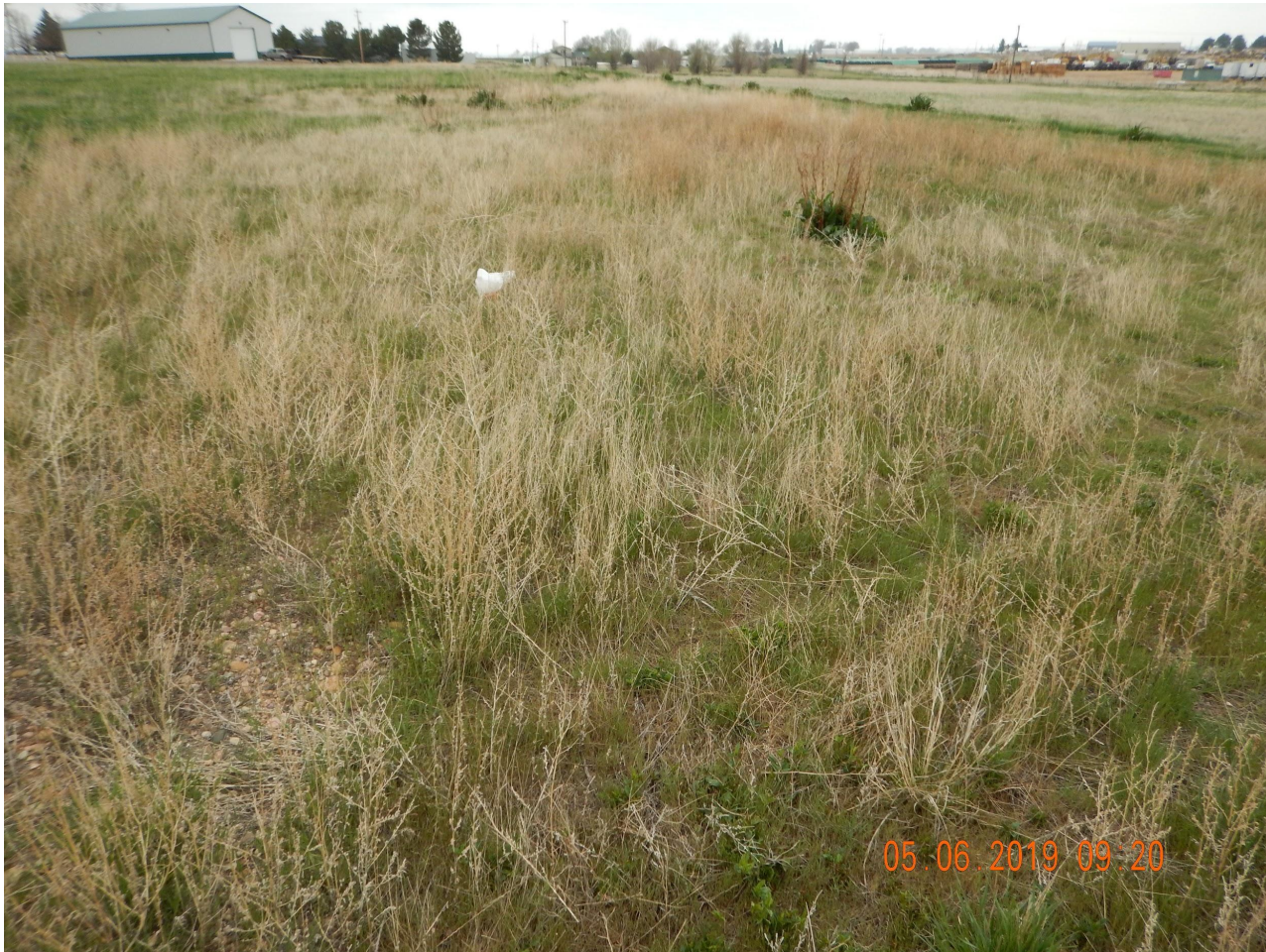
Photo 3. Photo taken from the tank battery location, facing South. Operator has failed to perform final reclamation activities at the tank battery location. Vegetation mainly consists of Cheatgrass, Kochia and Field bindweed, all undesirable species.