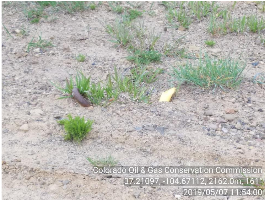
PHOTO 3: NO ANCHOR MARKER ON NORTHWEST ANCHOR. Install proper guy line markers per Rule 1003.a CA DATE 6/7/19